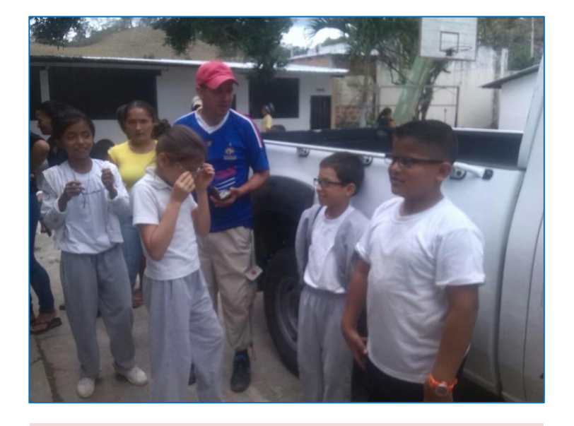
Left and above: The campaign in Manabí on the western coast of Ecuador, where the earthquake occurred in April this year. Although many families left the area following the quake, the poorer families have tended to stay, and were very appreciative of our help with glasses.