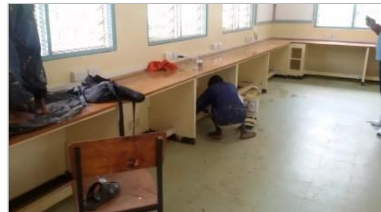
Electrician wires the classroom