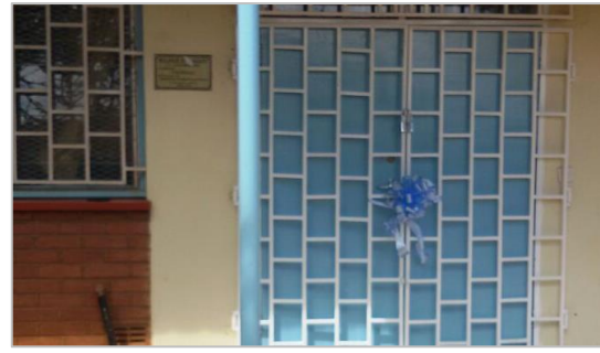
Ready for the opening ceremony