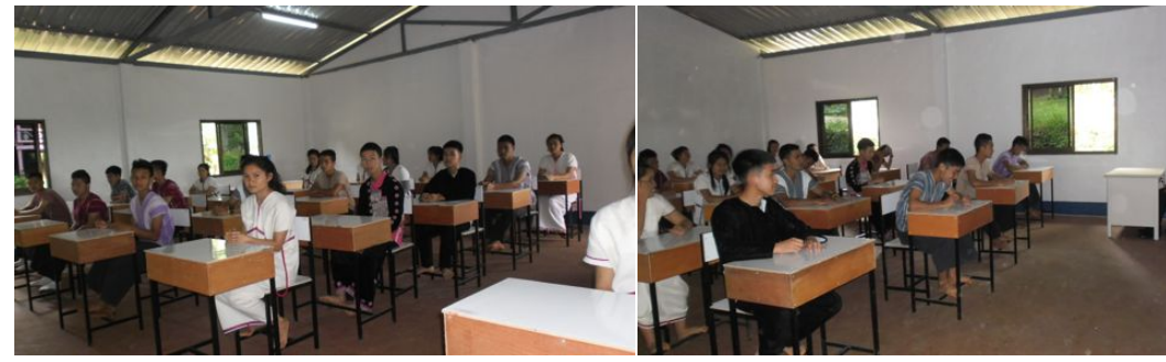
Furniture really in use November 2015