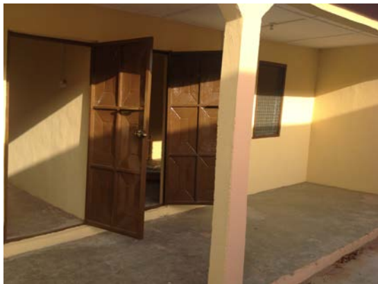
Steel doors keep the rooms secure and glass brings light and a view.

All cracks in the building were carefully repaired.. The ceiling was replaced. An electrical system was installed . Wooden doors (damaged by termites) were replaced by rust-resistant metal ones. All window frames were replaced. In order to delay future weather-caused erosion, we built 'aprons' around the structure . The teachers are very pleased with this, it gives a much-needed boost to morale. This helps them to have increased contact time with pupils, give extra help and also encourages them as they engage with illiterate women, teaching them basic literacy and numeracy in the evenings.