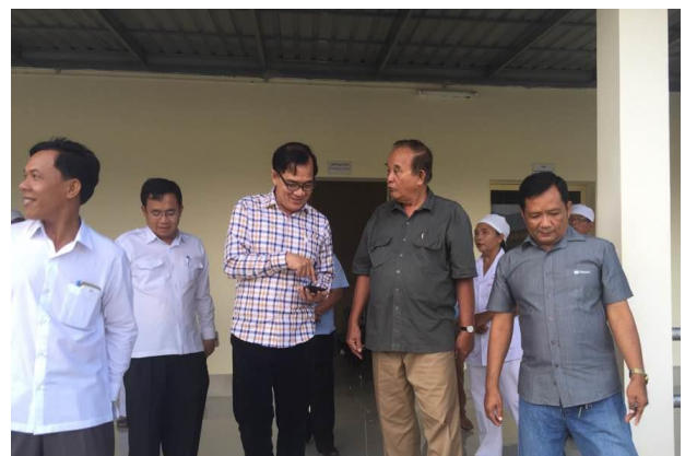
The Cambodian Minister for Health inspecting the new Maternity Unit and equipment