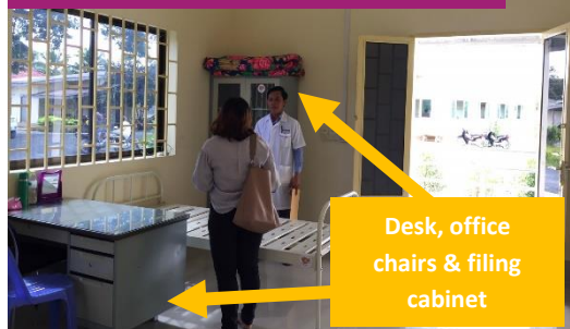
Desk, office chairs & filing cabinet