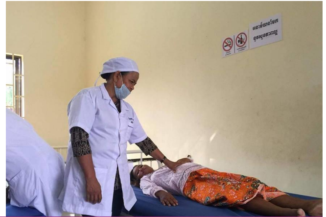
Hospital midwives attending to patients; and below some new arrivals born in early September