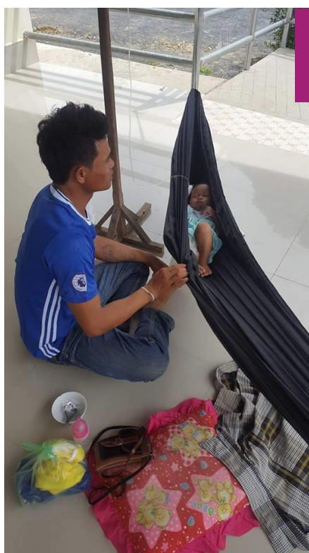
The Maternity Unit's airy veranda provides additional space for families caring for sick children