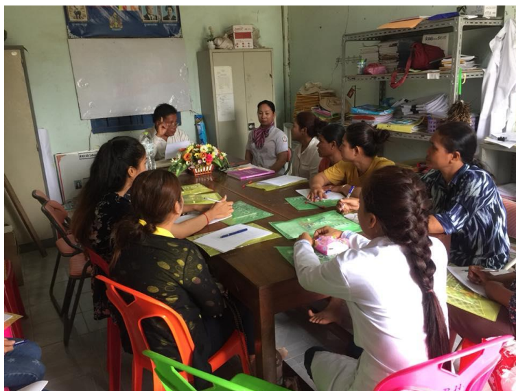
The refresher training brought together midwives from Svay Chek and all the health centres under it

Refresher training in preventing postpartum haemorrhage and resuscitation techniques and ultrasonography was conducted at Svay Chek Hospital on 26 th February to 02 nd March, 2018. There were 22 participants altogether because as well as the midwives from the hospital we took the extra opportunity to invite the heads and midwives from the seven health centres under Svay Chek (Ph'koim, Ta Pho, Slor Krarm, Chork Puok, Sarung, Treas and Rorluos). One trainer was from Thmor Puok hospital and another was from the Provincial Health Department.