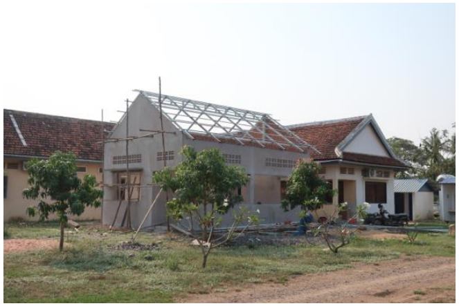
These photographs show the building at 80% completion point

The building was completed in April 2018