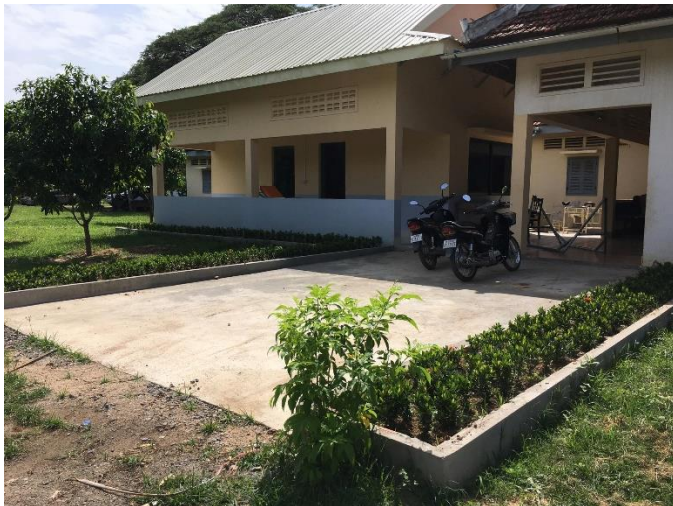
Below is the new ultrasound room

The building was completed in April 2018