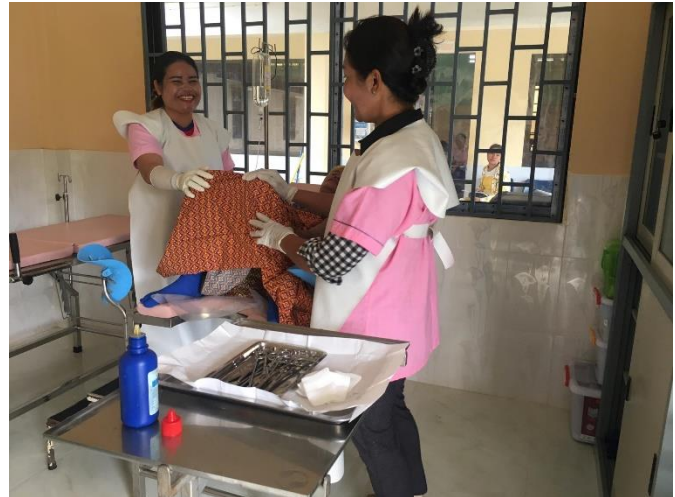
The two new delivery beds are now in use

Refresher training in preventing postpartum haemorrhage and resuscitation techniques and ultrasonography was conducted at Svay Chek Hospital on 26 th February to 02 nd March, 2018. There were 22 participants altogether because as well as the midwives from the hospital we took the extra opportunity to invite the heads and midwives from the seven health centres under Svay Chek (Ph'koim, Ta Pho, Slor Krarm, Chork Puok, Sarung, Treas and Rorluos). One trainer was from Thmor Puok hospital and another was from the Provincial Health Department.