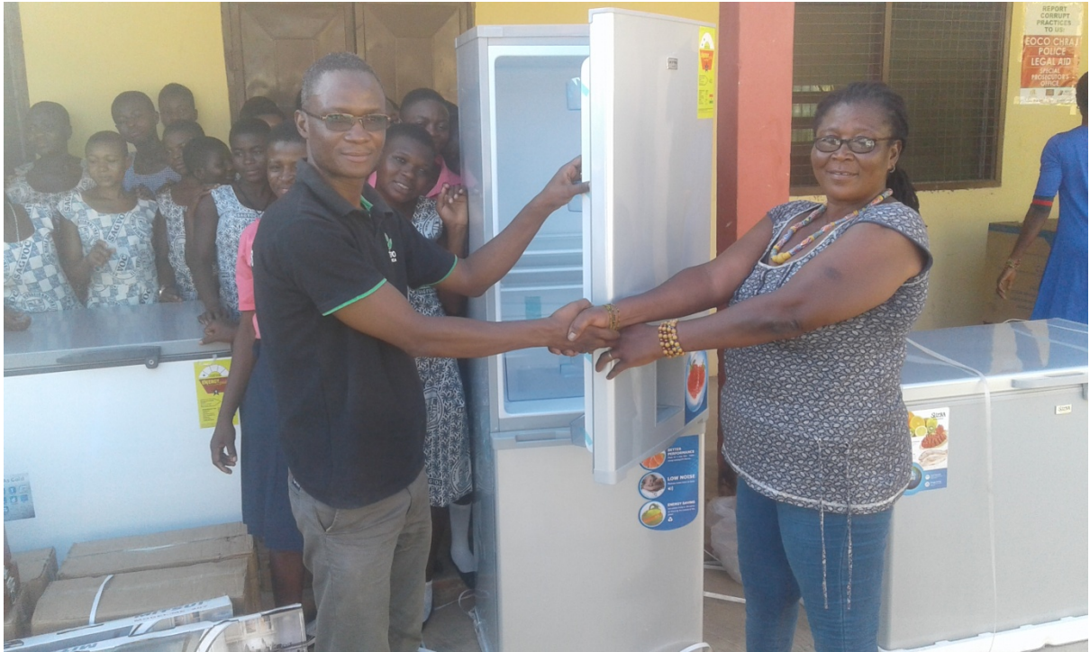
Freezers and Fridges for Sawla.