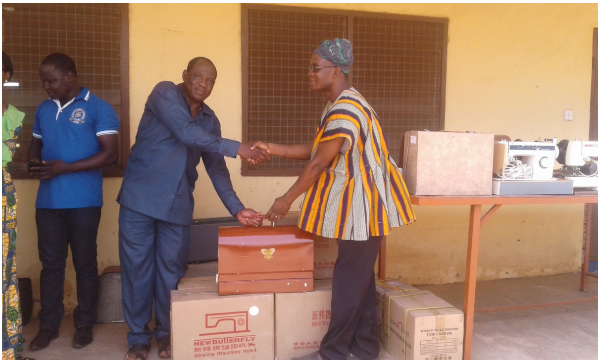
Some of the Sewing Machines for the dress-making students at Sawla, Karaga and Savelugu.