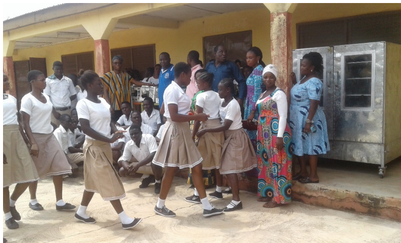
Students at Savelugu receiving their new equipment.

One of the new catering ovens, these are to enable the students to have the skills they need for employment in eg. Hotel Industry.