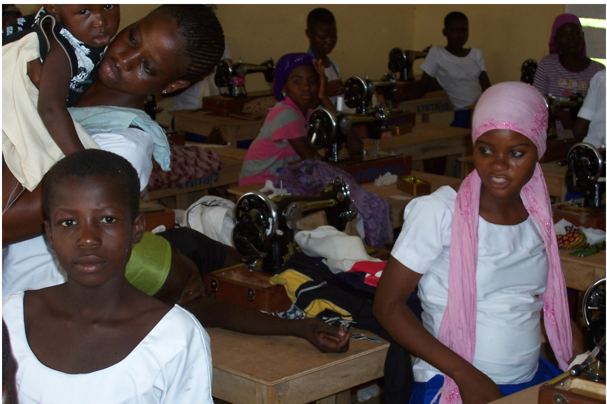
Tailoring Students at Karaga.