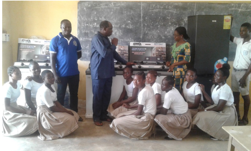
Headmistress and students receiving catering equipment at Savelugu Vocational School.

course for absorption by Ghana Education Service and, if the pattern in other schools is followed, will develop into an important player in the prosperity of the district. This will lead to improved health, smaller families and the likelihood of every child being able to attend school regularly.