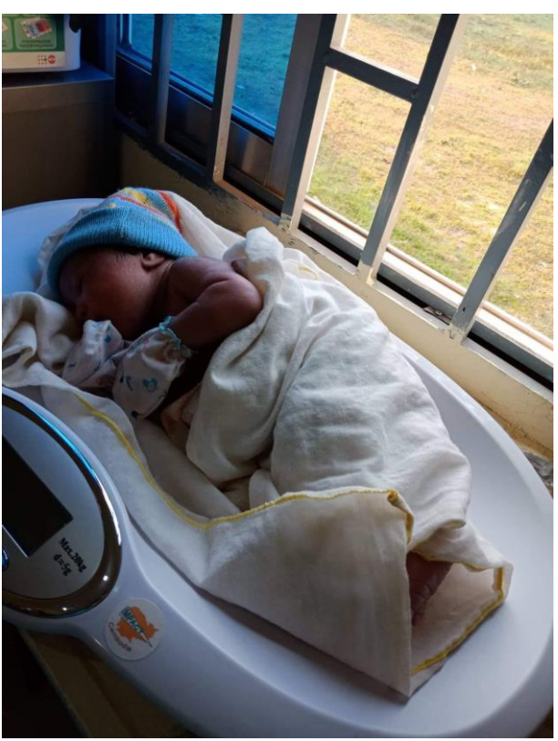
Her baby girl arrived safely and was weighed using the new scales