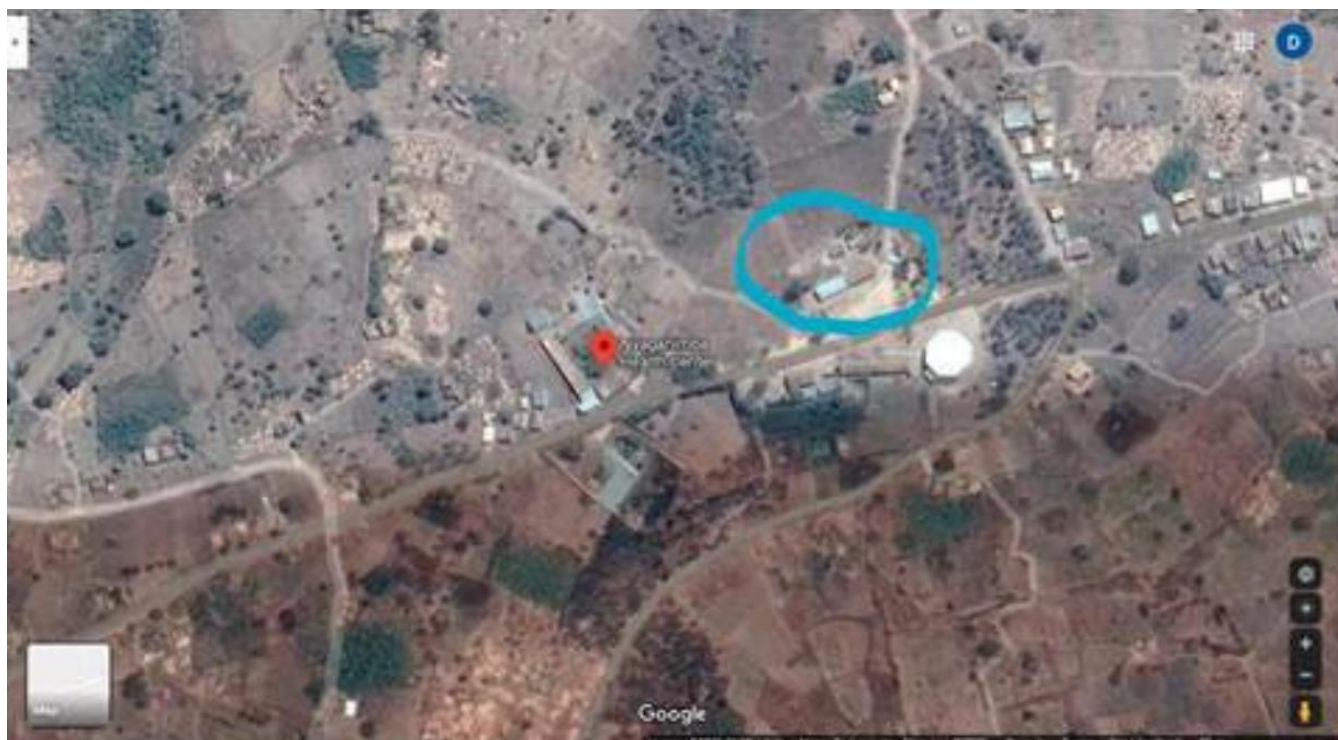
Figure 2: Nyagihamba Primary School is showed above in the blue circle. Prior to the construction of new classrooms, the school was split across the main road depicted in the picture.