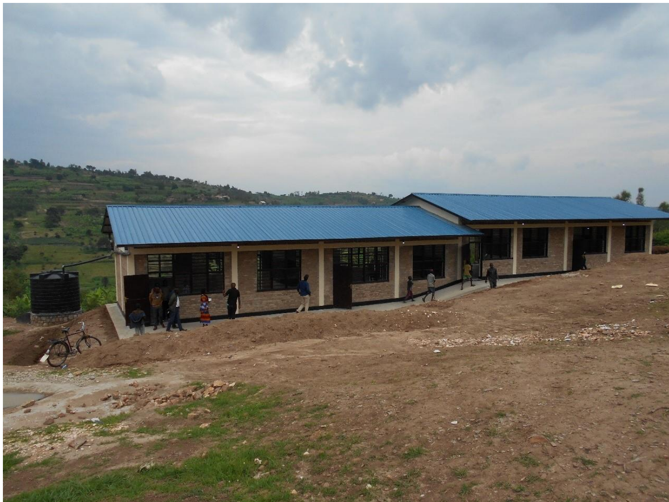
Figure 9: Picture of the new classrooms – taken on the day pupils returned