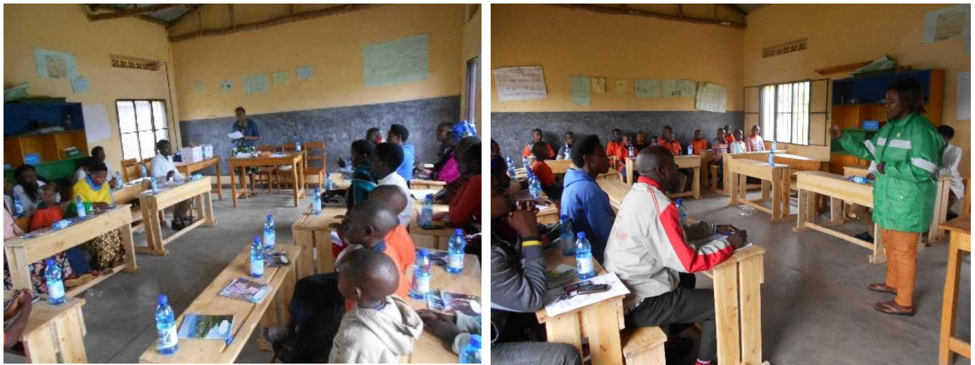
Figure 7 and 8: School management and WASH training