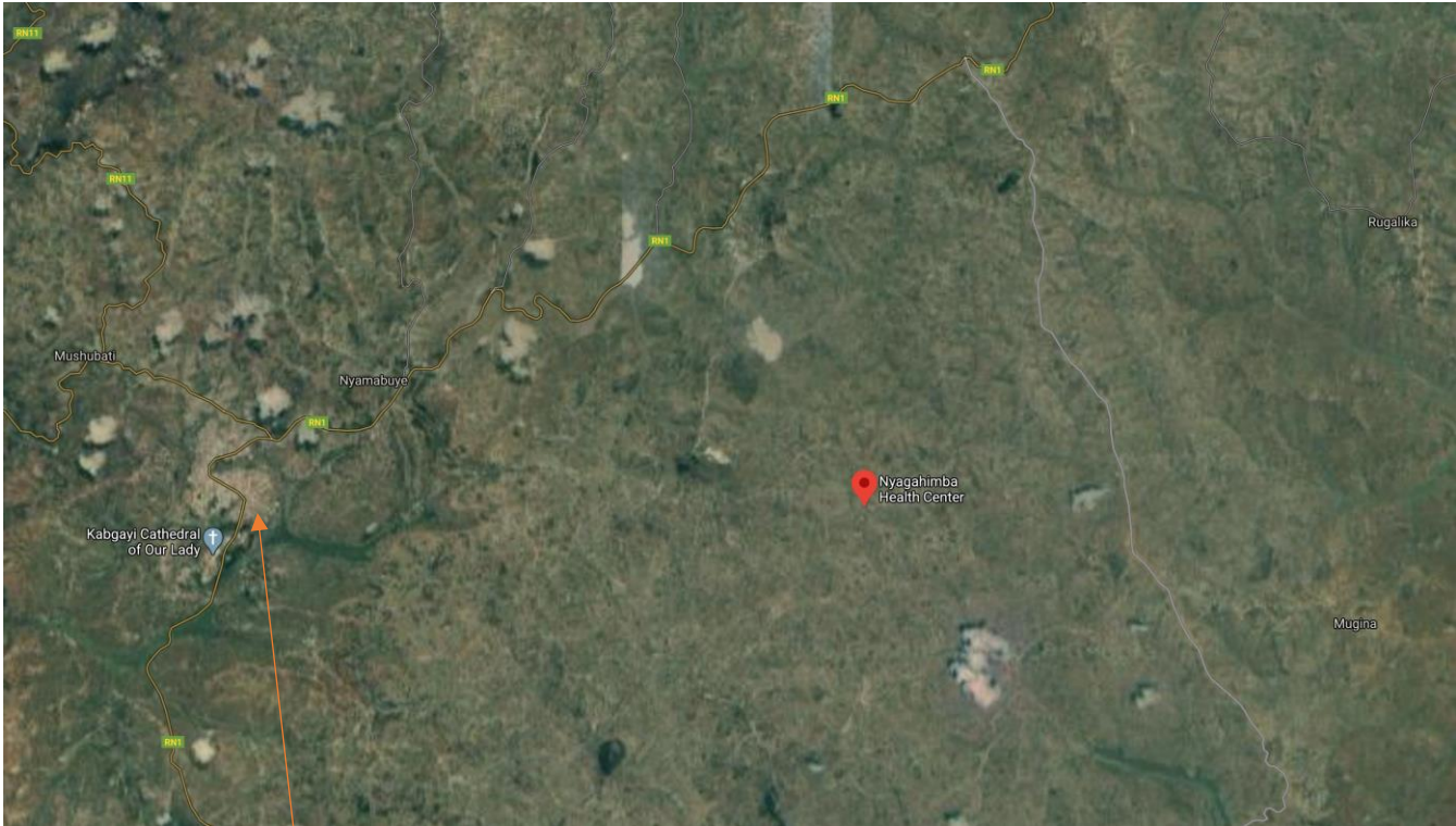
Figure 1: The orange arrow shows Muhanga town, the closest town to Nyagihamba Primary School, in relation to the location of Nyagihamba Primary School (close to the marked Nyagihamba Health Centre).

Nyagihamba Primary School is located in Kambeyi Cell, Nyarubaka Sector, Kamonyi District, Southern District, Rwanda. Its nearest town is Muhanga. The catchment population for Nyagihamba Primary is 13,693. The satellite images below show Nyagihamba Primary School in relation to its nearest town, Muhanga town, as well as close up.