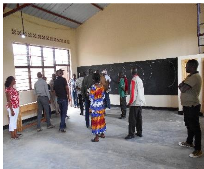
Figure 4: Inside one of the new classrooms