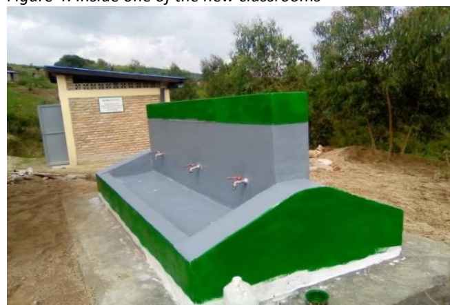
Figure 6: The constructed hand washing facility with three taps on each side