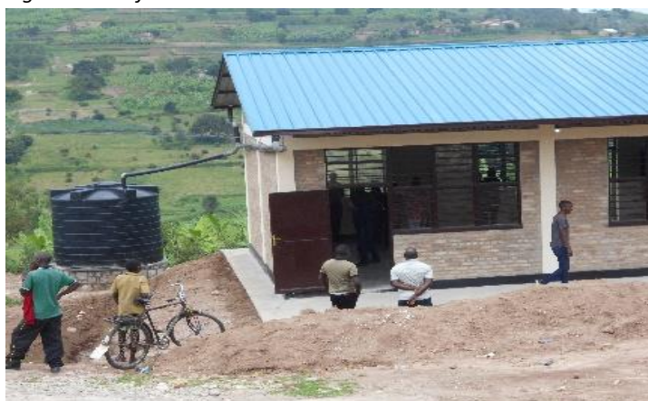
Figure 5: A 10 m 3 water tank installed next to the classrooms