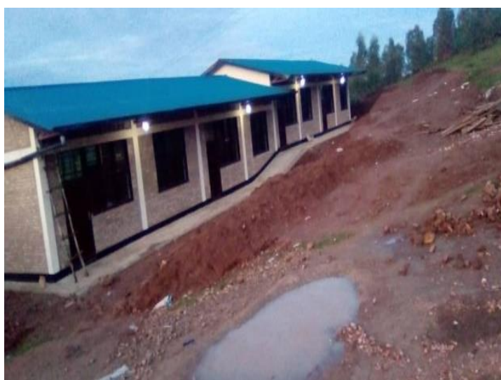
Figure 3: The four new classrooms