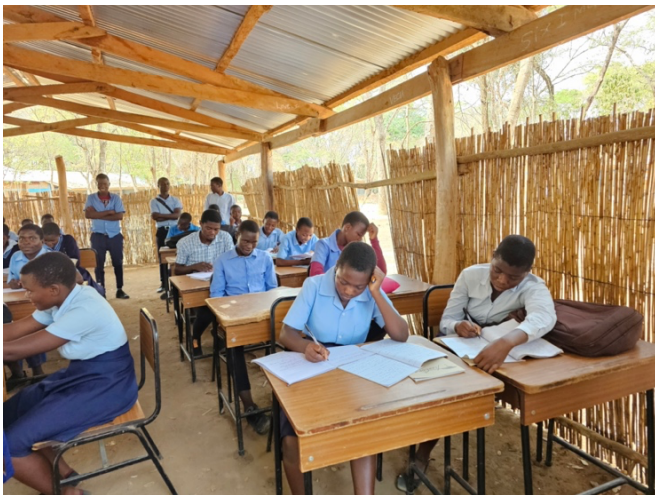
Students using temporary outdoor classroom

Work commenced on the build in May 2024 after the ground had dried out sufficiently following flooding in the rainy season. Most of the building work took place over the summer school holiday and was completed on the 15 th of October. Building work stopped temporarily during the exam period to avoid any disruption to students sitting their exams at the end of Form 2 and Form 4.