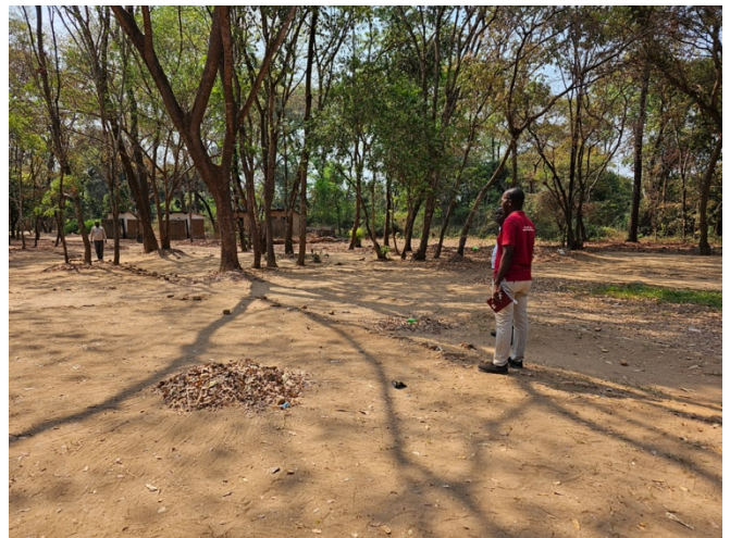
Assessing the location for the new classroom block