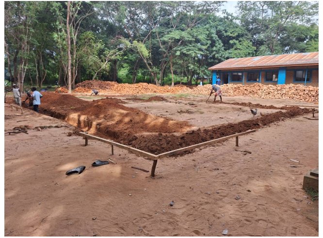
Foundations were dug in May 2024