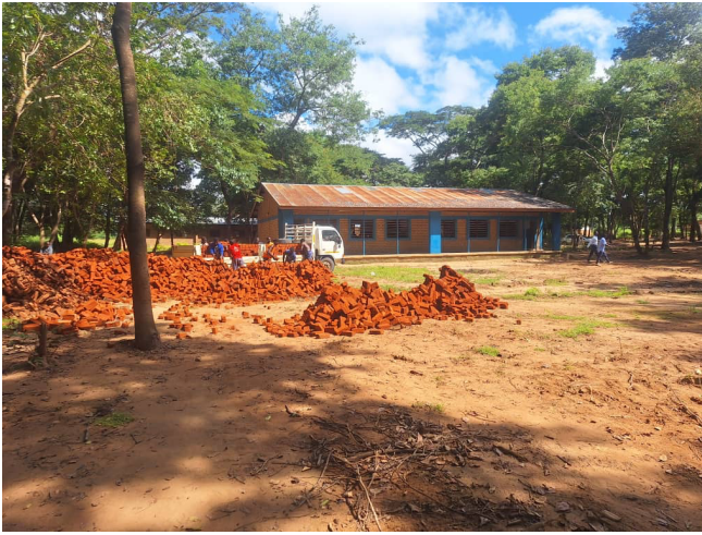
Bricks were transported to the school site in April 2024