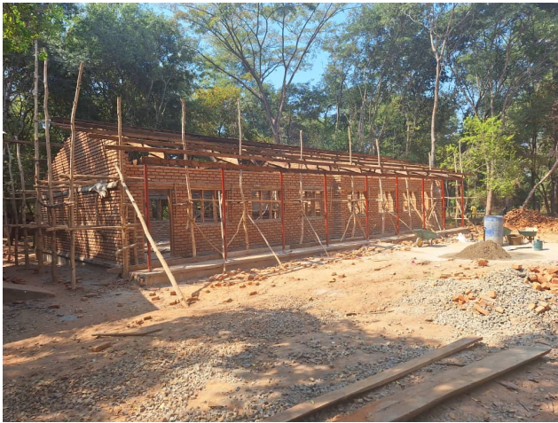
Building progress August 2024