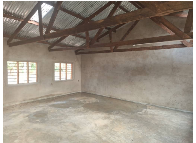
September 2024 – plastering and flooring completed