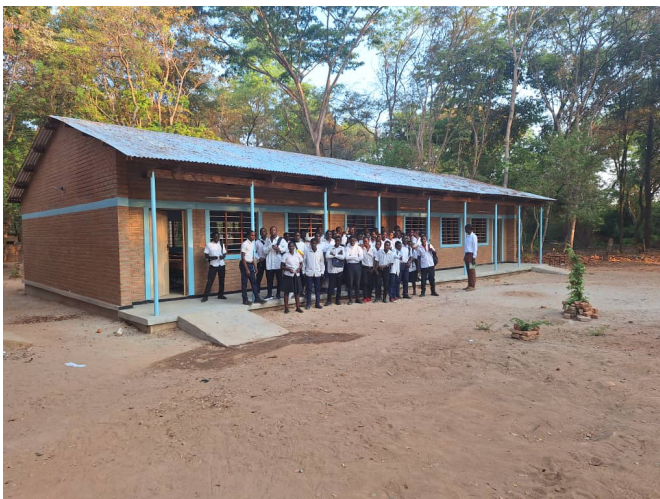
The completed classroom block – a great new learning environment for the students