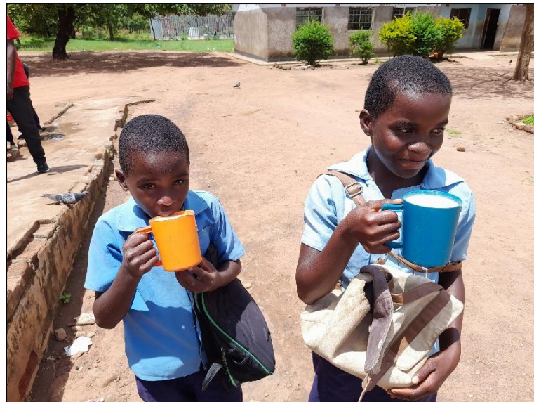
Two school children smiling and enjoying their school meal at Nsingo Primary School in Zambia!