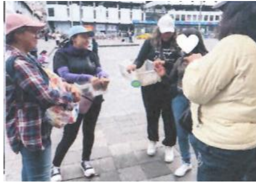
The work of End Slavery Ecuador

The eye tests took place on March 13 th , 2025. In total, 105 young people were tested, 82% of whom were found to need glasses.