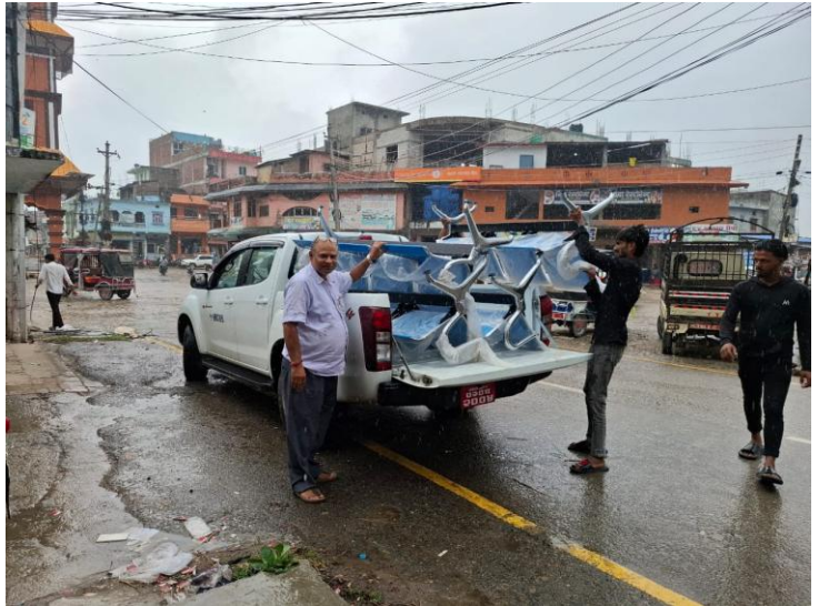
The Hi-lander loaded with furniture and equipment destined for IN's ear care centre in Gaur