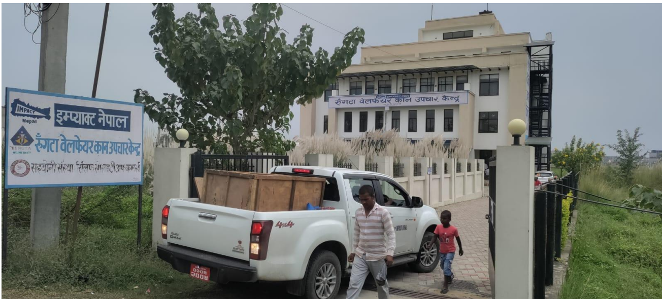
A new operating theatre table arrives at IMPACT Nepal's Birgunj Ear Care Centre

Finally, the vehicle has enabled the delivery of equipment and supplies to project areas, for example, the ENT equipment for three ear care centres that Fondation Eagle also funded in this funding round).