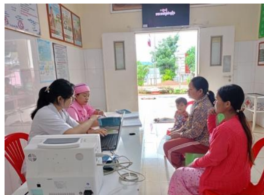
Below: A family is provided with Birth Spacing counselling