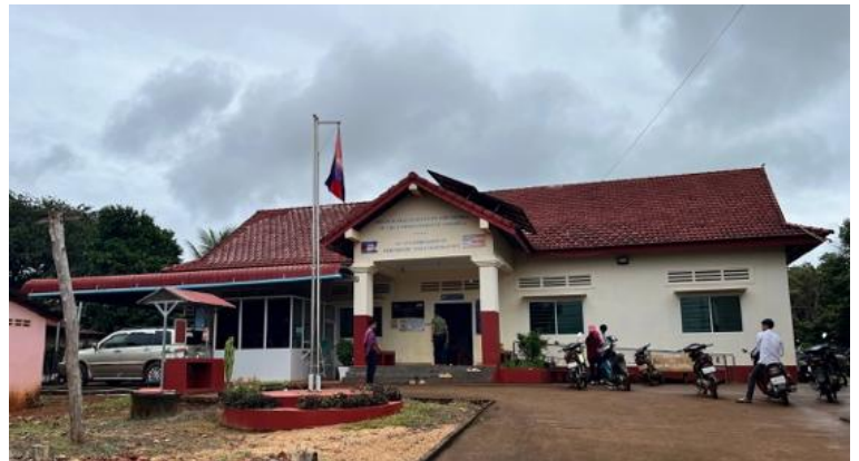
Keh Chong Health Centre, Ratanakiri Province

Period of Project: 10 th December 2024 – 9 th December 2025