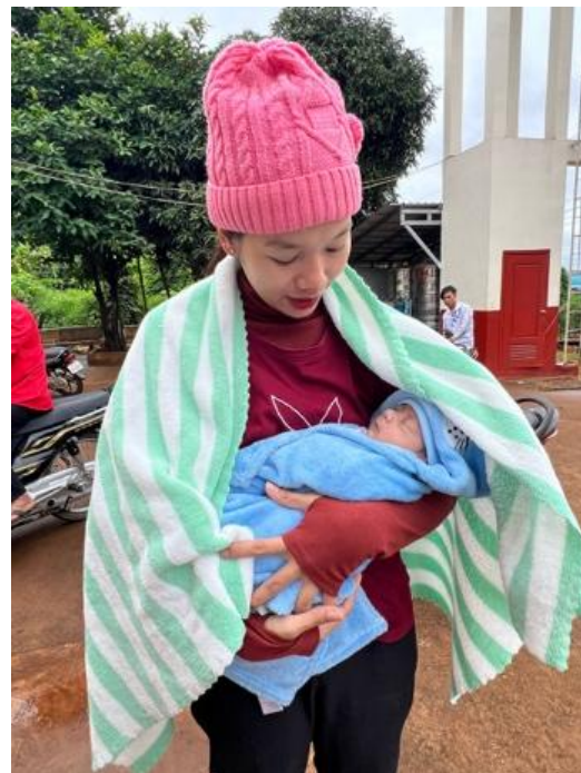
Above: A mother holds her newborn outside Keh Chong Health Centre

As reported in the interim report, the equipment was delivered in February 2025. Thanks to these vital pieces of equipment, the Health Centre is now far better equipped to care for multiple patients at the same time, helping to ensure safer and more effective maternal care.