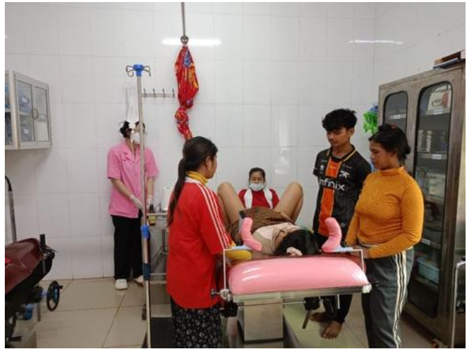
The new delivery beds are fully adjustable and easier for both staff to operate and patients to use in comfort.