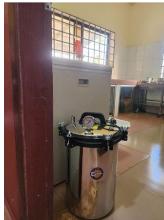
Midwife Ven Vannak demonstrating the new autoclave

‘I have worked here since 2017. The health centre has always faced a lack of maternity equipment, which was one of the main challenges in providing proper health-care services to the people in the village. The delivery room is on the first floor, while the autoclave was located on the ground behind the building. During the day it was manageable, but at night it was difficult—we had to go downstairs and make a fire to sterilise delivery materials, as we could not leave them unsterilised until morning. We did our best with no other options. I am really grateful for the equipment that IMPACT Cambodia has donated. The new autoclave will ease my work and is such a great relief for us.’ – Midwife Ven Vannak