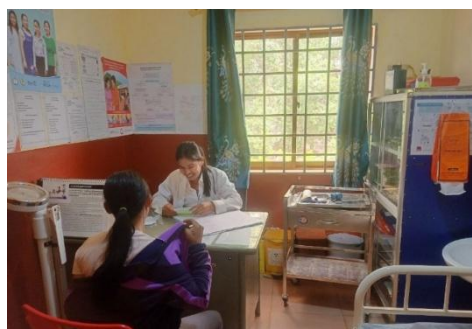
The equipment in situ at Malik Health Centre