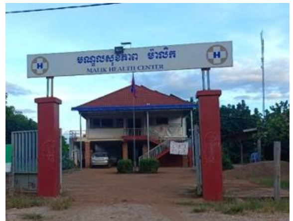
Malik Health Centre

Project beneficiaries: Malik Health Centre serves a rural population of 4,166 people. Since receiving the new Eagle-funded maternity equipment, the Health Centre has provided 2,724 general health interventions. Including 564 vaccinations; 567 ante and postnatal interventions; and 64 safe deliveries.