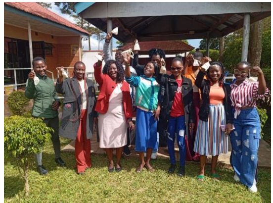
Ripple Africa Tree Planting and Cookstove staff after receiving their menstrual cups