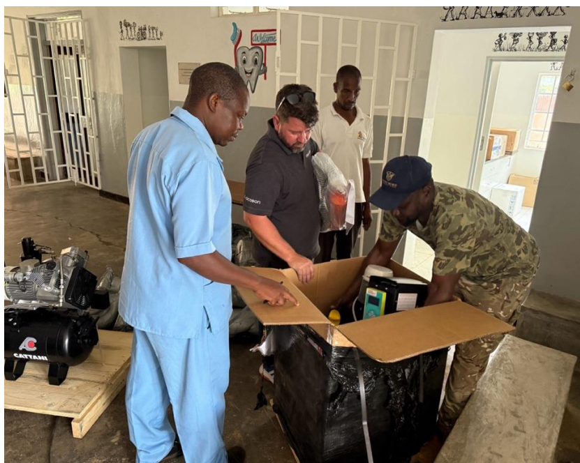
Unpacking the equipment