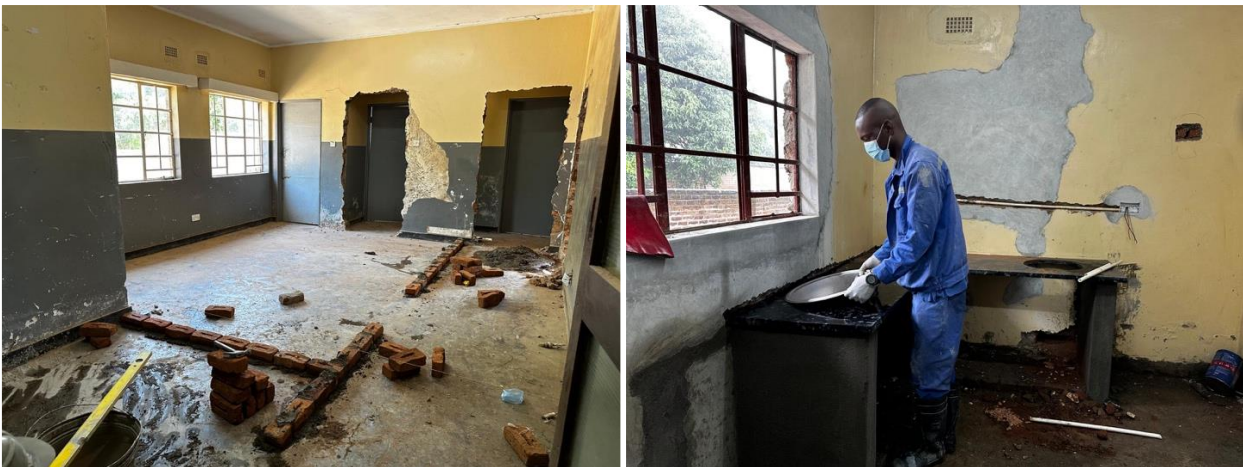
Construction work underway on the new Dental Clinic

Construction work at the Health Centre commenced in September 2024, with the arrival of BM Contractors on site. Work on the Dental Clinic commenced in early 2025: