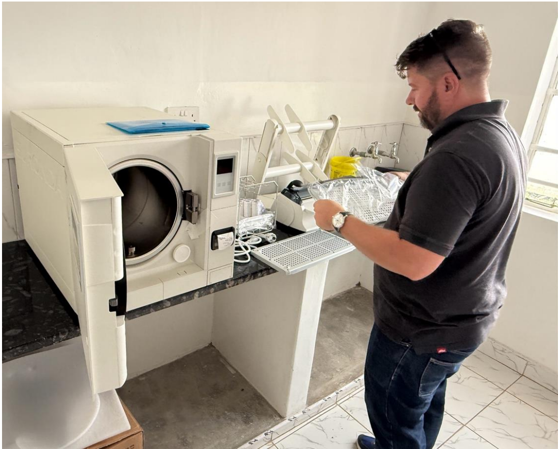
Installing instrument cleaning and sterilisation equipment in the Decontamination Room