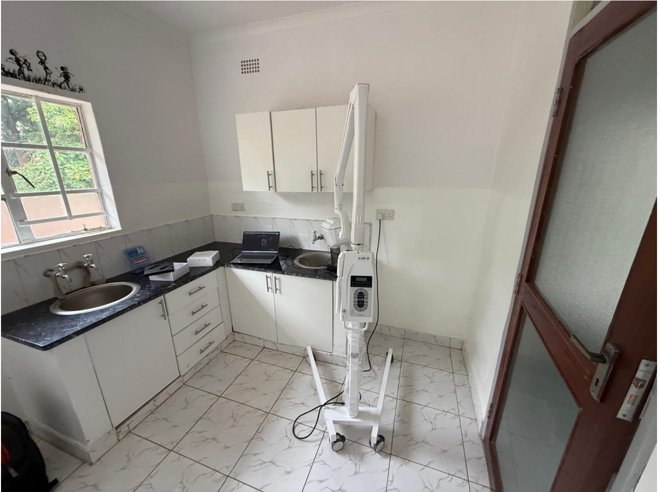
The assembled mobile digital X-ray unit, complete with laptop and software to view the dental images.