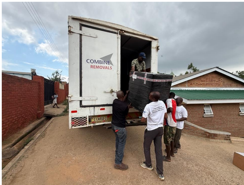
Unloading the truck

The installation of the equipment was completed successfully during the week of 1 st December. The following photographs show some of the steps involved: