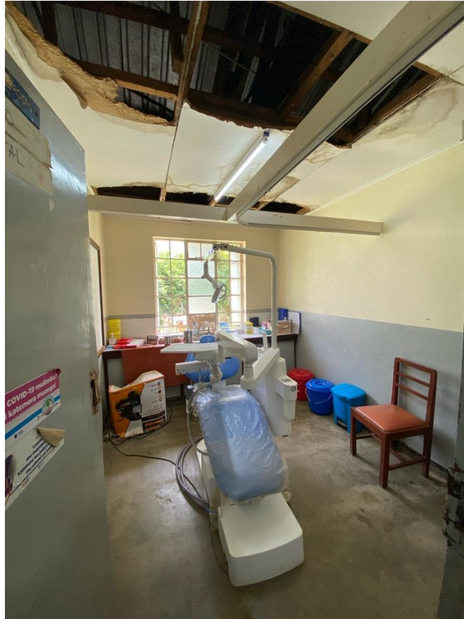
The original dental surgery in the Out Patient Department