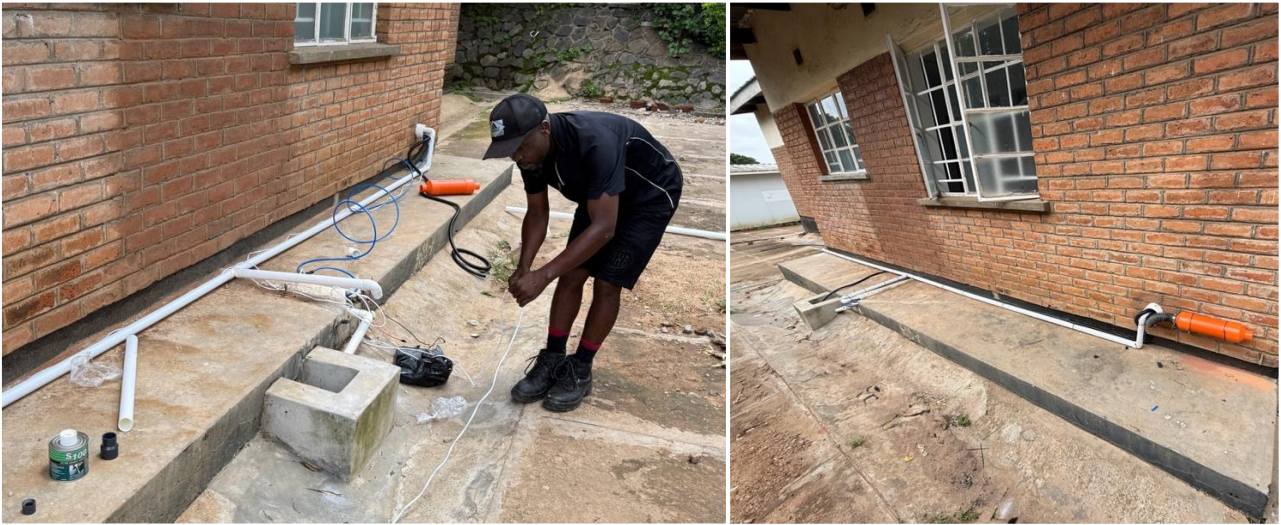
Installing the services to link the dental chairs to the compressor and suction motor