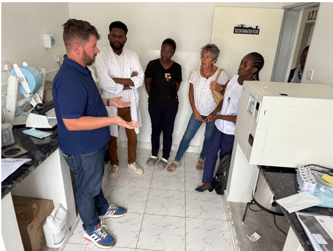
Delivering training on the instrument decontamination process