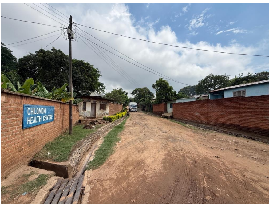
The rutted, un-metalled road to Chilomoni Health Centre – the truck delivering the dental equipment is in the distance

Chilomoni Health Centre is located approximately 4km from the centre of Blantyre, but the dirt access road to the health centre is quite challenging. Blantyre is a smallish town in southern Malawi and the health centre is funded by Blantyre District Health Office.