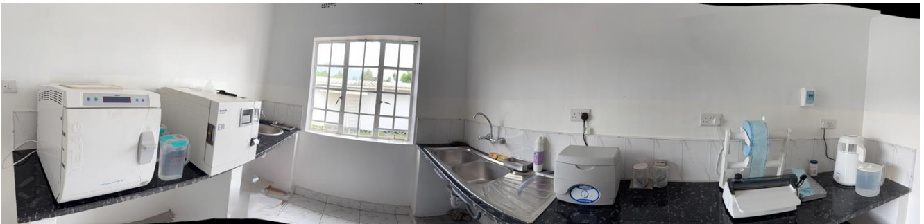
A panoramic photo of the state of the art instrument decontamination facility which will benefit not only Dentistry but Maternity and the Out Patient Department too.