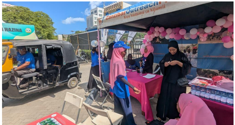
Above: The Tuk Tuk supporting the work of the breast cancer awareness team