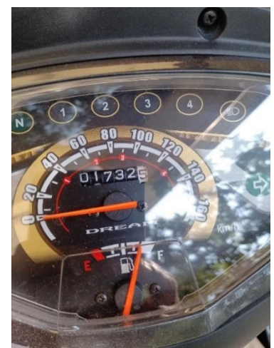
Mileage on the clock

'We are working in alignment with the WHO global strategy 'Zero Leprosy Roadmap (2021–2030)'. We are helping many people. More than only treating patients, we support healing of body, mind and spirit. What may seem like simple training or household visits is far more than that. There are now fewer patients being found, which is a positive result for Banteay Meanchey Province and shows we are close to the goal of eliminating leprosy in Cambodia. I have worked on this project for more than 10 years, and this is an important success for all of us. My team and I