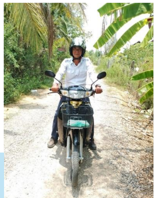
Right: IMPACT Cambodia's new motorbike is extending the reach of the leprosy outreach project