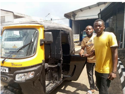
Above and below: collecting and delivering medical supplies and equipment