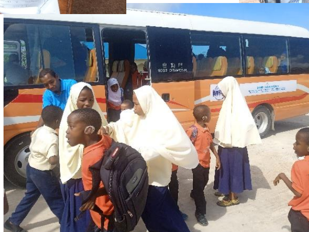
The school bus funded by Fondation Eagle in 2024 is now no longer needed for daily shopping trips