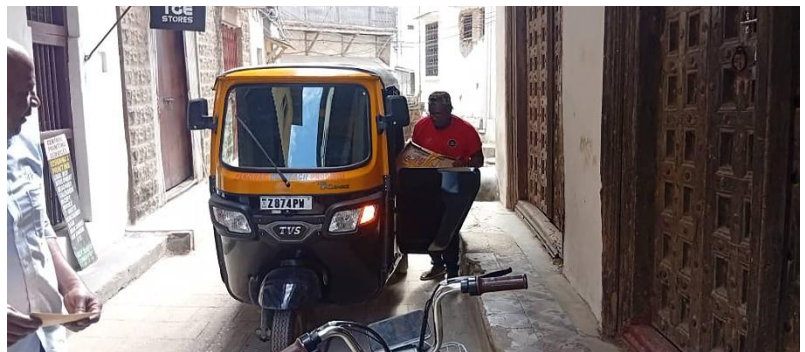
The streets of Stone town are narrow and congested