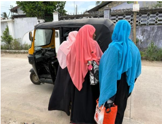
Left: transporting volunteers