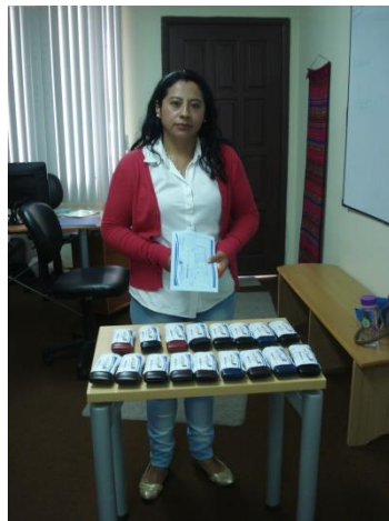
Left: Eye test and handover of glasses, SOS Aldeas Infantiles