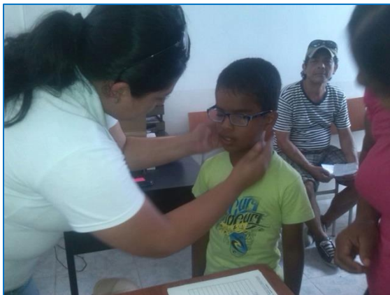
Left and above: The campaign in Manabí on the western coast of Ecuador, where the earthquake occurred in April this year. Although many families left the area following the quake, the poorer families have tended to stay, and were very appreciative of our help with glasses.