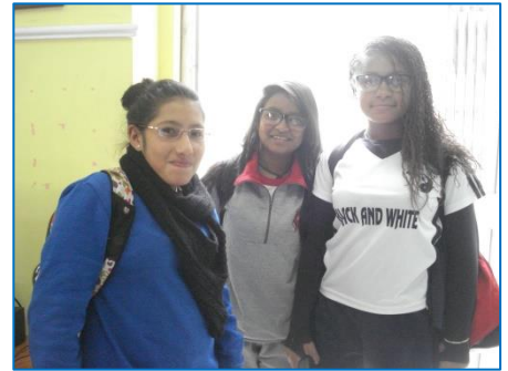
Below: New glasses and eye tests, COVI