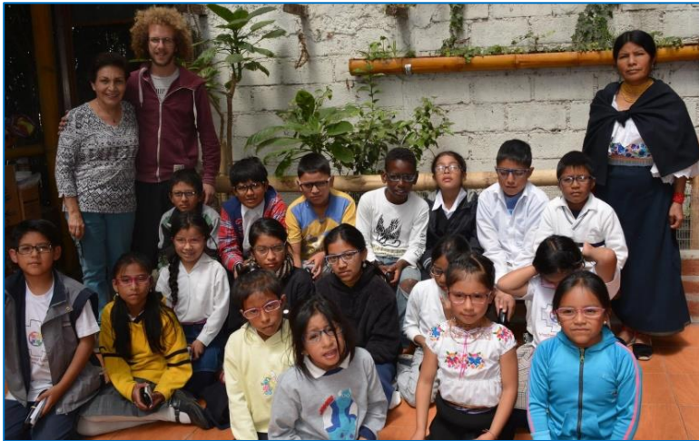
Children and teachers at Yachay Wasi Fundación after the handover of glasses