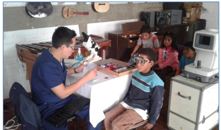
Eye tests at Honrar la Vida, phase 2, December 2016