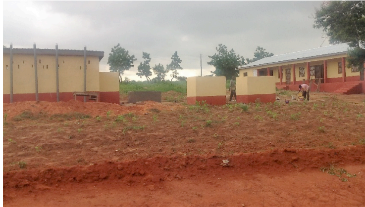
Nagboo , from the road, showing JHS classrooms and toilets , including a cubicle for the disabled and urinals. June 2016