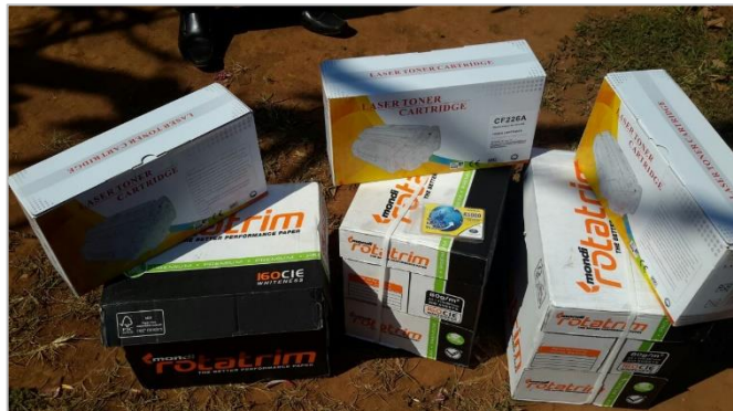
Some of the items received by Mulanje School