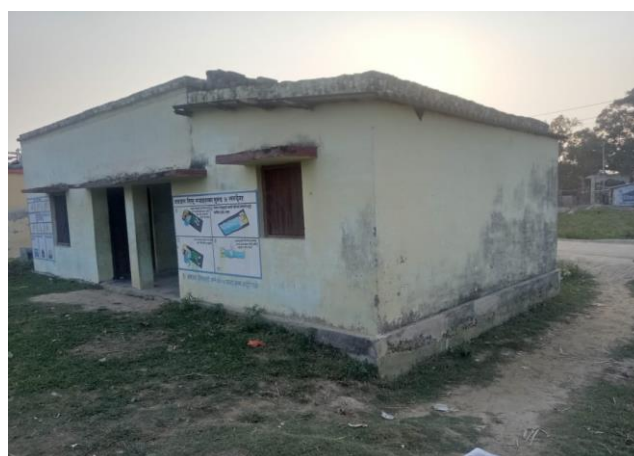
ABOVE: The new Maternity Unit is being built on land currently occupied by the existing Health Post. This will be demolished and its services incorporated within the new building.

We are so grateful that Fondation Eagle is supporting the construction of this much-needed Birthing Centre. Thanks to your vote of confidence in the project, we are delighted to report that we have been able to leverage additional funds from a UK-based Charitable Trust to establish a wrap-around nutrition programme based at the Centre. This additional funding will enable our Fieldworkers to establish 10 IMPACT Mothers' Clubs in the area; support women to establish small agricultural businesses; and provide nutrition education for the wider community. We very much look forward to keeping you abreast with these activities and progress on the construction front.