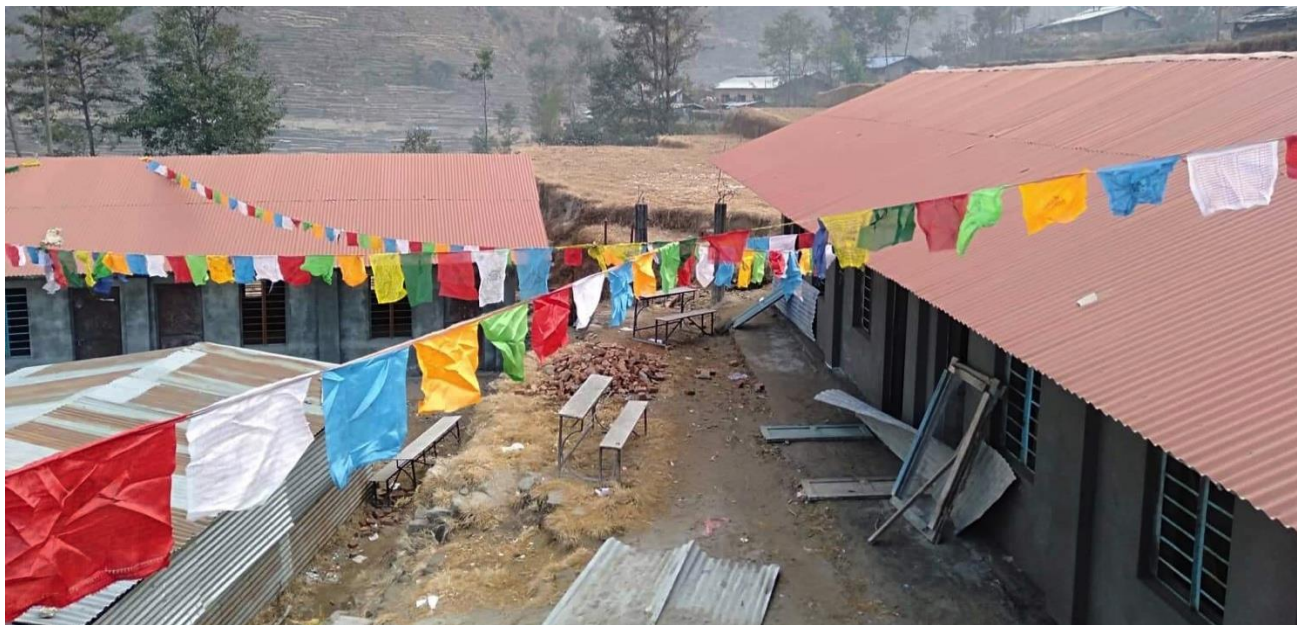
Figure 9: Showing the location and current progress of the two JICA buildings

One of the two JICA buildings will remain fully open-plan to function as a meeting hall, whilst the other has been split into two separate rooms to serve as classrooms. The wall which splits these two classrooms has been built.