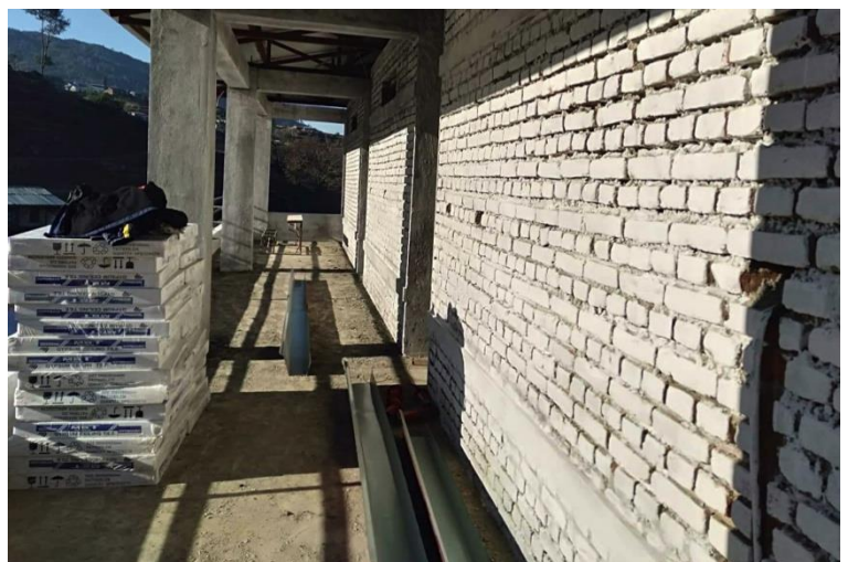
Figure 2: The materials in place ready to construct the bridge spanning the rear of the building

Currently, the two buildings are not connected, an element crucial for the interaction between classrooms. The materials to build a connection bridge between the two buildings have been measured, the bridge has been designed and the foundations have been constructed. All that's left is to install the connection bridge into its place on the building. We have constructed a parapet wall spanning the full length of the upper floor (including the connecting bridge), and fixed a metal railing to this wall for the safety of the students.