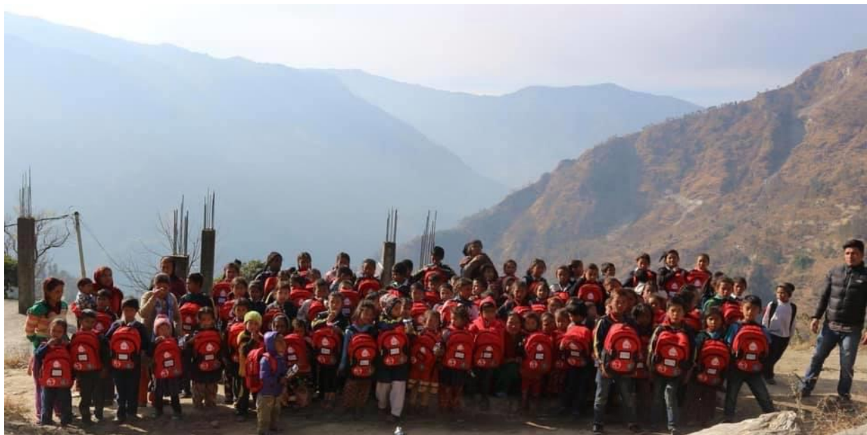
Photos from a recent school in a bag distribution.