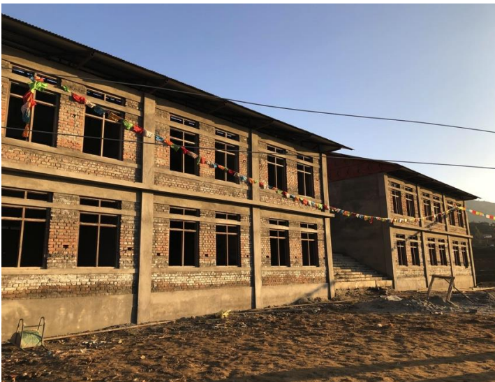
Figure 1: The 12 classroom block on the upper section of the site

The upper section consists of 12 classrooms of two buildings connected by an area of stairs. As you can see in figure 1, We have now finished the plastering of the exterior beams, bands and columns, as well as all interior walls of the building. The screeding and punning of all floors in the building, including the stairways, is complete. The next task of painting the plastered surfaces with double coat distemper has begun. As opposed to plastering the whole exterior wall, we left a portion as exposed brickwork. We still plan to paint the brickwork to protect from damage and improve the overall image of the building. The installation of all windows and doors will begin next week and once they are in place, they too will require painting.