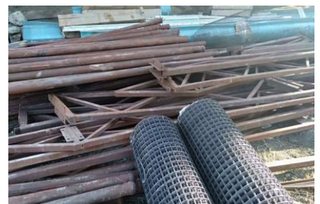
Figure 6: Materials on site to begin constructing the metal roofing covering amphitheater

All of the materials necessary to construct the metal truss and supported roofing, as well as a metal stair-railing are on site. The construction of these crucial elements has begun and is expected to complete in the next 10 days. Both structural Engineer, Bikash Shrestha and Architecture, Sameer Bajracharya will closely oversee and guide the installation of this part. It will be the first such facility provided to any building in the region.