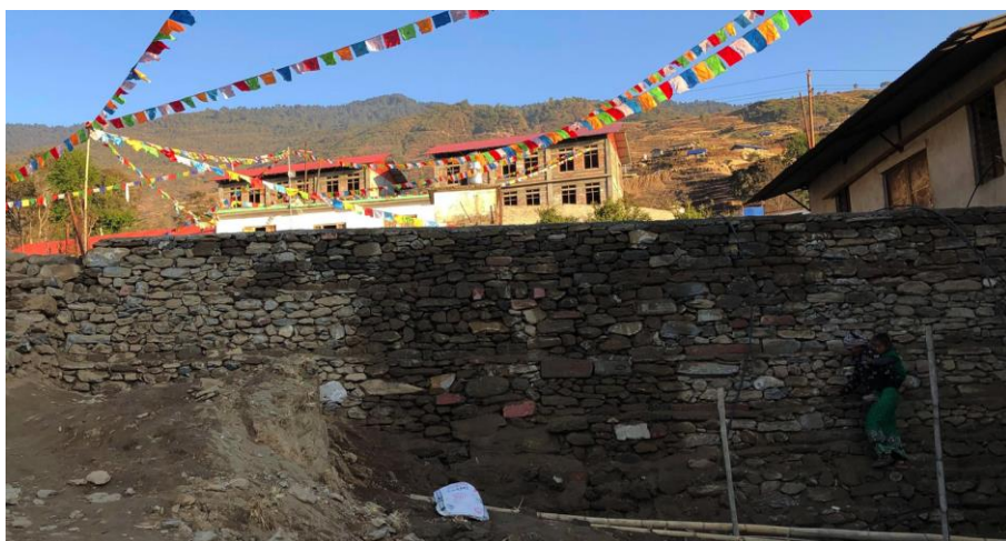
Figure 10: Showing the condition of the stairway which currently runs through the school site.

Now that the plastering work and retaining work has been completed, our main focus now will be to construct a stable stairway connecting the main entrance at the front of the school, to the back entrance. This will require significant landscaping to clear the rubble that currently serves as the stairway through the school.