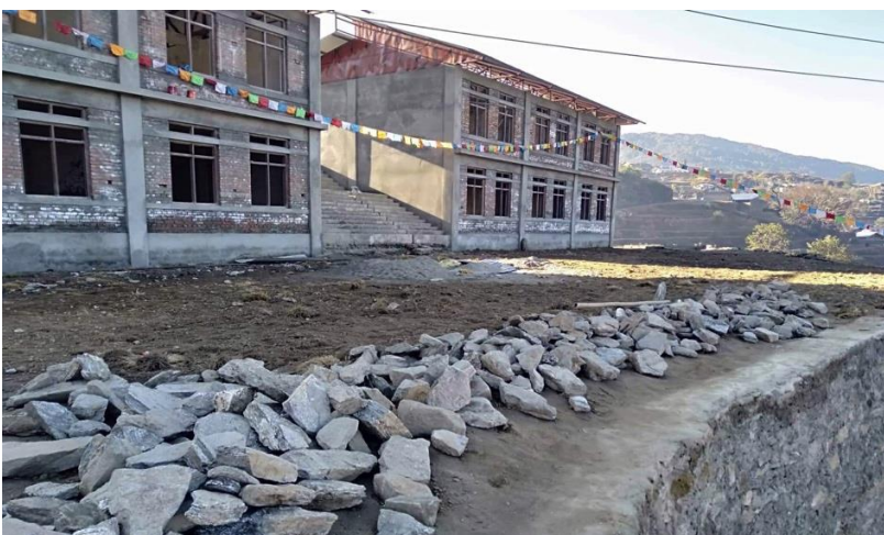
Figure 6: The completed wall which was constructed to retain land vulnerable to landslides

Two feet away from the edge of the retaining wall, we will build a 2ft x 2ft wall along the whole length of the playground and all around the school premises, to support the fencing poles, and provide a seated area for the students. The total length of this will be 480 feet. As shown in figure 7 the stones for this wall have been positioned ready for construction.