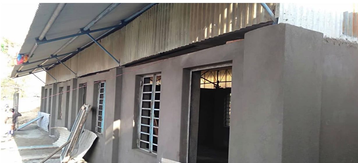
Figure 8: JICA building fully plastered and ready for painting