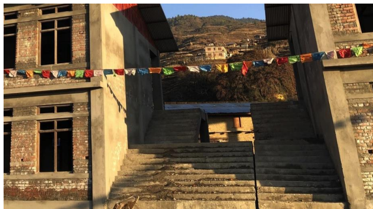
Figure 4: Final design image for the 'amphitheatre' connecting the two blocks

We designed and have constructed a 'amphitheater' style stairway, which faces the playground area in front of the buildings – a space which can be utilized for outdoor cooperative learning and project work. The roof panels above the stairway will be semi-transparent to allow light to enter whilst protecting against the elements.