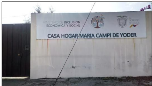
Campaign at the Casa Hogar Maria Campi de Yoder