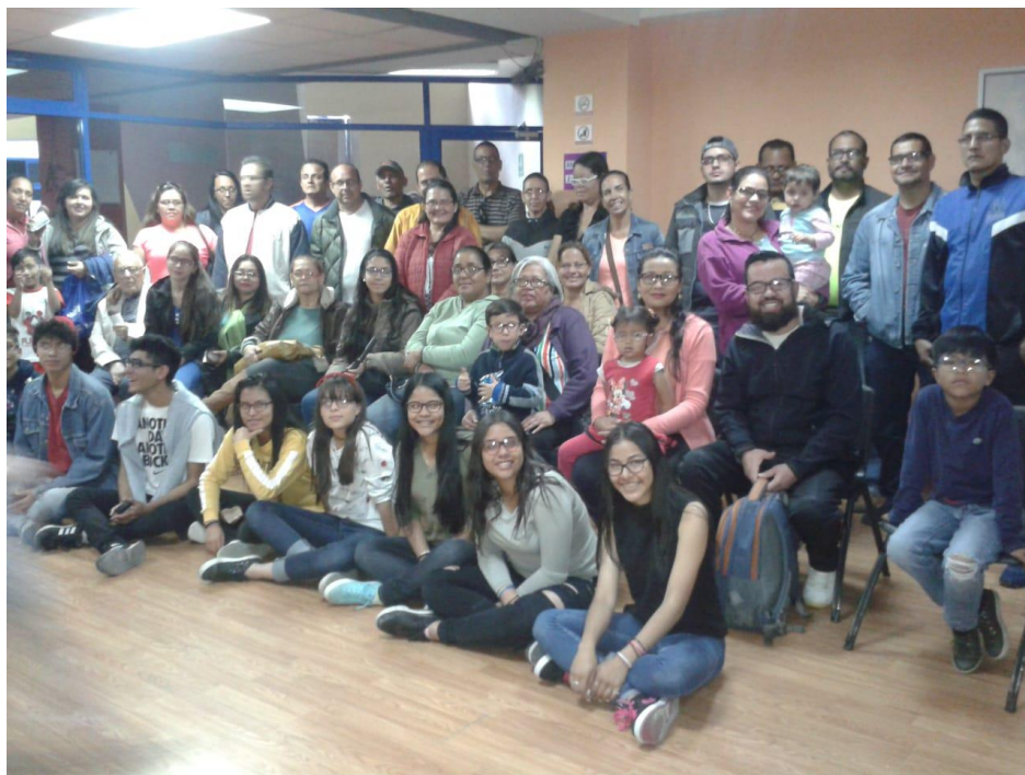
FUDELA campaign 2: Venezuelan refugees in Ecuador after receiving their glasses