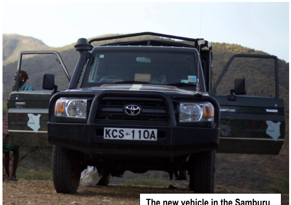
The new vehicle in the Samburu

Approximately 50,000 people within the community as the vehicle is used to support water and family planning projects, for example, which assist thousands of people.