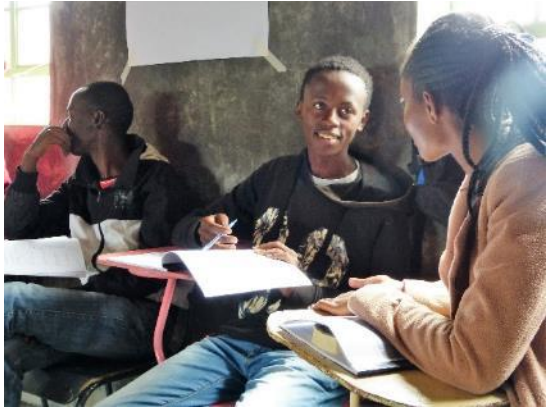
Students were very happy to be learning in the new facility