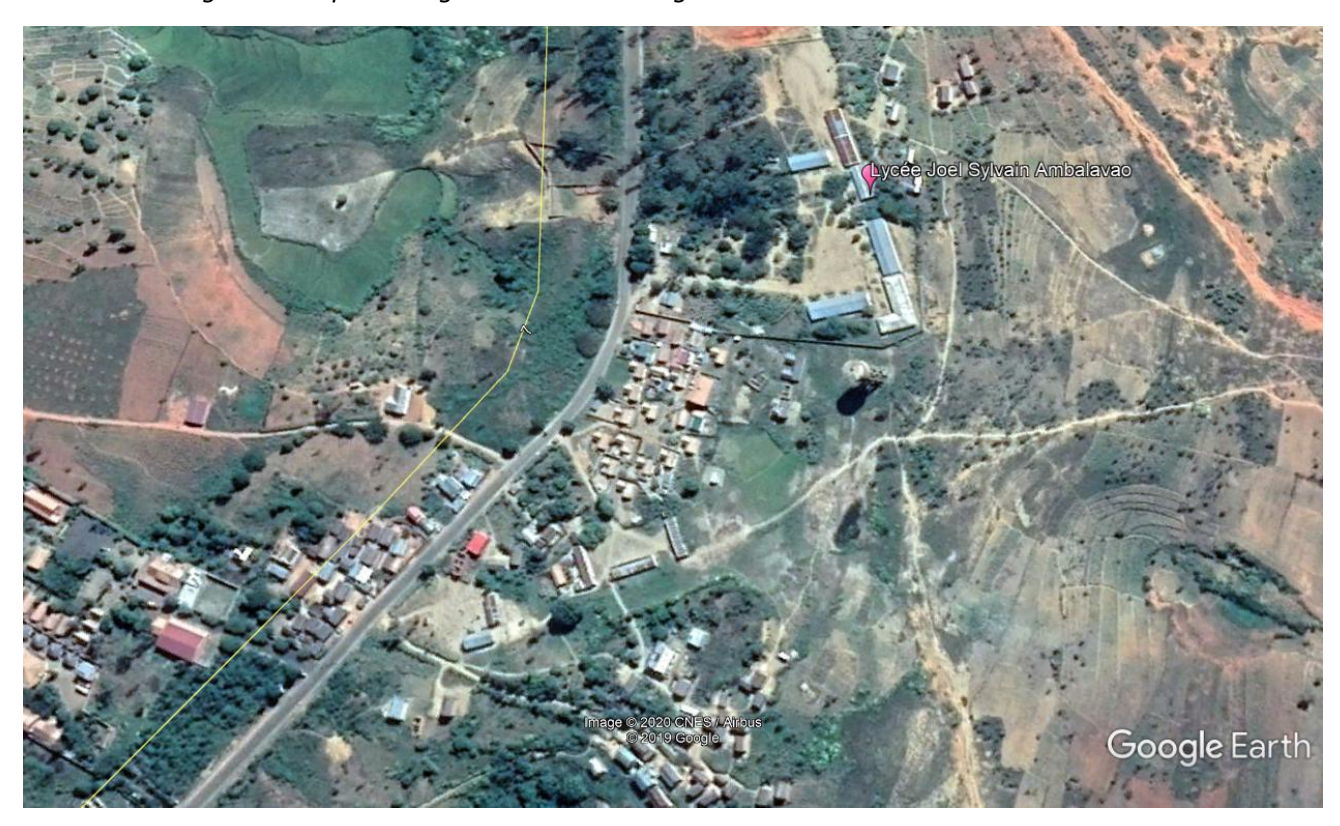
Figure 3: Map showing the site project of Ambalavao High School closer-up.

Geographical coordinates: Latitude: 21°48′56.18″S Longitude: 46°57′14.33″E