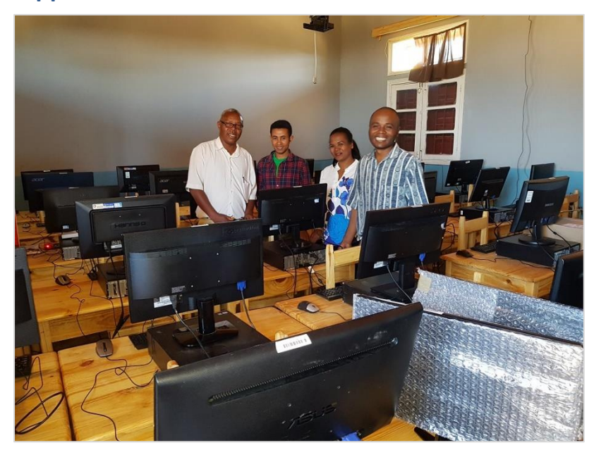
Education authorities, IT teacher, deputy and head teacher