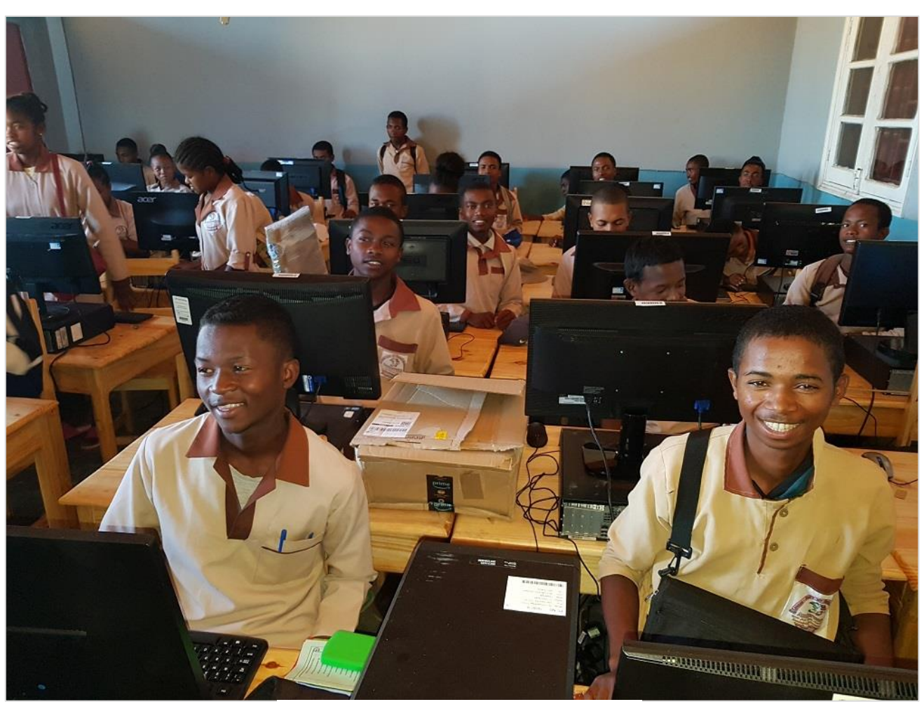
Students in class