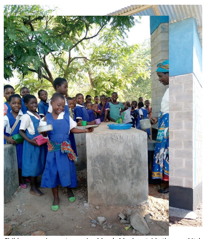
Children queuing up to receive Mary's Meals outside the new kitchen: