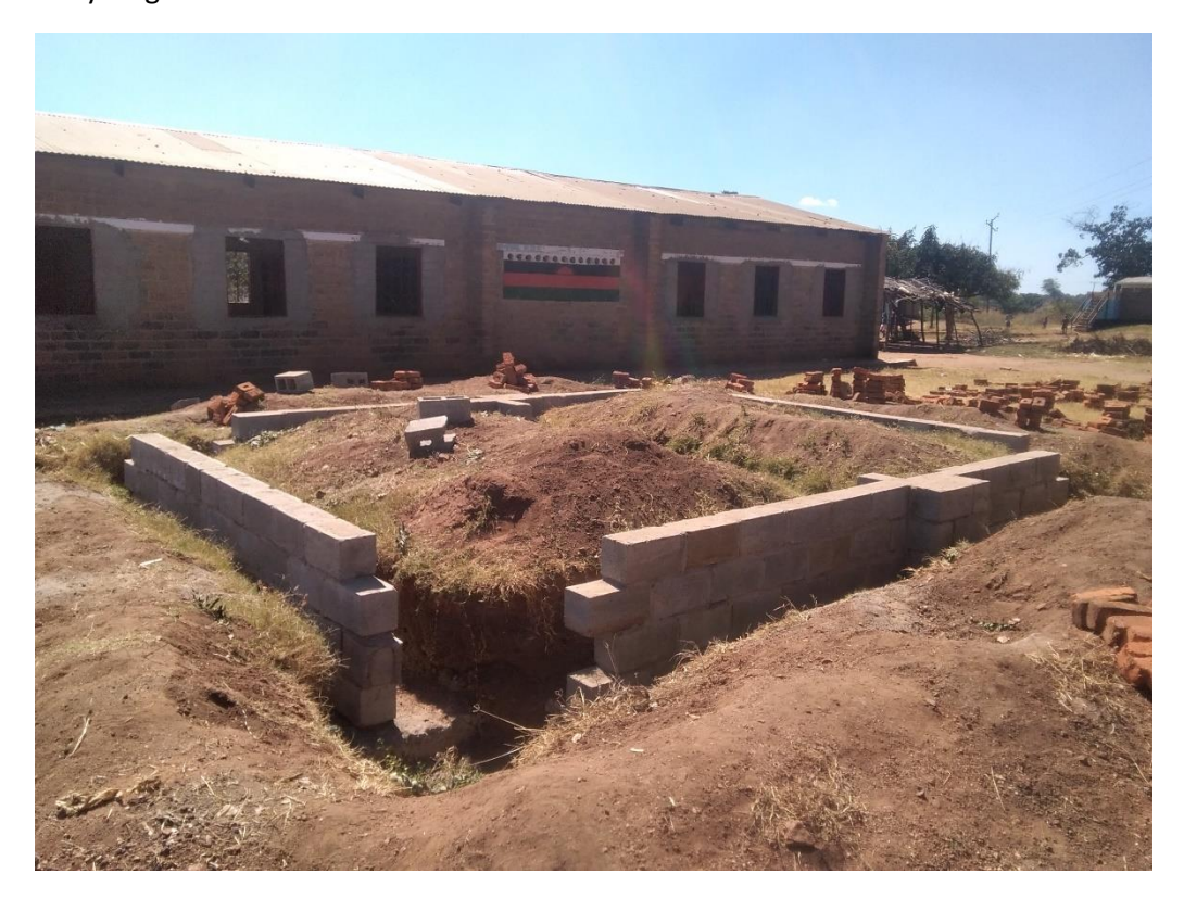
New kitchen and serving bench: