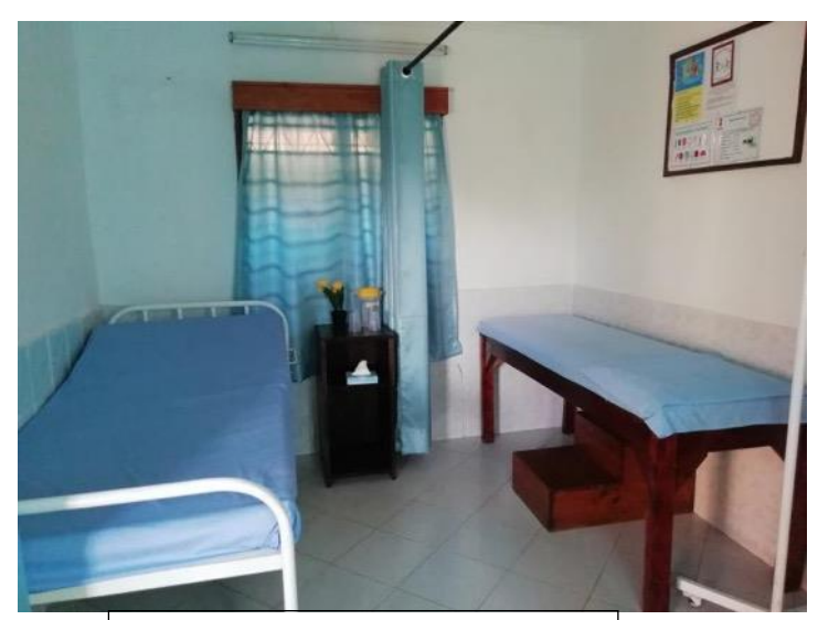
New family planning patient room

Family planning (FP) is not taught in schools, and not typically handed down from mother to daughter in most rural Kenyan communities, so