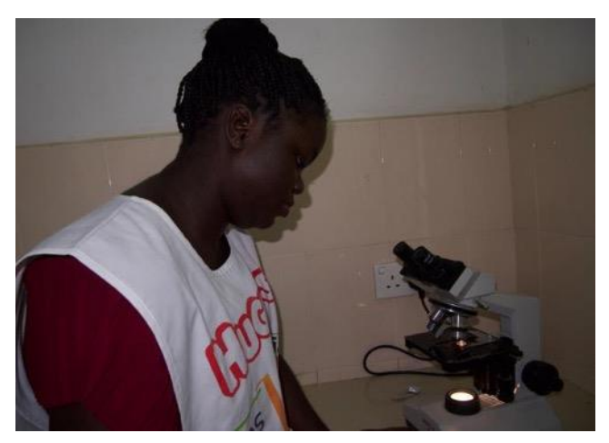
Looking at a blood sample in the diagnostic

• Diagnostic capability has been greatly improved - further supporting our ability to improve capacity. The haematology analyser offers faster, more accurate processing of a high volume of blood samples compared to the previous manual process, reducing the risk of human error and sample contamination and ensuring cost effective health treatment. It is used a number of times each day enabling the lab technician to test