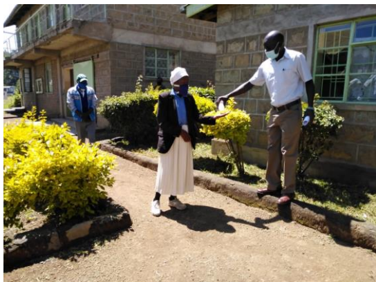
Beneficiaries receiving hand spray on arrival to collect their emergency packs from NTTI.