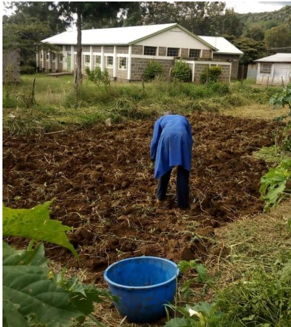
Farm preparation at Bishop Wambari Girls School