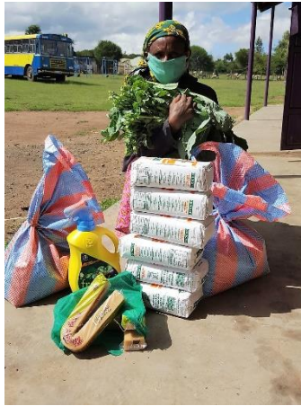
A head of household pauses for a photo with her emergency pack, which includes vegetables from the Centre's farm