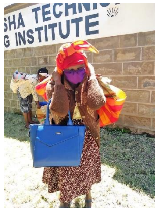
A mother and an unemployed man heading home with their emergency packs for May.