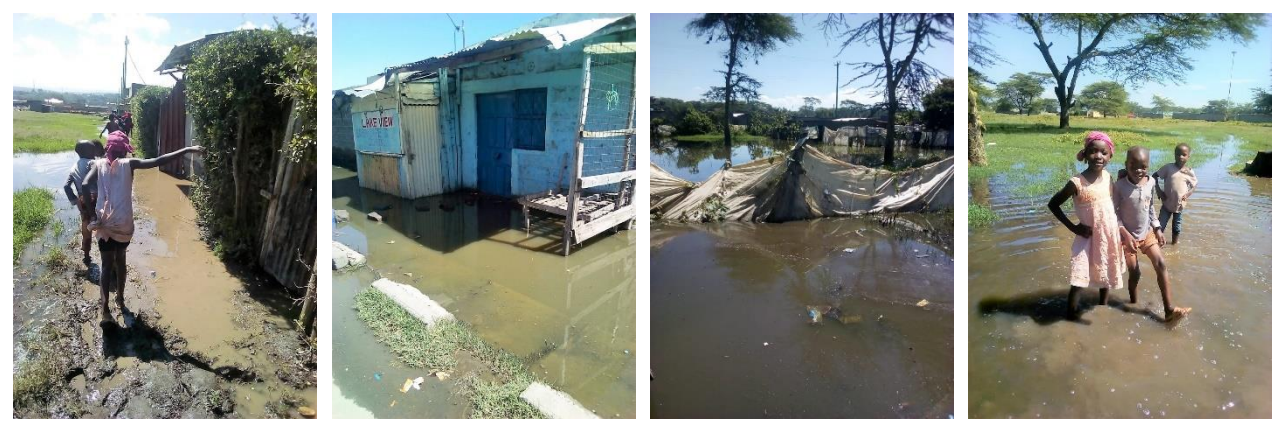
Twelve of the families we supported with emergency packs and fresh water came from the Kihoto area (a total of 70 beneficiaries).

After a period of heavy rain, the low-lying slum area of Kihoto on the outskirts of Naivasha was flooded in May, raising the risk of disease as pit latrines overflowed. This worsened the economic hardship already caused by Covid 19 for the (mainly poor) people living there.