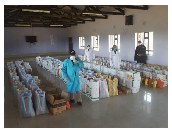
Food and hygiene emergency packs ready to distribute from the Sunshine Centre

The result of this effort has exceeded our expectations. To the best of our knowledge, none of our boys has gone back to the streets and none has suffered from Covid 19 (staff members have seen some boys herding cattle and sheep, but this is a safe and helpful way to fill in the time until normality returns).