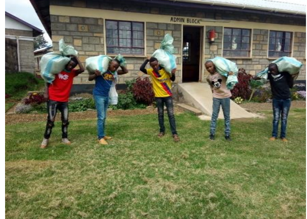
Five former street boy (all high school boys) collect their families' emergency packs from the Sunshine Centre. This was an opportunity to check they were safe and well and not abandoned.