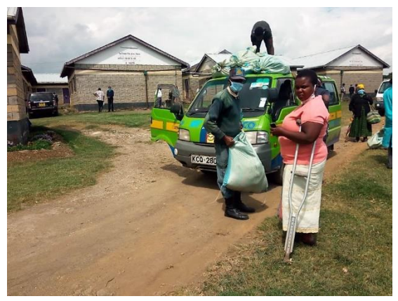
We provided transport to ensure the emergency packs arrived home safely. This mother is disabled due to an accident before the Covid 19 emergency