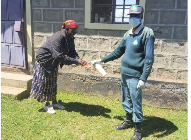
We made hand sanitizer available to beneficiaries, along with health and distancing advice