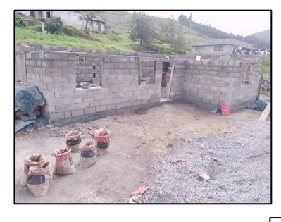
Construction of a new home on the outskirts of Quito for a Condor Trust student and her family