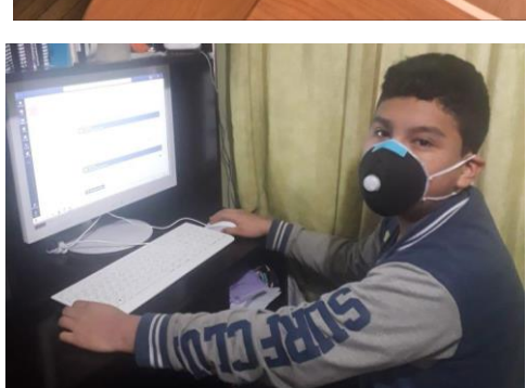
Condor Trust students with computers for home learning