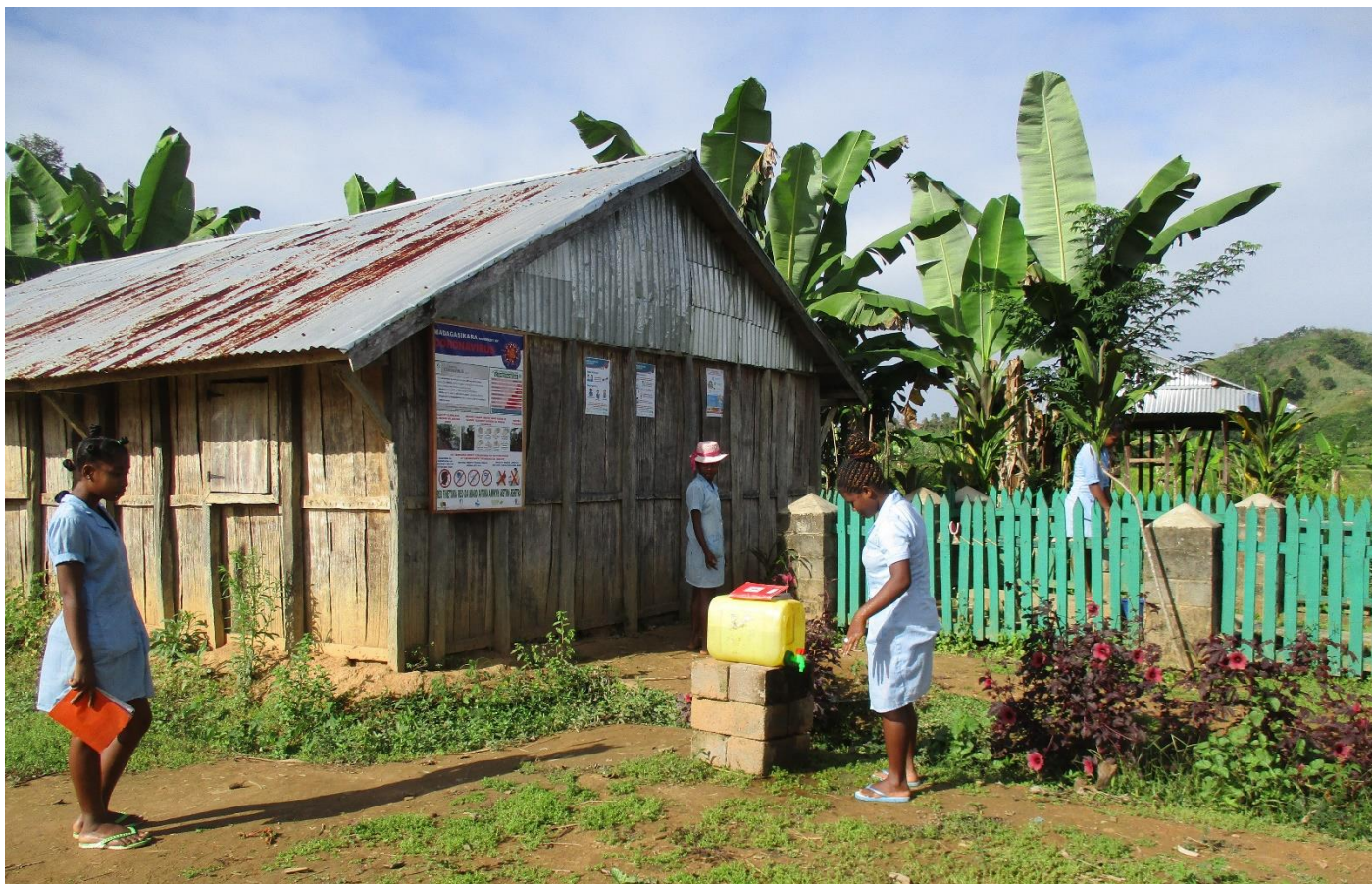
Tanakambana Secondary School students with the new borehole COVID-19 protocol.