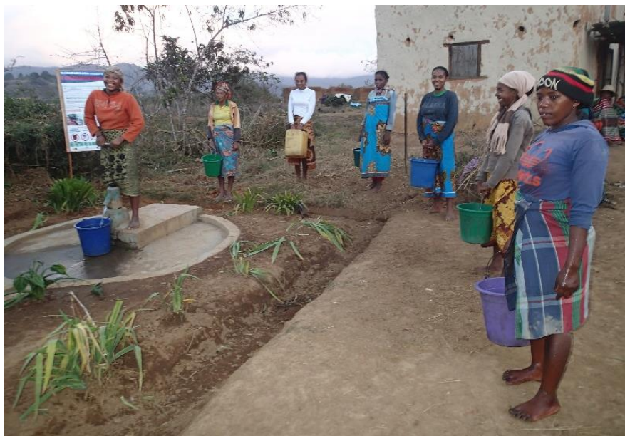
COVID-19 Protocol in Anjamana village, Miarinarivo.