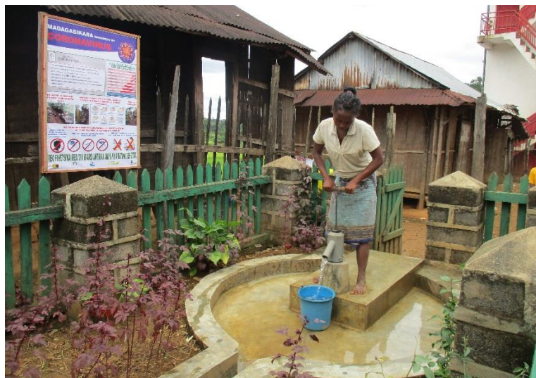
An A0-sized sign at Tanakambana borehole.