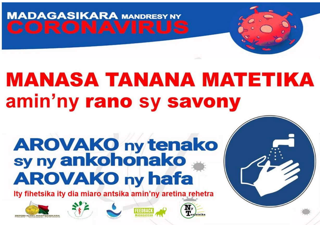
Hand-washing posters & stickers used on hand-washing devices (jerricans with taps).