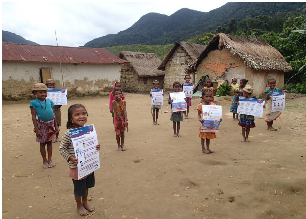
School pupils during COVID-19 awareness-raising related to management of the Bevoahazo Primary School borehole.

An estimated 200,000 (the population of target municipalities)