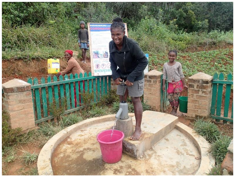
Training for Sahavondronina Water Management Committee (left) & at their borehole (right).