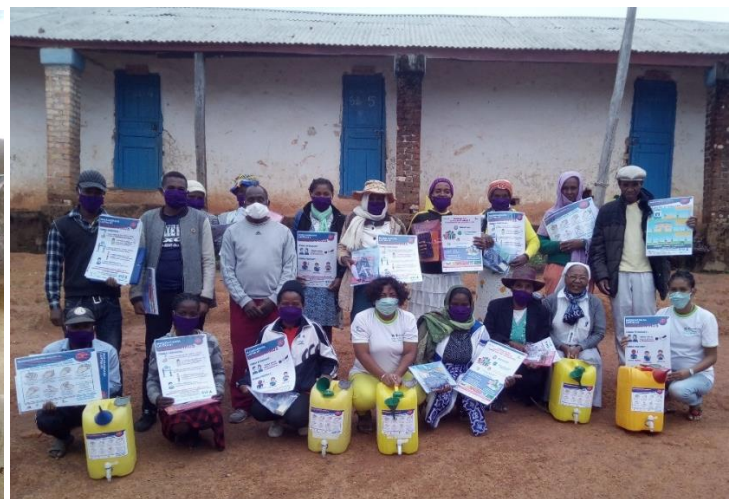
Community health volunteers with their Coronavirus posters and hand-washing devices in Vohitsaoka (left) and Miarinarivo (right).