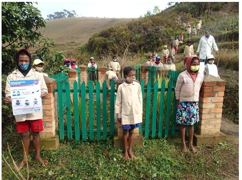
Sahabe village / Ankarinomy Primary & Secondary School at their borehole.