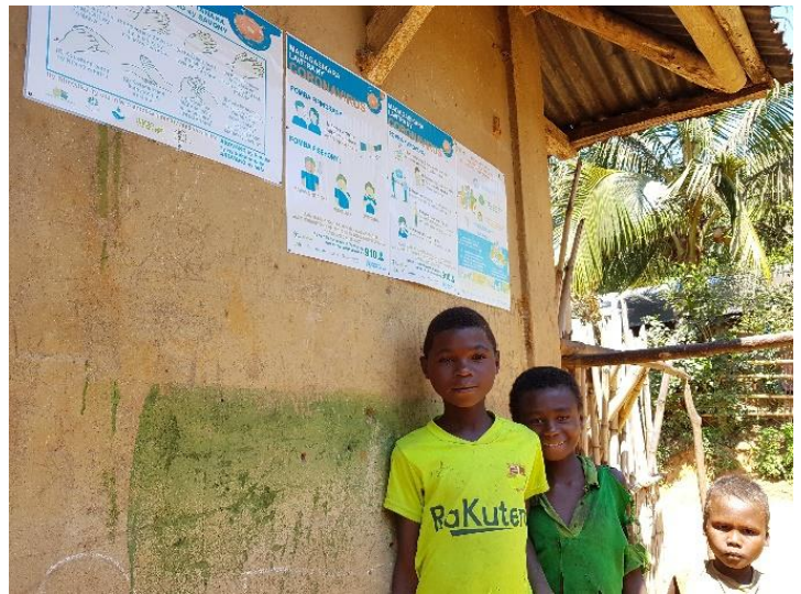
COVID-19 protocol in Tanakambana.