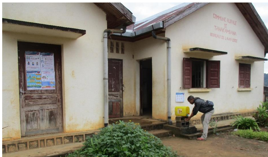
Hand-washing units installed outside offices & schools (above) & disinfection kits (below left).