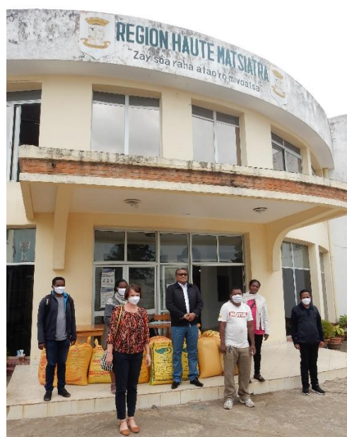
Unloading rice & oil at the Region's CCO (above & below left)) & (below right) distribution of food packets to the vulnerable in Fianarantsoa.