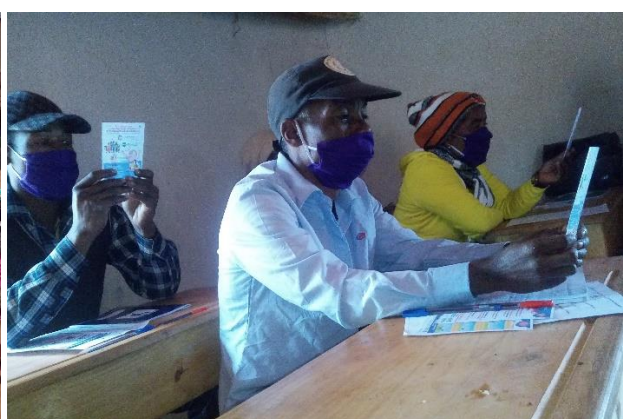
Training of community health volunteers & provision of posters and flyers.