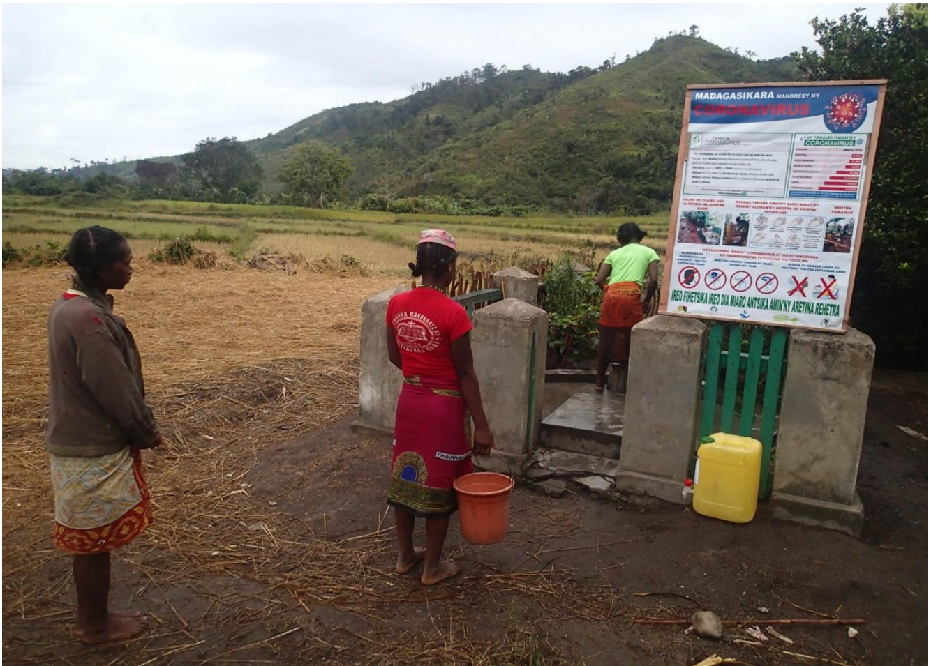
COVID-19 Protocol at Torotosy borehole.