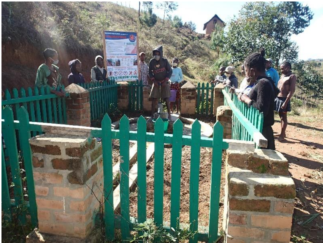
Miarinarivo Primary School borehole.