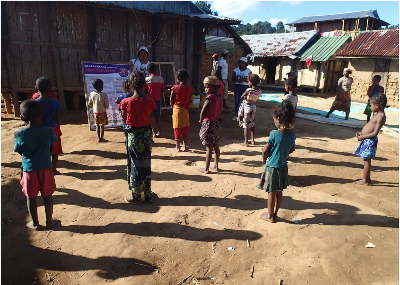
COVID-19 awareness-raising with pupils in Torotosy.