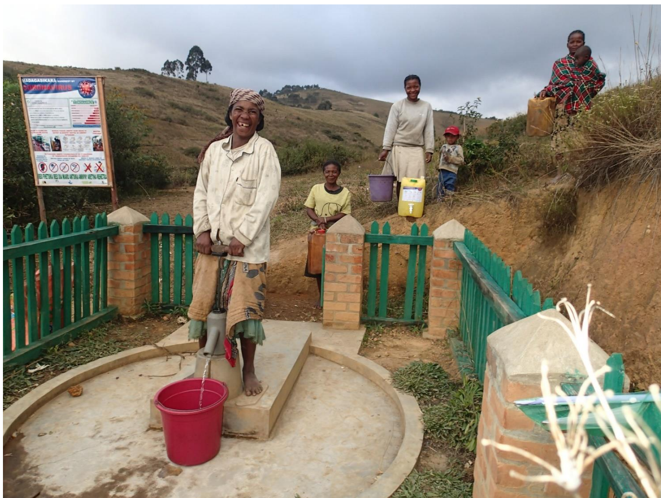
COVID-19 protocol at a borehole in the Miarinarivo area.

Awareness-raising around water points proved to be an effective strategy since they are sites where the community gathers – particularly early morning and in the afternoon. Application of the COVID-19 protocol at these water points had a knock-on effect on families, leading to hand-washing in households and greater expenditure on soap. As a result of COVID-19 messaging, households' need for clean water has also increased significantly and they are more aware of the precautions that should be taken when using communal water points. Community ownership and consideration of the water infrastructure has been boosted via the additional trainings and support provided to water management committees, with a reinstating of payment of water users' fees, greater attention to the cleaning and environment surrounding water points, and to the protection of water catchment areas. It has equally contributed to strengthening community cohesion and solidarity.