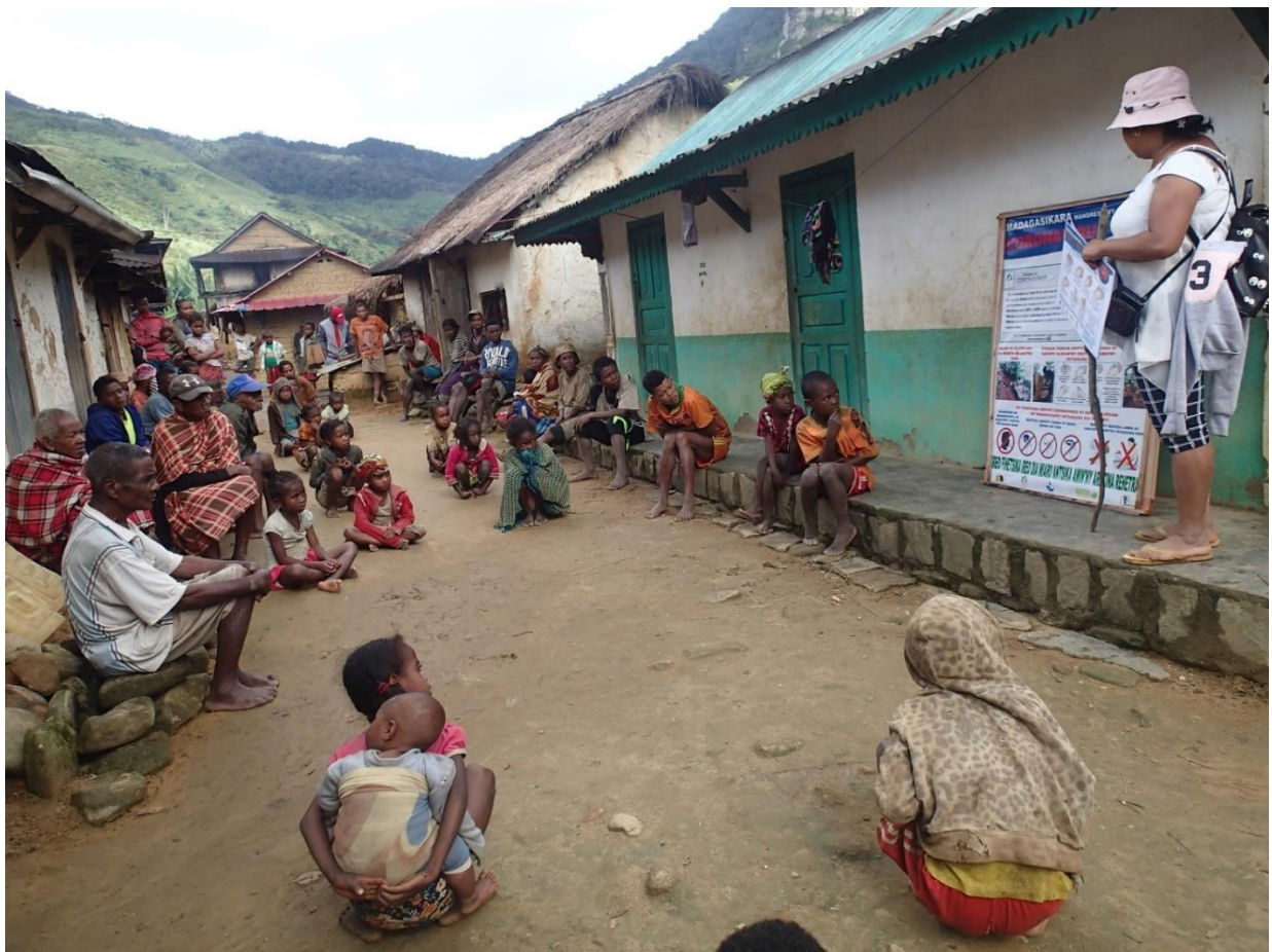
Awareness-raising in Ranovao, Ranomafana municipality, and at their borehole (below).