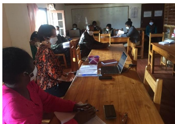
Team meeting in the FBM-NT Fianarantsoa office.