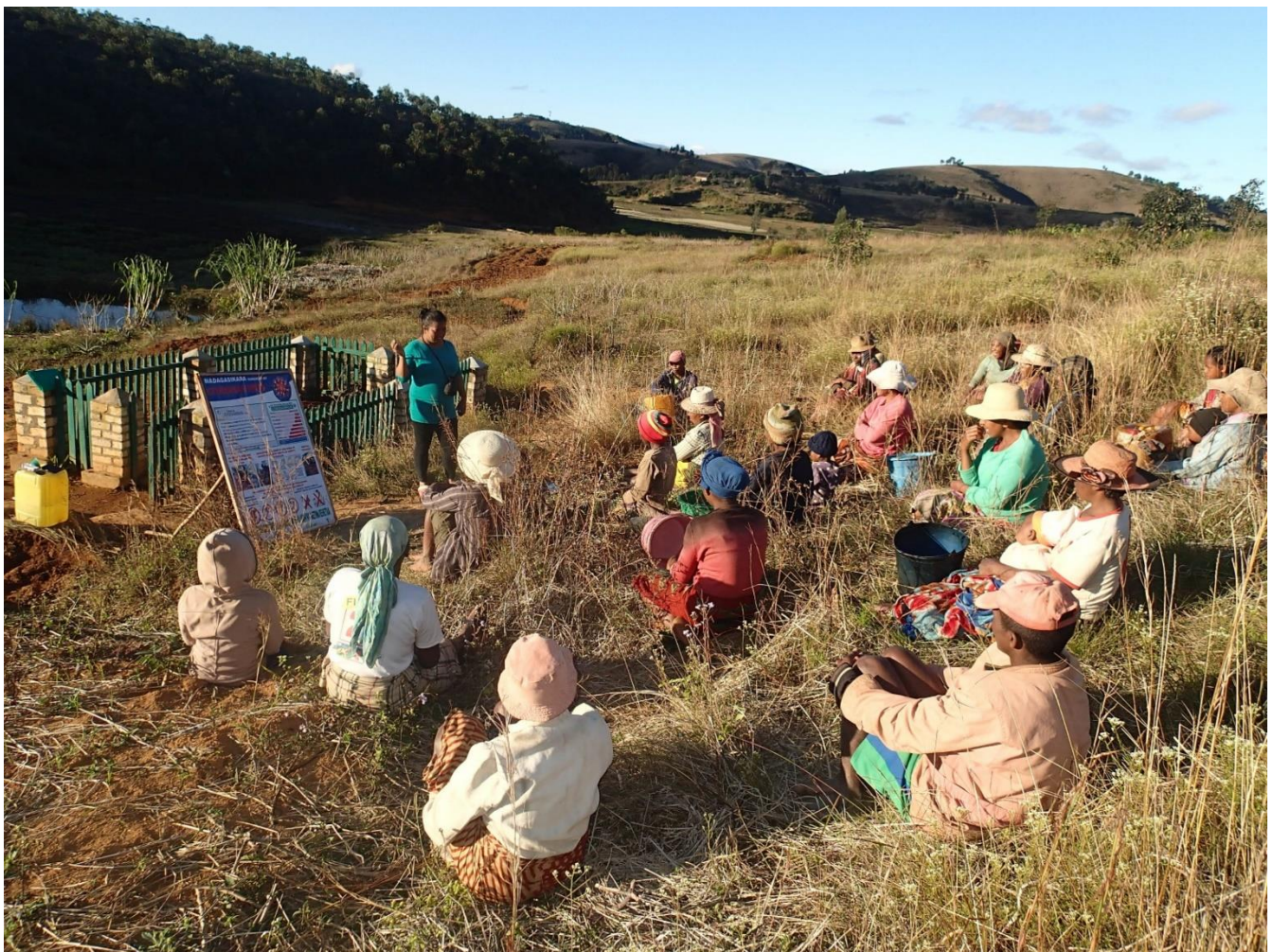
Information session for borehole users in Miarinarivo.