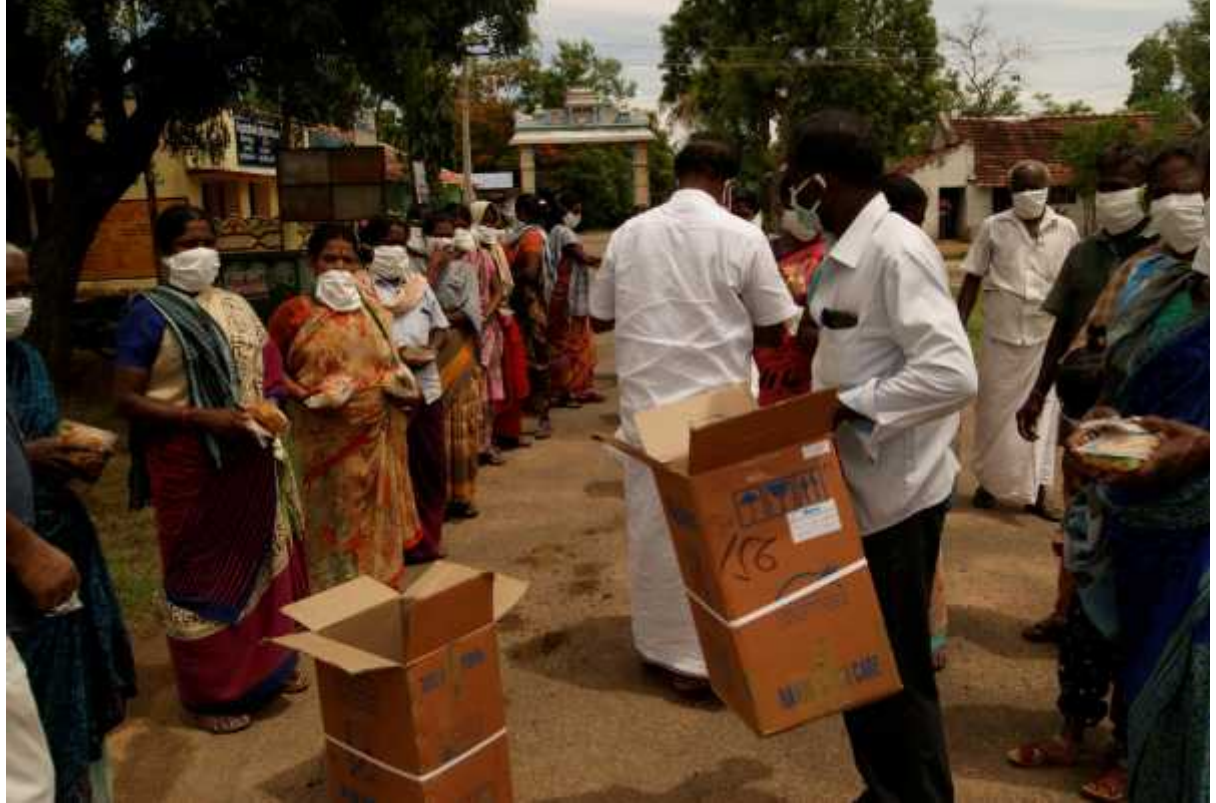
DISTRIBUTION OF MILLET SNACKS TO THE CHILDREN