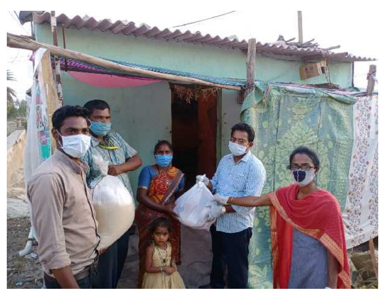
RELIEF TO THE MIGRANT LABOURERS OF BENGALURU SLUMS AND PAVEMENT DWELLERS at KARNATAKA