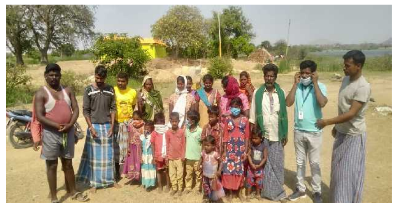
A portion of migrant labourers of Kolar District of Karnataka

The selection of beneficiaries was based on the plight of individuals who are mostly migrant labourers without employment during the lock-downs and control measures against COVID 19. The vulnerable ones without a home to stay or remain as pavement dwellers or living on government lands were given priority. Team leaders were identified and oriented on the relief measures and mode of support.