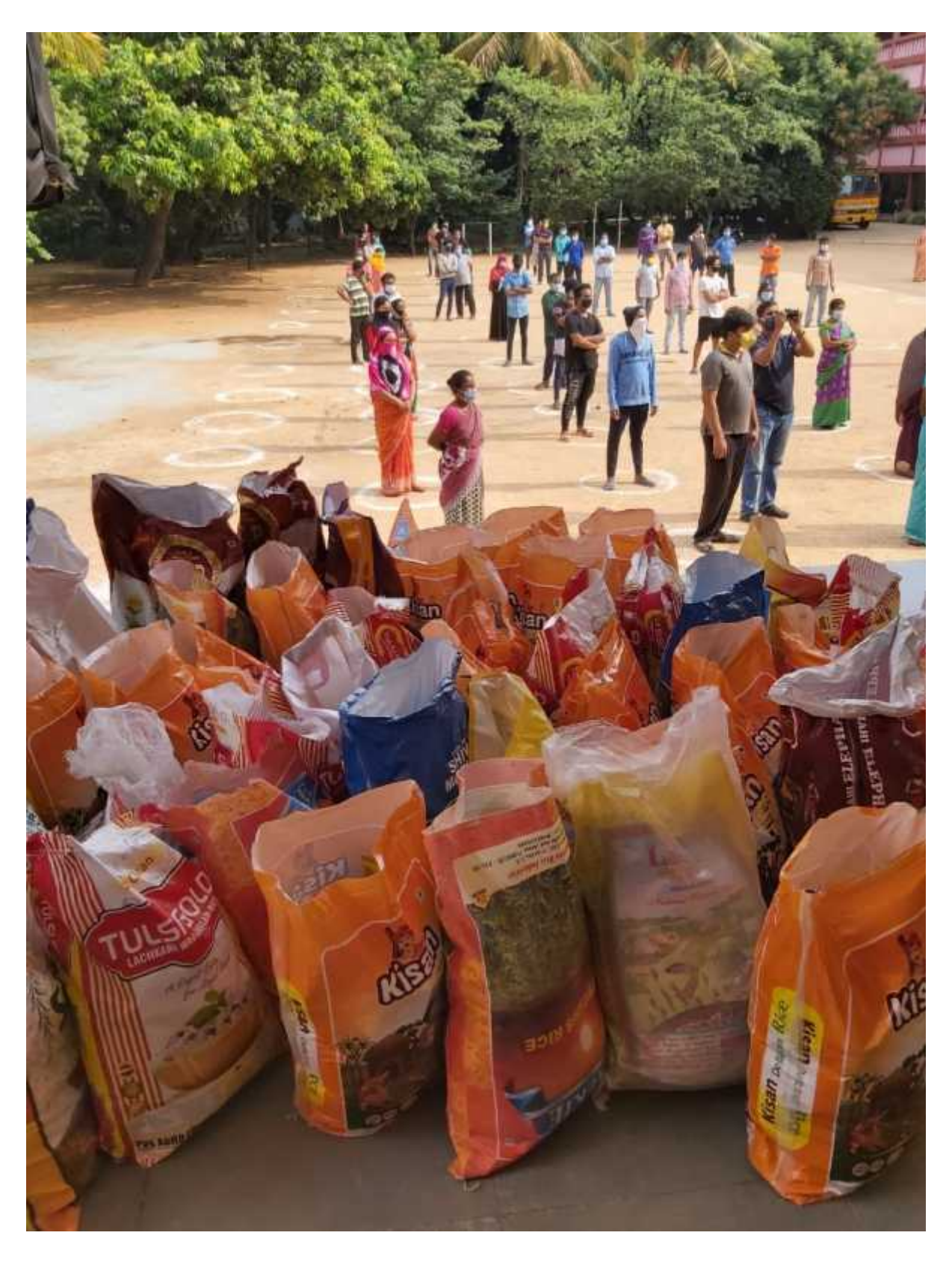
RELIEF PACKAGE TO BE DISTRIBUTED AND THE BENEFITING MIGRANTS OBSERVING SOCIAL DISTANCING BEFORE RECEIVING THE RELIEF KITS