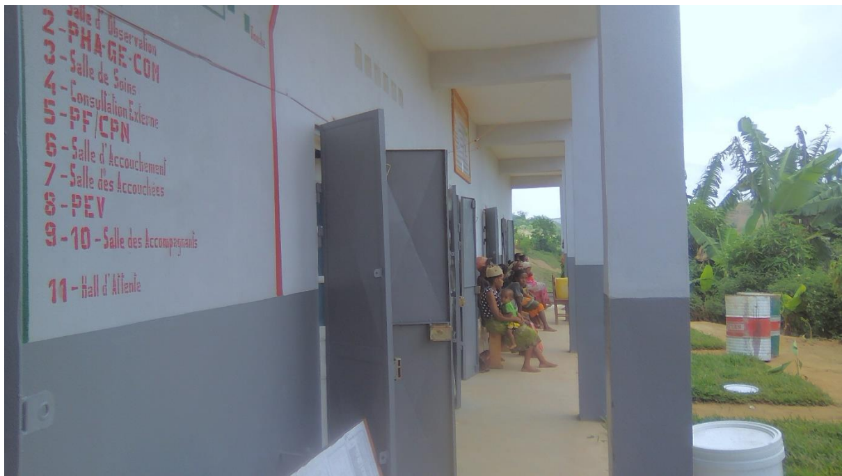
Retouches to paintwork: