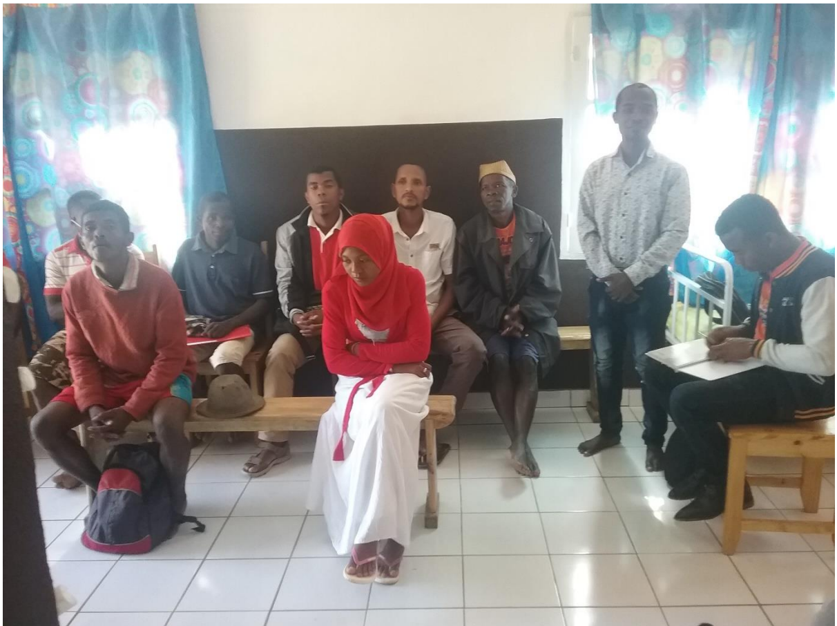
Curtains hung-up in Akondromainty Health Centre.