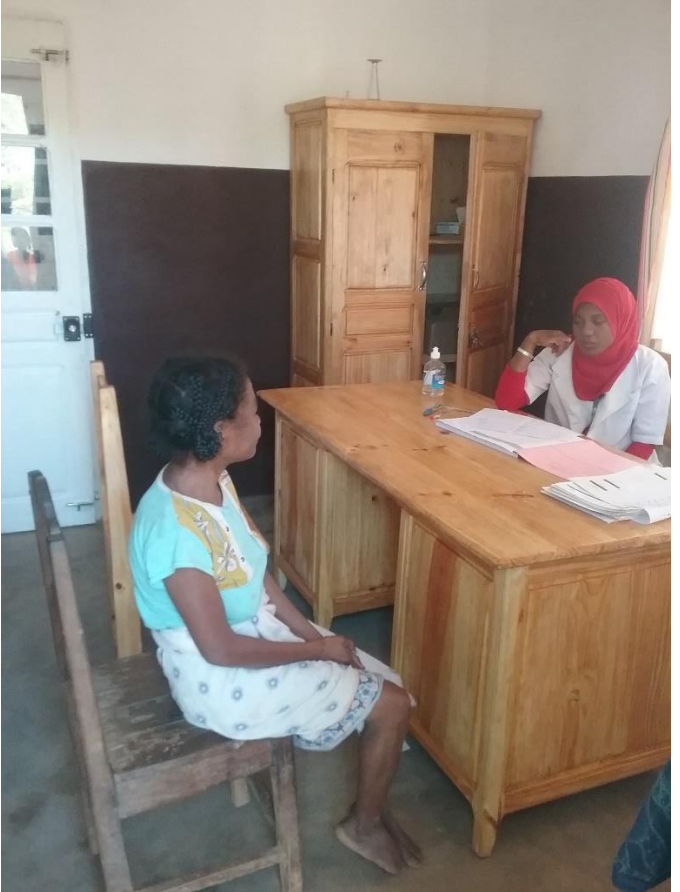
Head of the health centre (left) & midwife (right) receiving people for consultations.