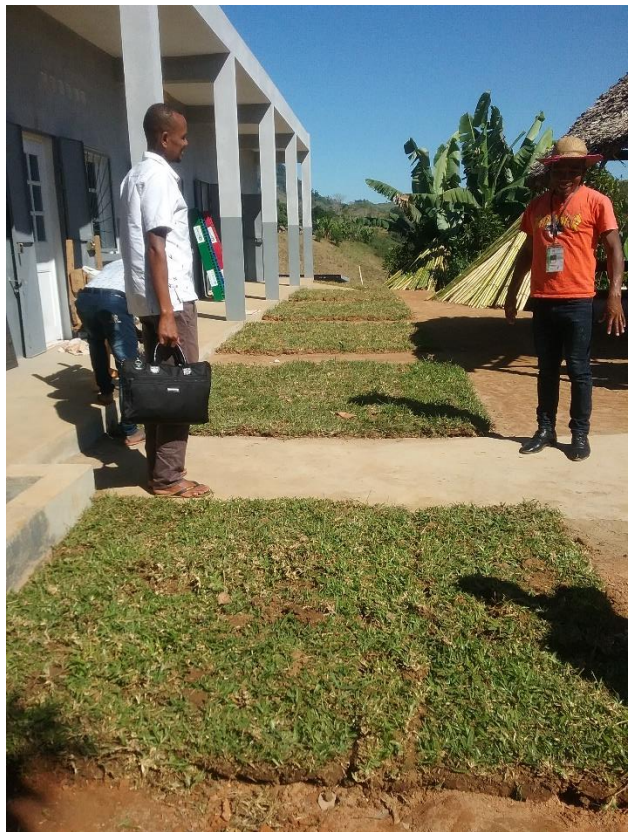
Local authorities inspecting the lawn outside the health centre.