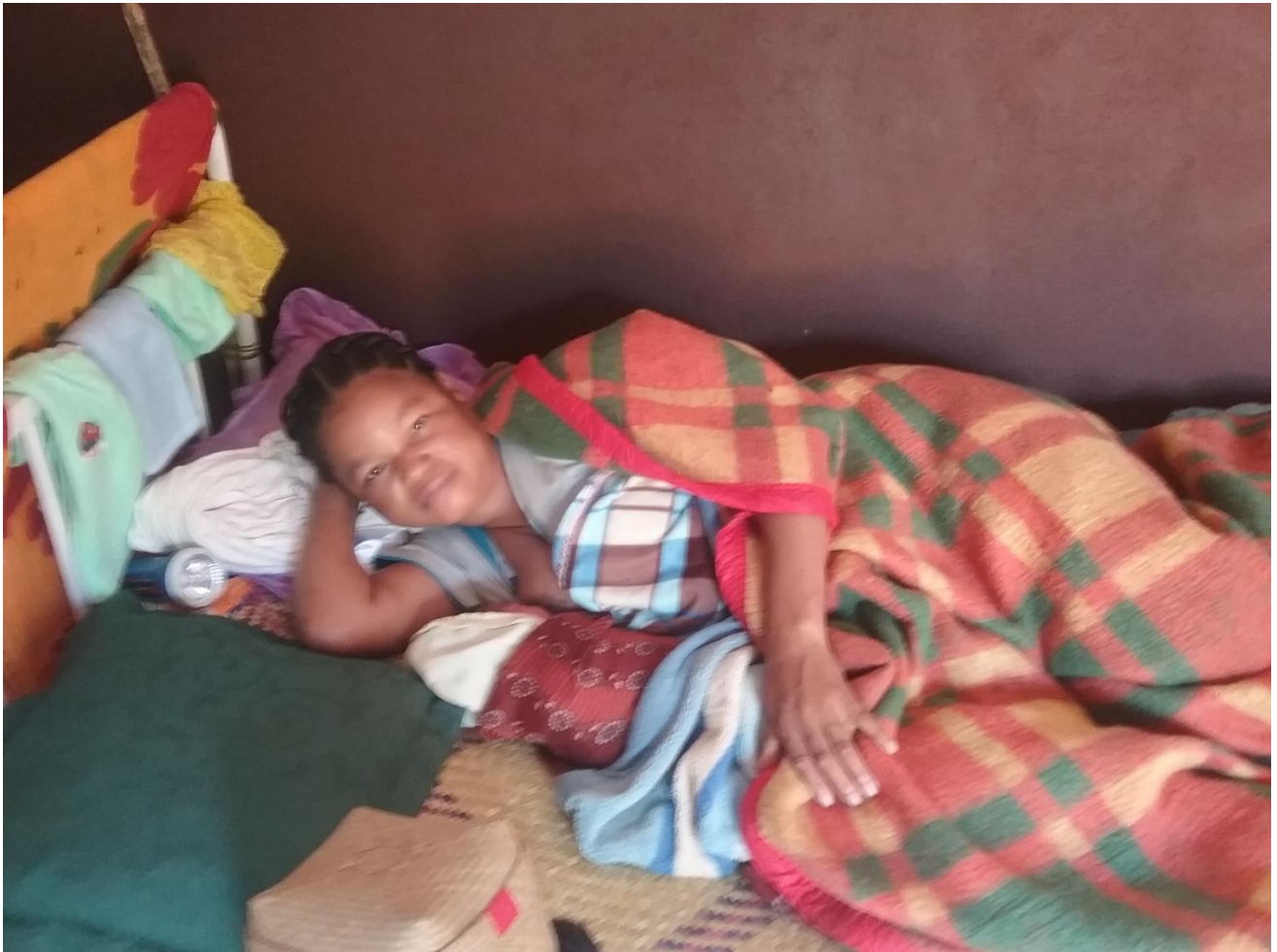
Mother & newborn at the health centre.