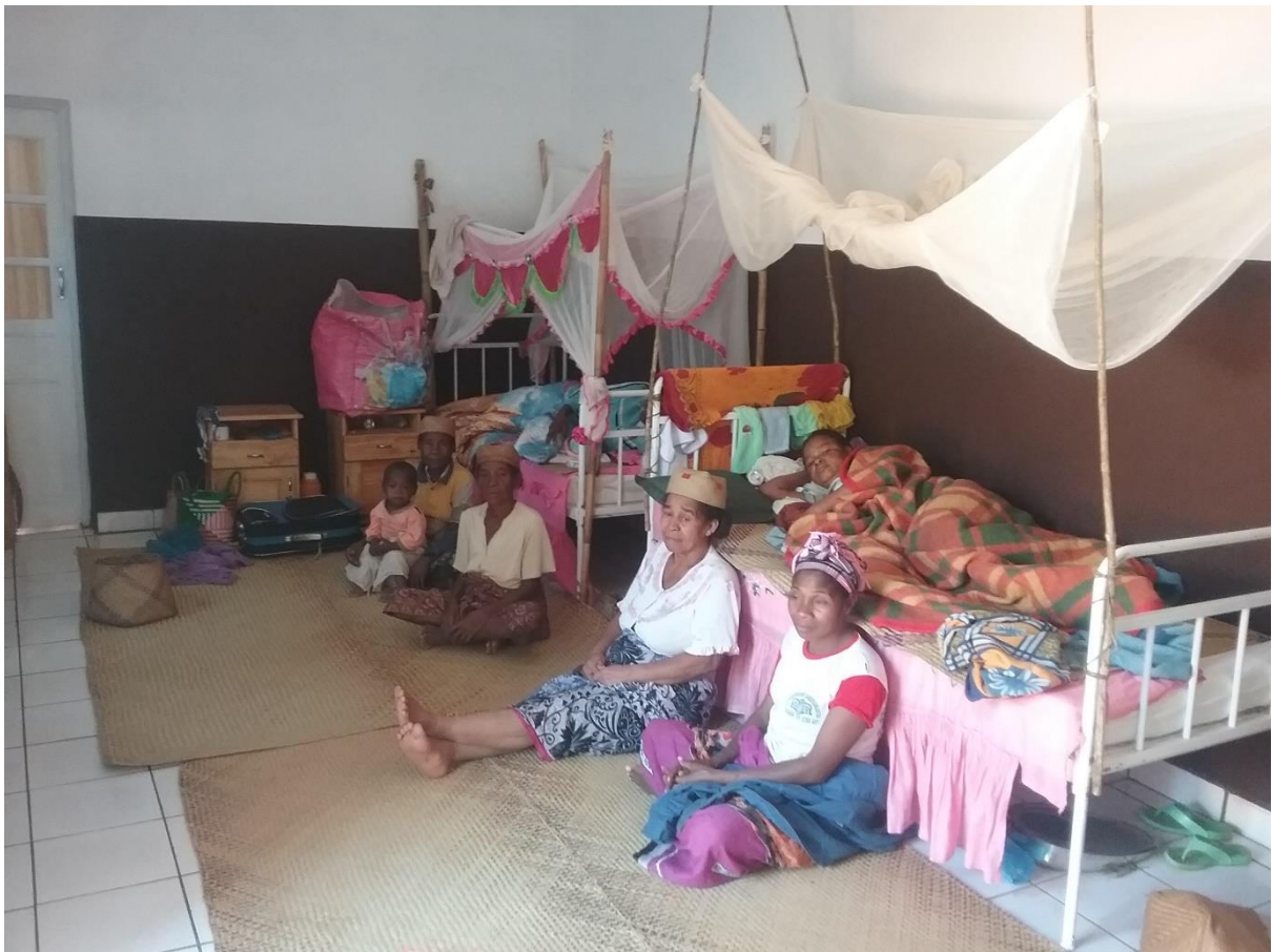
The maternity ward (before new mosquito nets were installed).