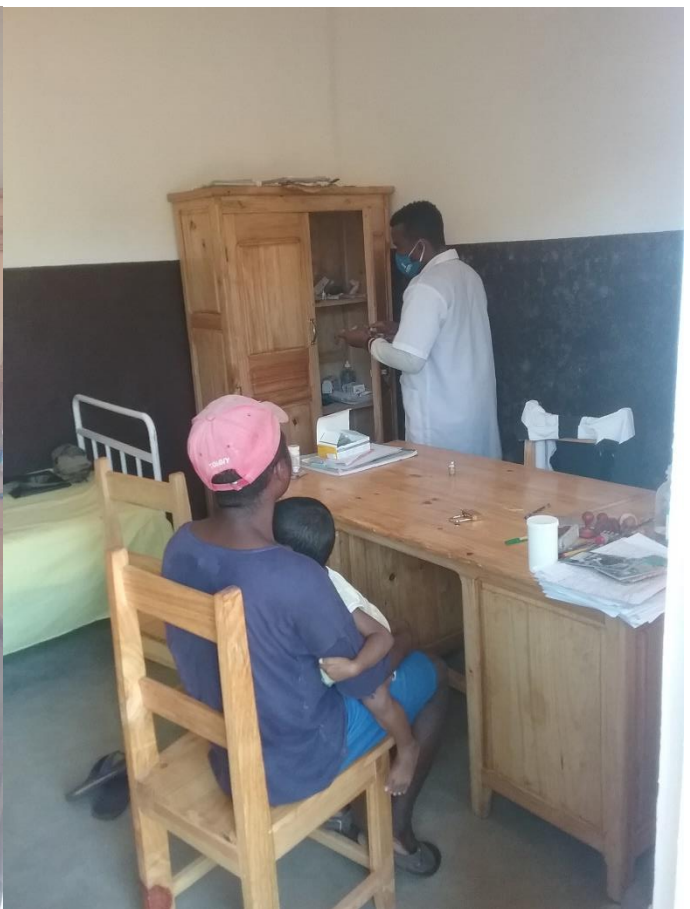
The head of the health centre receiving people for consultations.