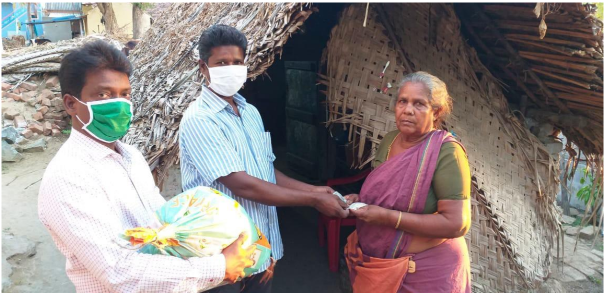
DISTRIBUTION OF LIVELIHOOD ASSISTANCE TO PHYSICALLY CHALLENGED