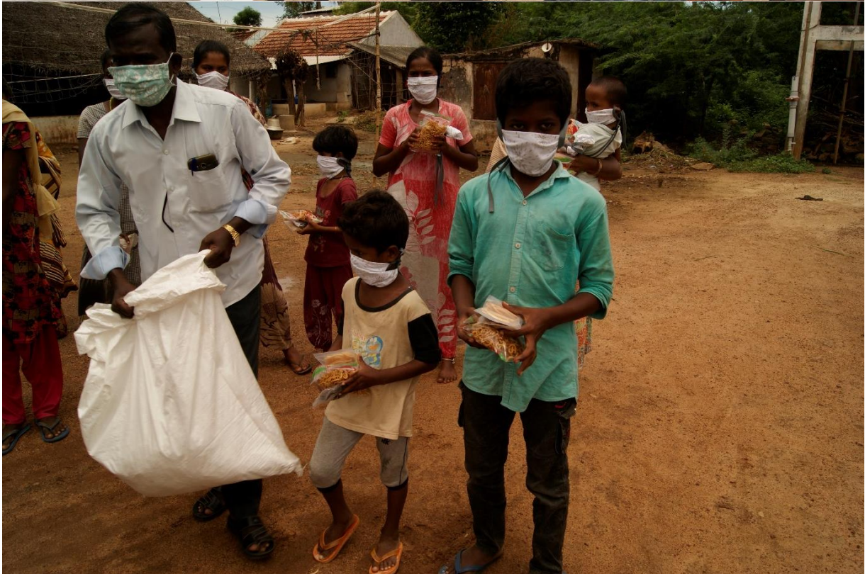
DISTRIBUTION OF MILLET SNACKS: