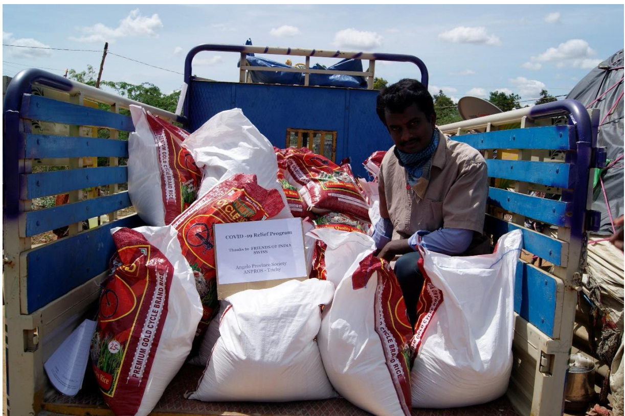
RELIEF PACKAGES READY FOR DISTRIBUTION TO THE SEMI-MIGRANT TRIBE OF GYPSIES OF VANDAYAMPATTI IN PUDUKOTTAI DISTRICT.