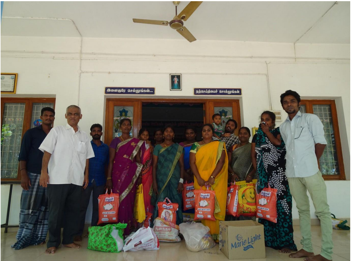
RELIEF TO POOR CATHOLIC FAMILIES WHO ARE DOESTIC WORKERS AND DAILY WAGE LABOURERS.