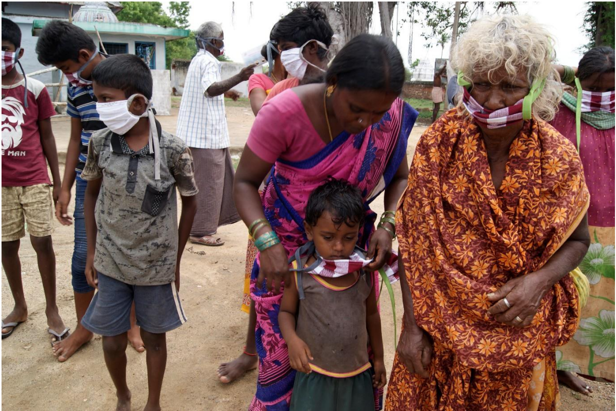
THE RURAL MASS WERE DISTRIBUTED WITH FACE MASKS FOR PROTECTING THEMSELVES AGAINST COVID 19 PANDEMIC