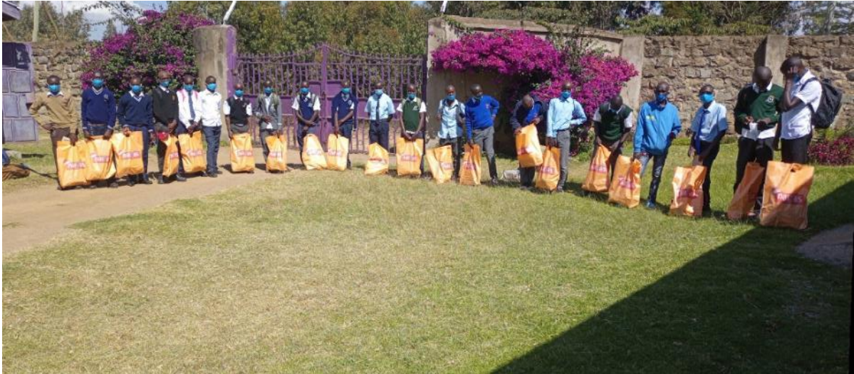
Some of our high school beneficiaries before they left for their various schools.

Before they departed to resume high school, we provided 46 boys with face masks and training to minimise the risk of them catching Covid while boarding at school.