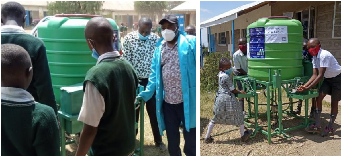
Left: Sunshine Centre staff instructing Karai Primary School pupils how to use the hand-washer, and the children using it (right)

We delivered these to Karai Primary School in the first week of January 2021 and instructed the school staff how they should operate them. We also supplied thermo-guns so that staff can monitor the children's temperatures.