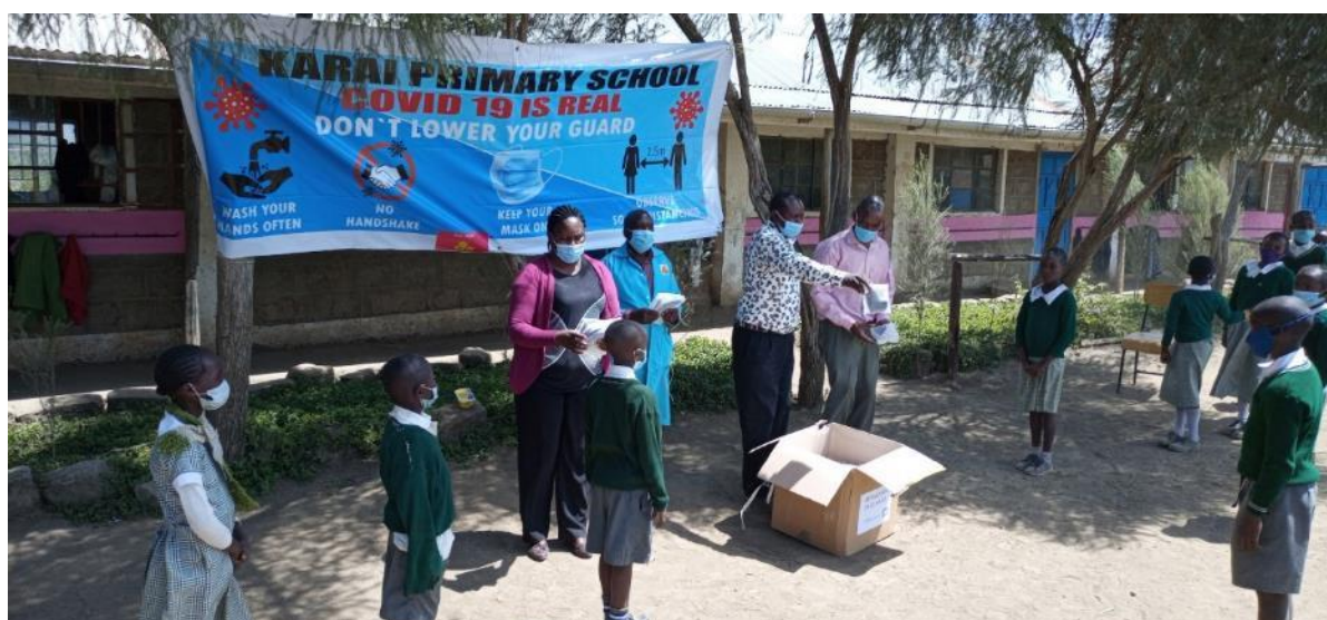
Distribution of re-usable face masks at Karai Primary School in January

We bought and issued 882 re-washable masks for our Sunshine Centre beneficiaries and staff, and for the 600 pupils at Karai Primary School that our boys attend.