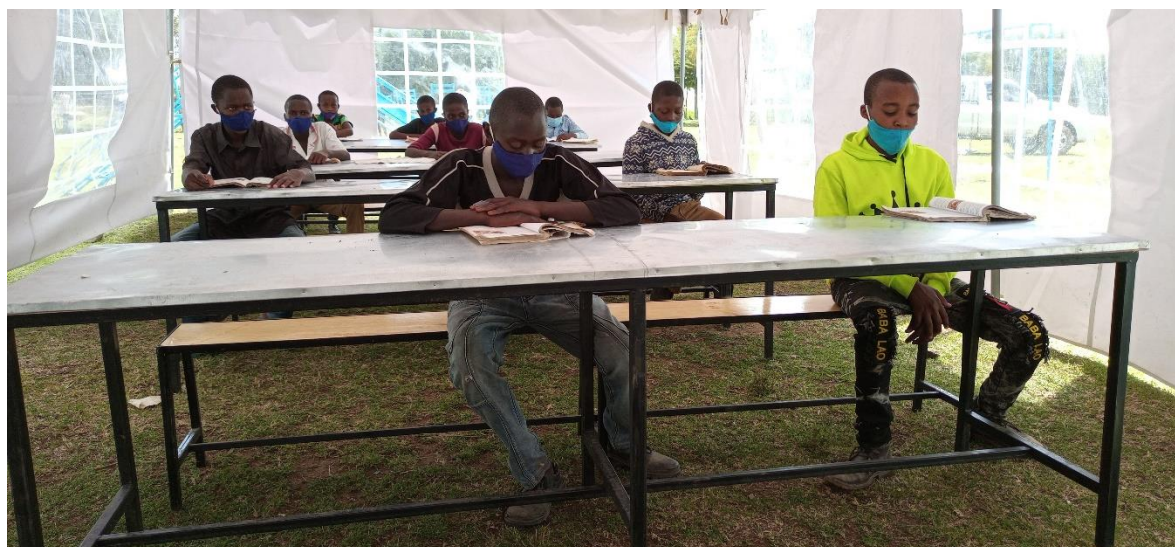
A group of Sunshine Centre boys doing their personal studies in the new marquee that has increased physical distancing.

We achieved this by providing additional 27 tables, 20 chairs and 22 benches in the dining hall and classroom. We also purchased and installed a 100-seat marquee to create more space for dining and evening classes.