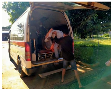
During the past two months, three women were transferred from Ou Chum Health Center to Banlung Referral Hospital. Thanks to early detection and recognition of danger signs and complications, the women were sent promptly and received treatment from a skilled birth attendant with quality maternity equipment that Fondation Eagle has kindly donated to Banlung Referral Hospital.