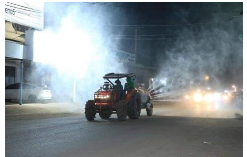
Sanitation activities were carried out across Banglung – the Province’s capital. Anti-bacterial solution is sprayed, including the market.

During the first major outbreak in the area, some areas around the market were placed under lockdown. Officials were concerned about the spread of the disease, which likely originated from Banlung market, however the market remained open. The market was eventually placed in lockdown on the 1st September, after 13 vendors tested positive. The provincial authorities announced that the public should restrict travel in and out of the region in June 2021.