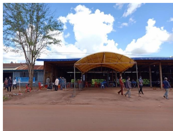
The preliminary checkpoint for COVID-19 rapid test at Ratanakiri-Steung Treng Border