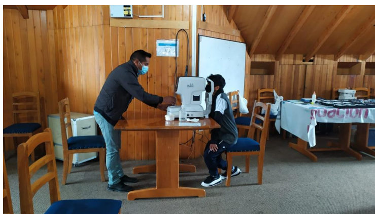
Campaign at Aldeas SOS in Quito, July 2021