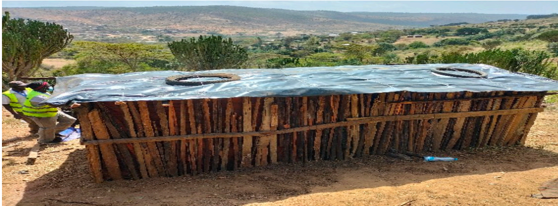
Sample house after reconstructing and roofing

Food was obviously our number one priority and an allocation to each family was made up of 8kg maize, 3kgs beans, 4kgs rice, 2kg sugar, 4kg porridge millet flour, 1kg cooking oil, 1kg of bars of soap, 1kg salt, 250g tea leaves and washable masks. Part of the funding was diverted to the provision of cooking pots ( sufurias ) enamel mugs, plates, blankets, toga (shukas) and items of clothing which had been donated by well-wishers. The decision to divert some of these funds to the purchases of above mentioned items was because we found out that in an average house of 8 people, they had only a of a couple cups, a couple of plates meaning they have to share in between them during meal time, rugged clothes or old hide skins are used for beddings and hence provision of blankets and some maasai shukas was also very welcome