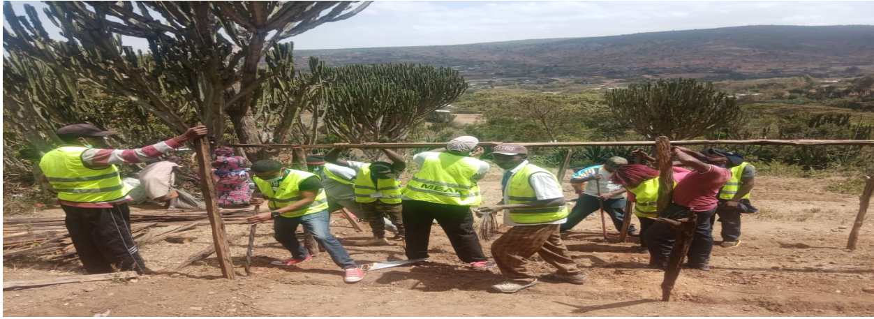
Construction on progress