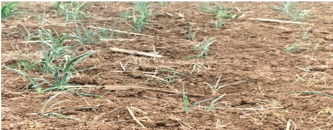
Failed crops due to drought

Samburu county is listed by the Kenya red cross society and other donor agencies as drought prone region with high malnutrition and listed as ASAL (Arid & semi-arid land). The Kenya meteorological department has also raise a red alert several times anticipating a shift in weather patterns which could lead to prolonged dry spell.