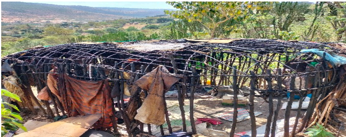
Sample house before roofing

Being the 11th MEAK Covid-19 relief feeding program and the 7 th to Samburu, the team has from the past missions used its experience and came up with a better and more suitable formula to offer the most beneficial help to these destitute people, for example, through some previous observations made, we deemed it necessary to replace the purchase of cabbages with high density PVC roofing polythene sheet since we found out almost 90% of the houses we fed had leaking roof.