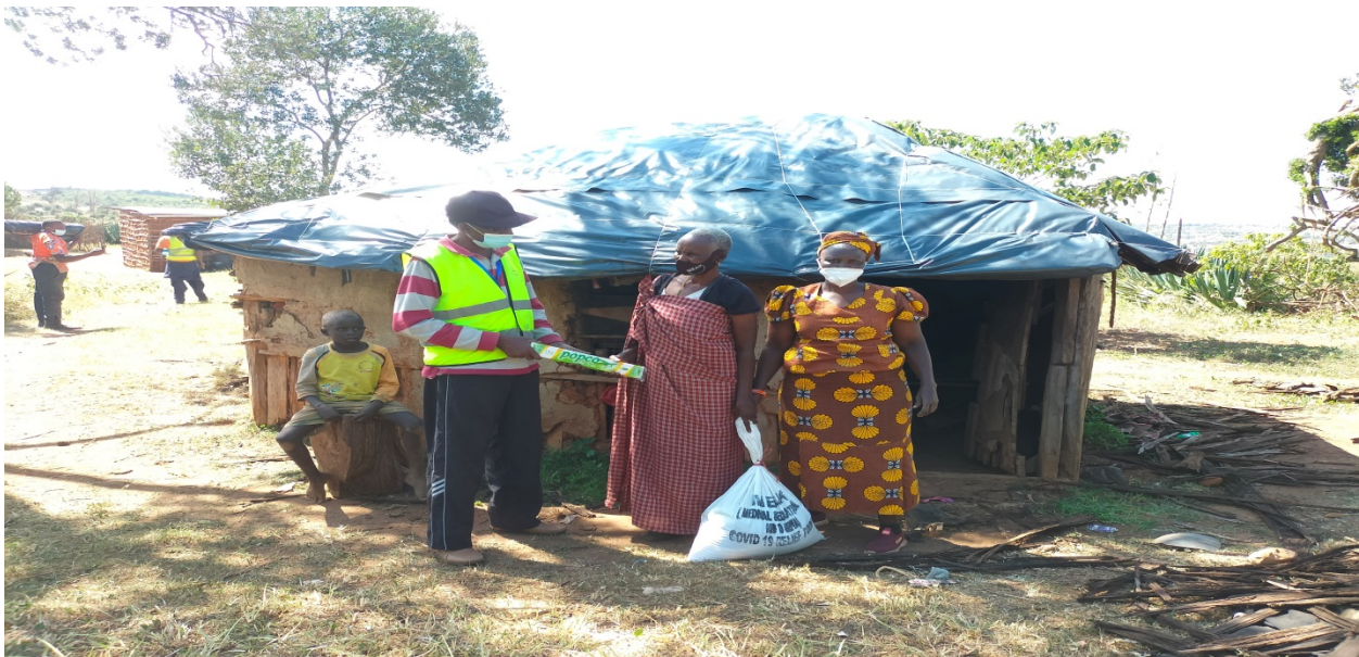
A household receiving a blanket, tarpo, plates, cups, sufurias and PVC roofings

Food was obviously our number one priority and an allocation to each family was made up of 8kg maize, 3kgs beans, 4kgs rice, 2kg sugar, 4kg porridge millet flour, 1kg cooking oil, 1kg of bars of soap, 1kg salt, 250g tea leaves and washable masks. Part of the funding was diverted to the provision of cooking pots ( sufurias ) enamel mugs, plates, blankets, toga (shukas) and items of clothing which had been donated by well-wishers. The decision to divert some of these funds to the purchases of above mentioned items was because we found out that in an average house of 8 people, they had only a of a couple cups, a couple of plates meaning they have to share in between them during meal time, rugged clothes or old hide skins are used for beddings and hence provision of blankets and some maasai shukas was also very welcome