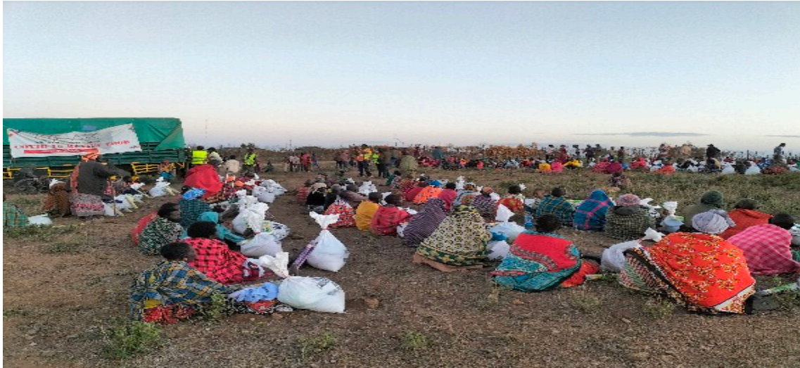
Feeding a crowd at Milimani village