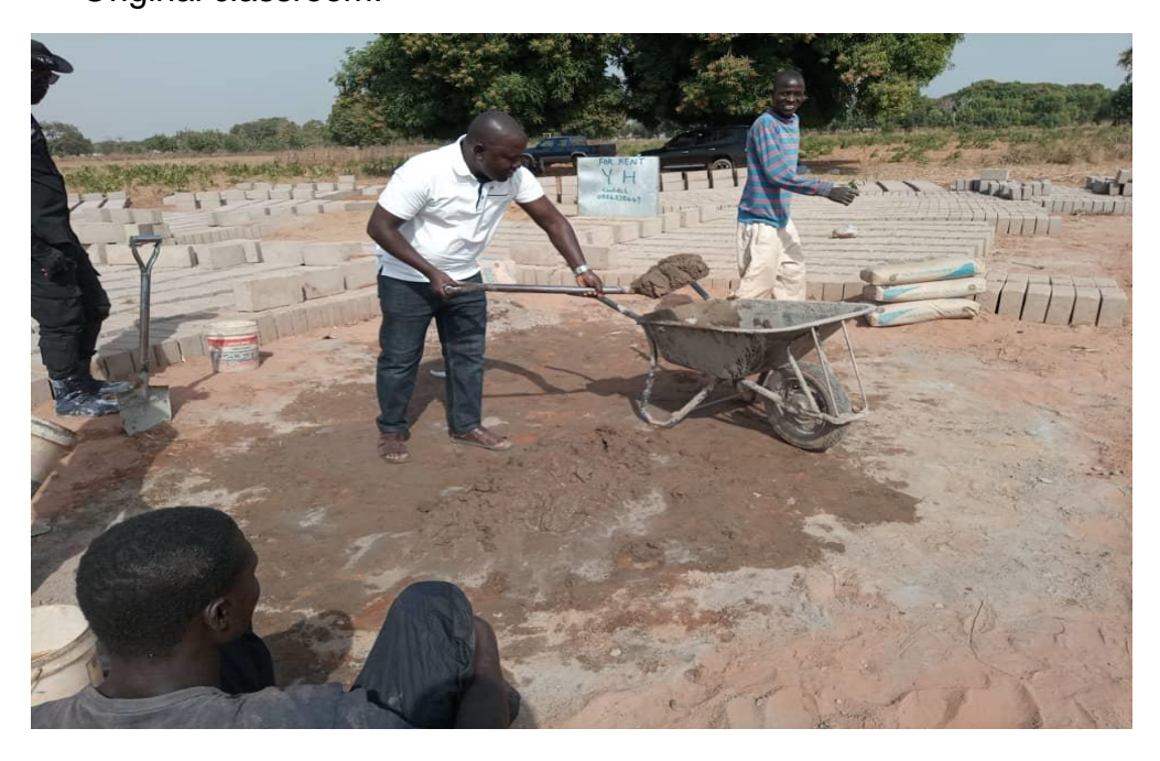
Building starts and the local MP visits the site.