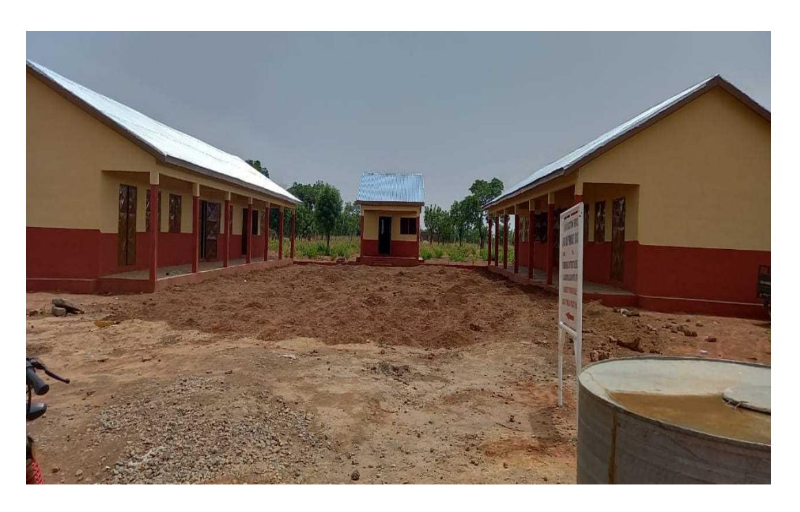
And finally a 6 classroom school.