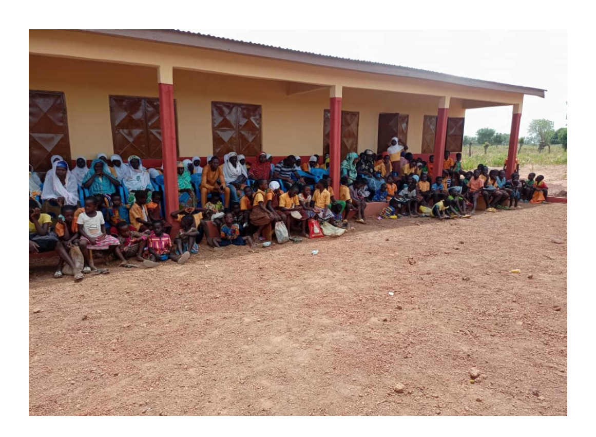
Children and parents at handover ceremony.

Our work with similar communities shows that families respond to a 'real' school by sending all their children, including their daughters, to school. This interfaith cooperation is refreshing in a world with so much dissent.