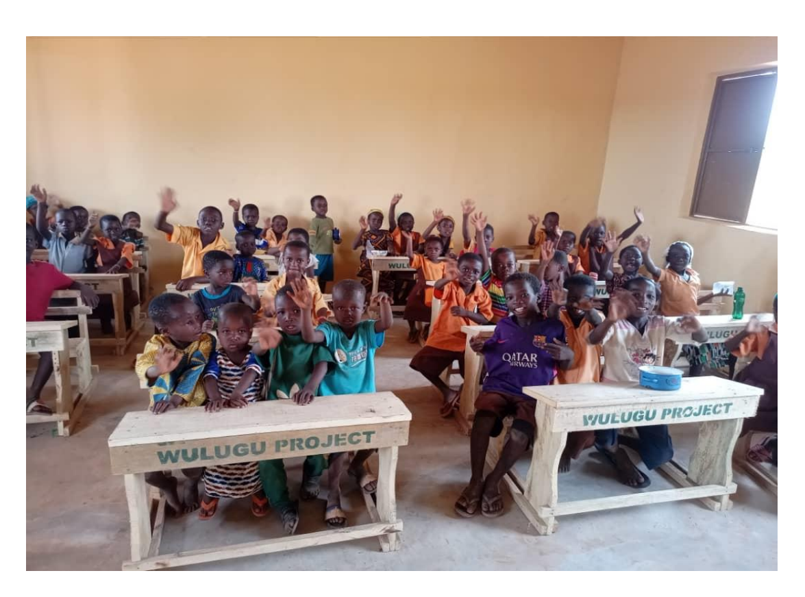
Pupils excited with new classrooms and desks.