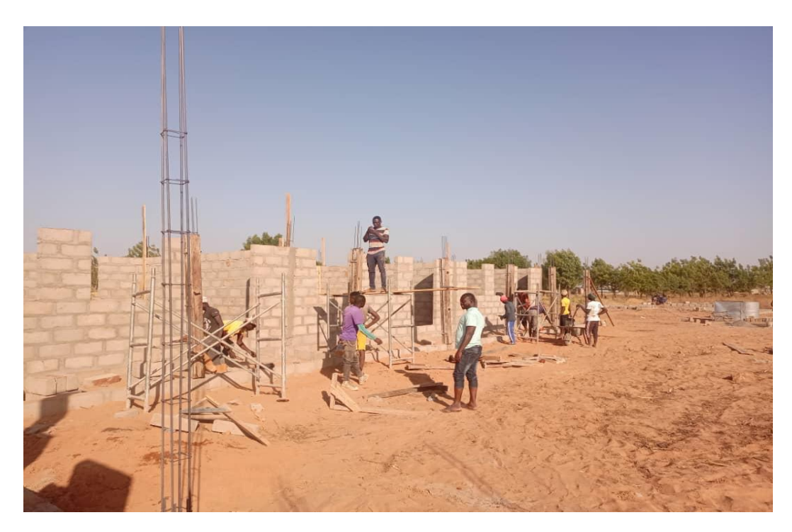
Classrooms taking shape.