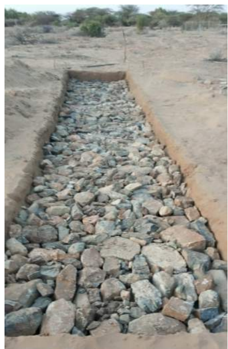
Stones collected by the car