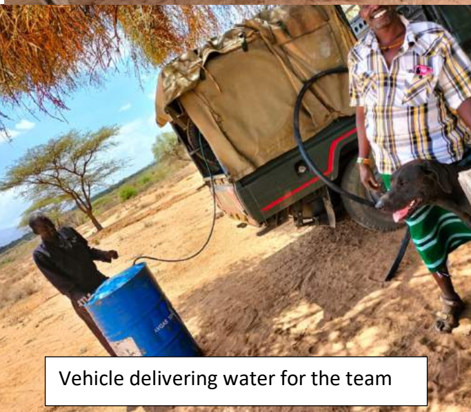
Vehicle delivering water for the team