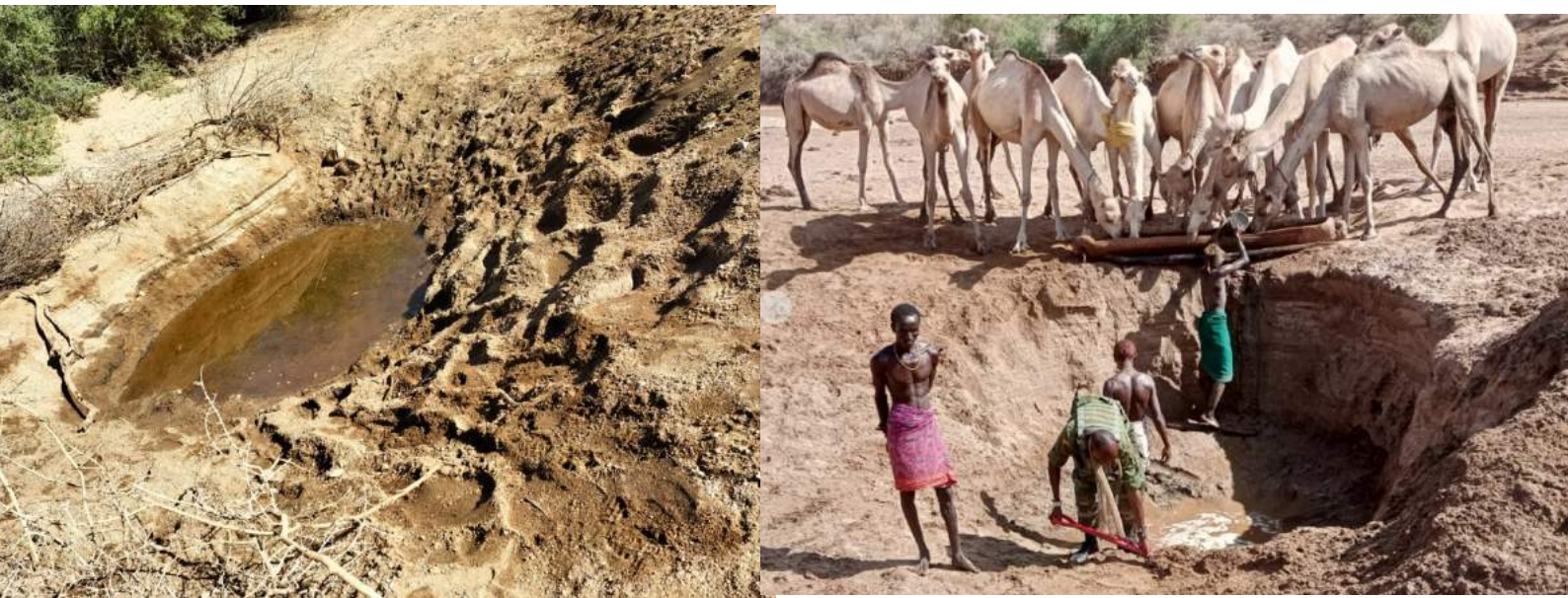
Left. A regularly used well. Right . A team of digging a ramp into a dangerous well. This enables all of the animals to safely drink. Especially Elephants and other endangered species such as Grevy's Zebra's.

Thanks to the vehicle we are also able to travel around, ensuring that our 'ele-friendly wells' program is happening. Our scouts are working with herdsman to dig 'ramps' into their wells everyday so that elephants can drink safely. The majority of incidents have involved younger animals who were trapped in deep wells because they were unable to reach the water. We were able to coordinate 1 rescue - the vehicle has been essential in delivering people to coordinate the rescue, and in some cases the vehicle has been used to pull the elephants out with a rope.