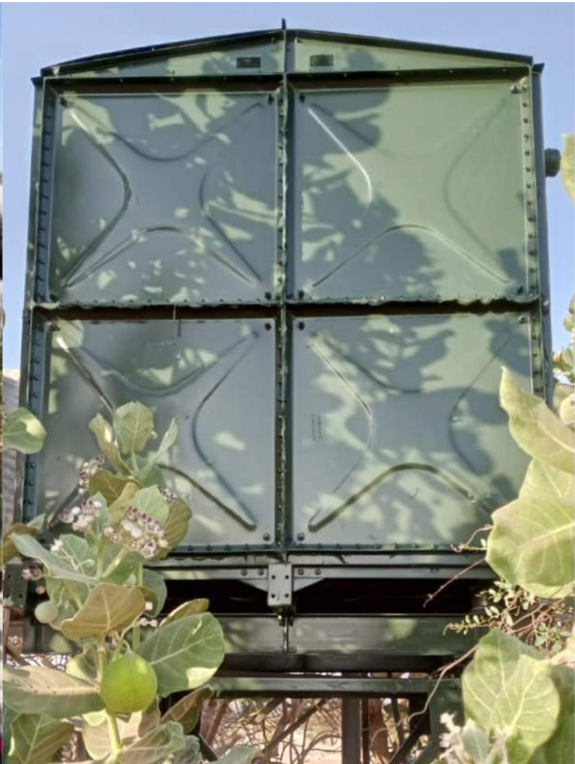
The new steel tank- painted and installed