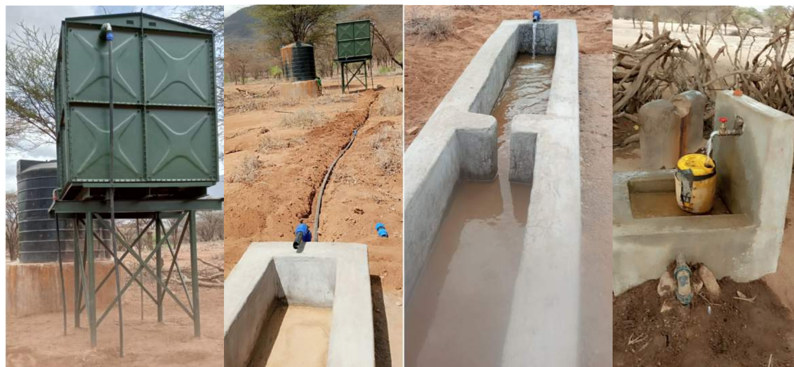
The new steel tank

The vehicle was essential for the installation of this unit, and provided all of the support needed for a succesful installation.