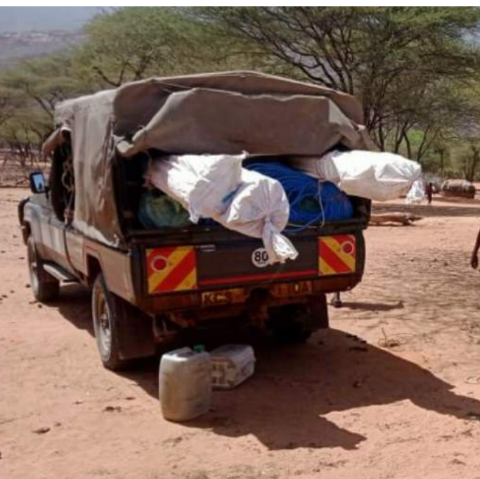
Fencing wire being delivered