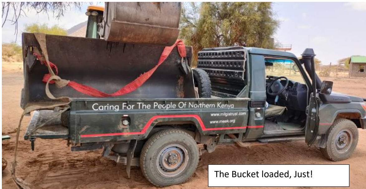
The Bucket loaded, Just!