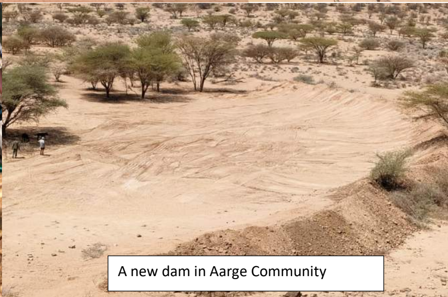
A new dam in Aarge Community