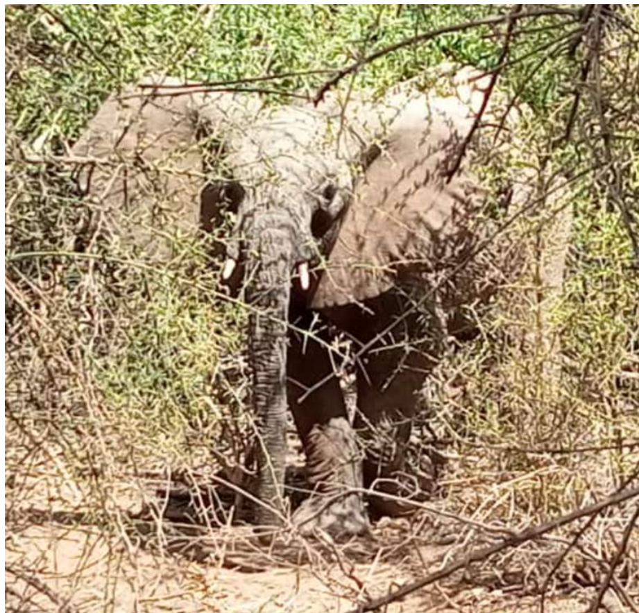
The same elephant , sad to have lost him