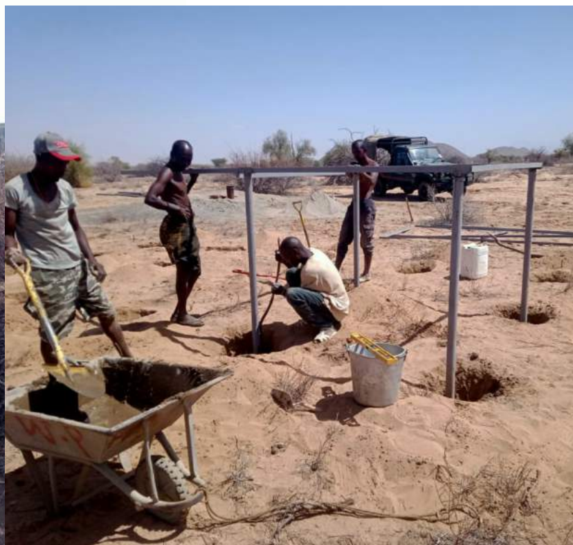
Sweltering heat to work in! The car's inbuilt water tank was a savior for the team