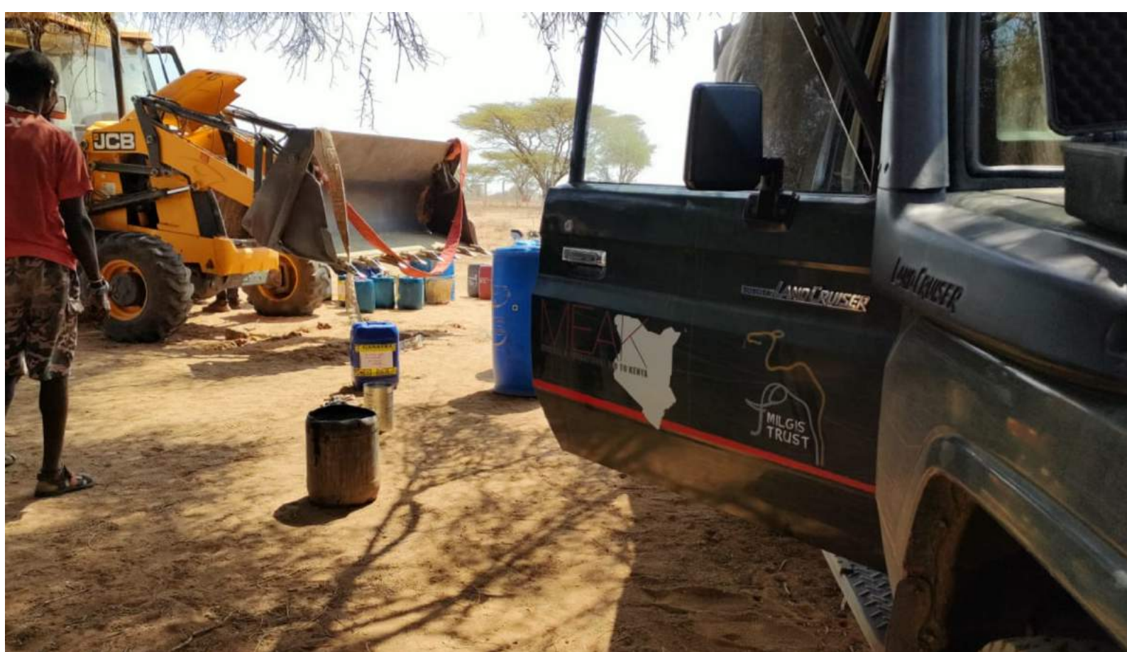
Service Visit to the Tractor

Our dam building team have been very active, trying to put in as much water storage as possible. The drought has meant that the dams are empty – which creates a window for de-silting and rebuilding weakened dam-walls. When they are busy, the team must move every couple of weeks to a new site. The JCB tractor cannot carry all of their equipment, so the vehicle steps in to help. It is responsible for mobilising the team - and also for delivery of fuel, water and services. Thanks to the support from the vehicle we've been able to build 5 new dams and desilt 3 so far this year. A big job that the vehicle helped with was removing the main front bucket of the JCB. Once loaded, the 600+kg bucket was driven 400 kms to Nanyuki where it is being re-furbished. One fixed, the vehicle will then return it to the field.