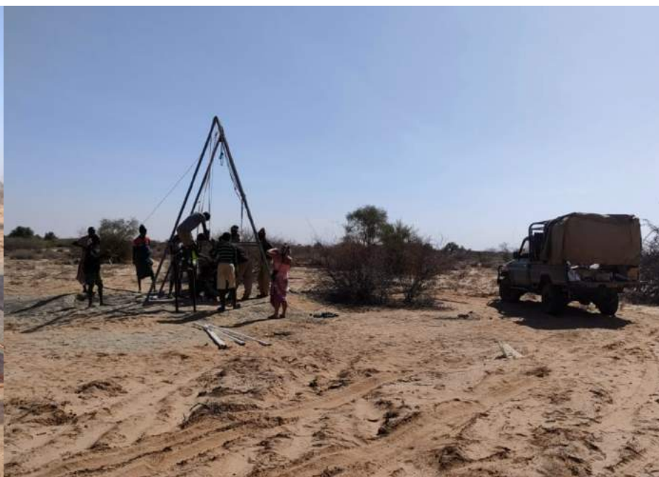
The painstaking task of lowering the very heavy pump, 200 metres down!