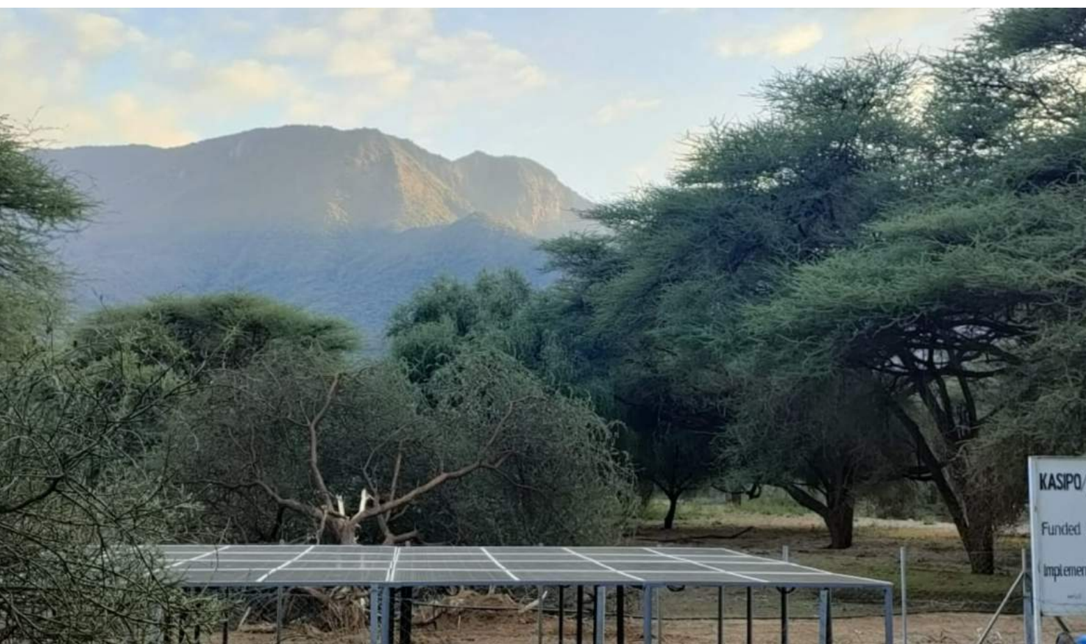
The Kasipo system with Ndoto mountains in the background