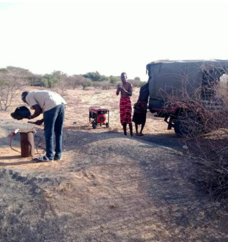
The beginning! Just a borehole and a long way to go.

One of the new projects that we have implemented is on the edge of the Kaisut Desert – an area where water is very scarce. Fortunately there is a large seasonal river bed called ‘Lugga Moran’, flowing from Mount Nyiru which is the next mountain further north of the Ndotos, which hosts a small aquifer. This borehole was already drilled in 2017 by a road building company that needed water for their road construction. However it did not yield enough so the driller handed the borehole over to the community – provided they found their own way to develop the borehole. Thanks to the vehicle, we were able to mobilise cement, solar panels and steel to complete a very successful job! The vehicle also supported the test pumping lorries who got very stuck in quicksand on their way to the site.