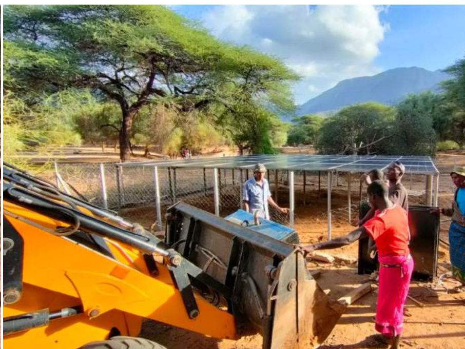
The JCB also helping with the work