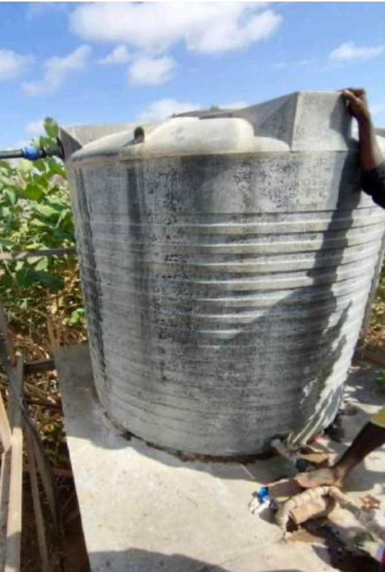
The old tank, damaged by the sun and leaking

We had chosen Mikenya to be one of the projects that we test out the new steel water tanks, included in last year's Q3 budget. The fabrication took longer than anticipated and we only mobilised the tanks in Jan 22'. The newly installed unit is fantastic! Not only has it improved the storage capacity, but it has also improved water quality as there is a tank cleaning valve and no degraded plastic sediments. The vehicle was used to deliver this one ton piece of kit, and carried all of the supplies needed for the installation.