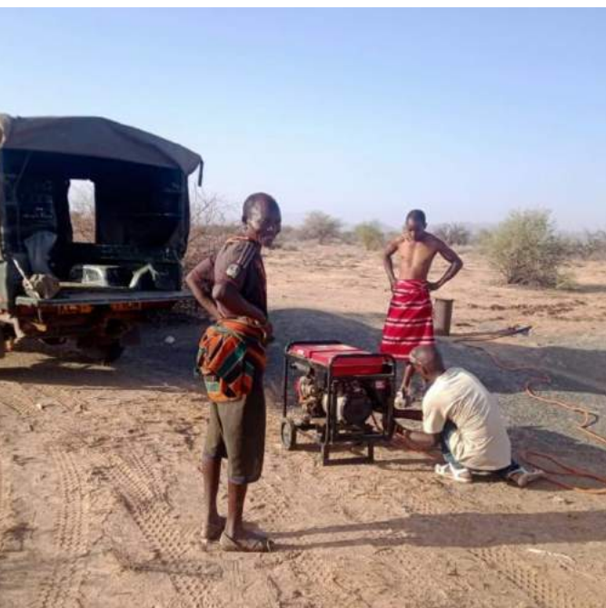
Welding machine issues!