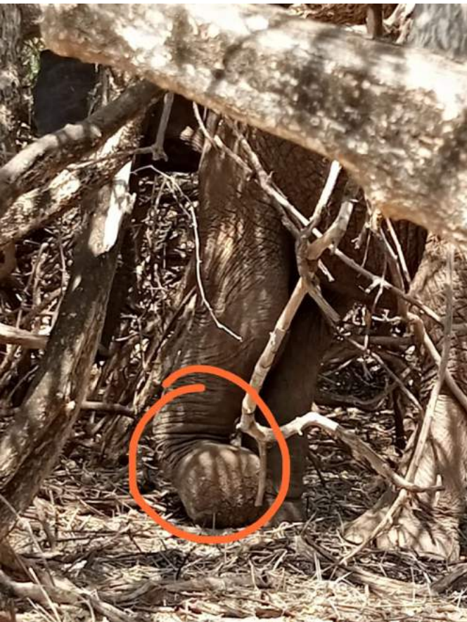
Poor fellow with a very sore foot

The vehicle was useful in responding to the below incident. A younger elephant was seen to be limping badly and not eating. Our team were able to monitor the animal and mobilized a vet using the vehicle. Unfortunately the infection was too severe and the ele succumbed – the vehicle was then used to support KWS in removing the ivory.