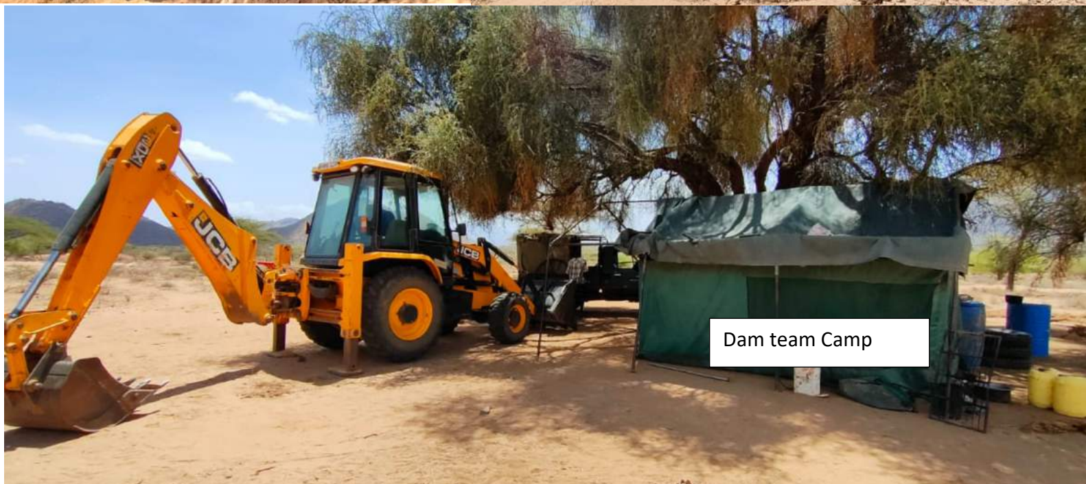
Dam team Camp