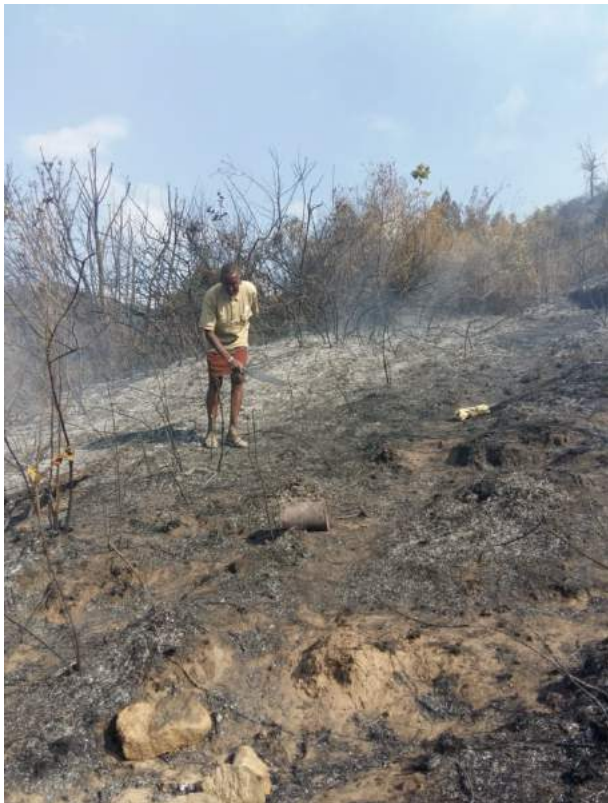
A scout inspecting a fire

With the extremely dry conditions , there has been a lot of fires – some intentionally lit whilst others are mistakes. The vehicles has been crucial for helping our teams respond quickly. Although many of these fires cannot be contained, it is essential that our scouts get to the scene promptly so that they can follow up the cause of the fire. Thanks to the vehicle, we have been able to deliver food and supplies to the teams on the ground.