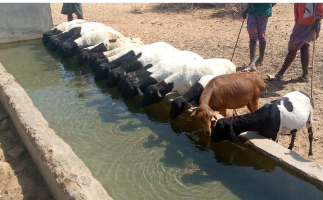
The final product – very fresh water! A huge relief for the community..