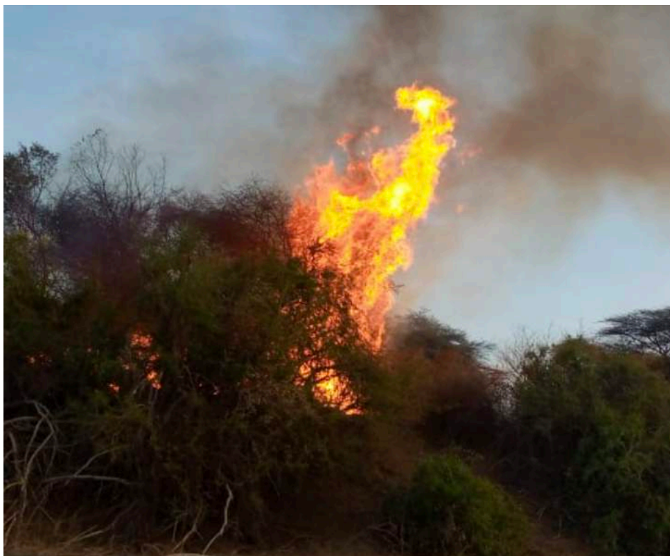
One of the many fires we have witnessed this season