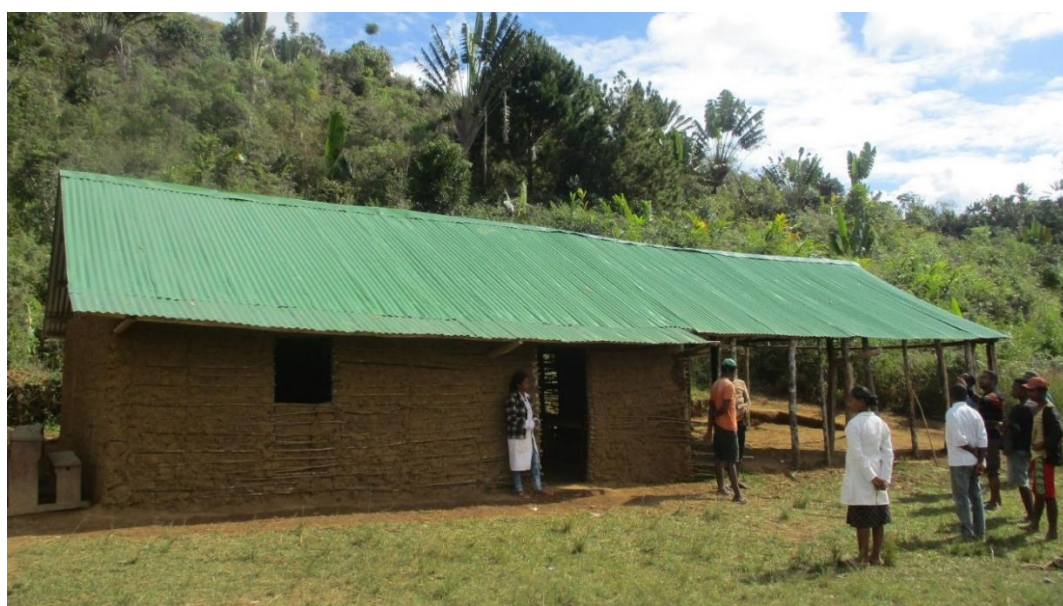
Ambohimisafy Primary School (Ambiabe municipality)