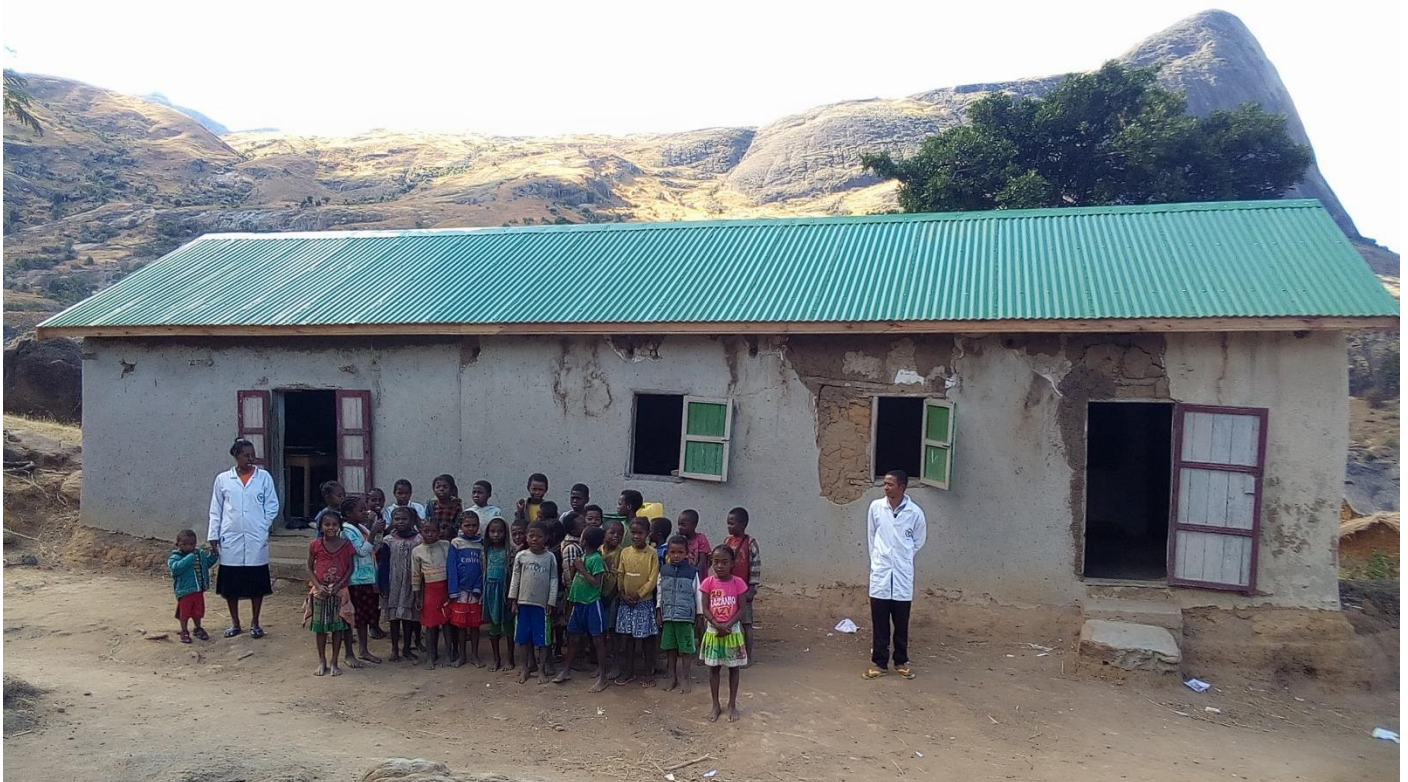
Ambatomainty Primary School (2 nd building), Vohitsaoka municipality.

h. Conversion rate, date & amount in local currency: Conversion rate £1 = 5,079.5 MGA, 7/1/2021, Amount in local currency = 288,113,775 MGA