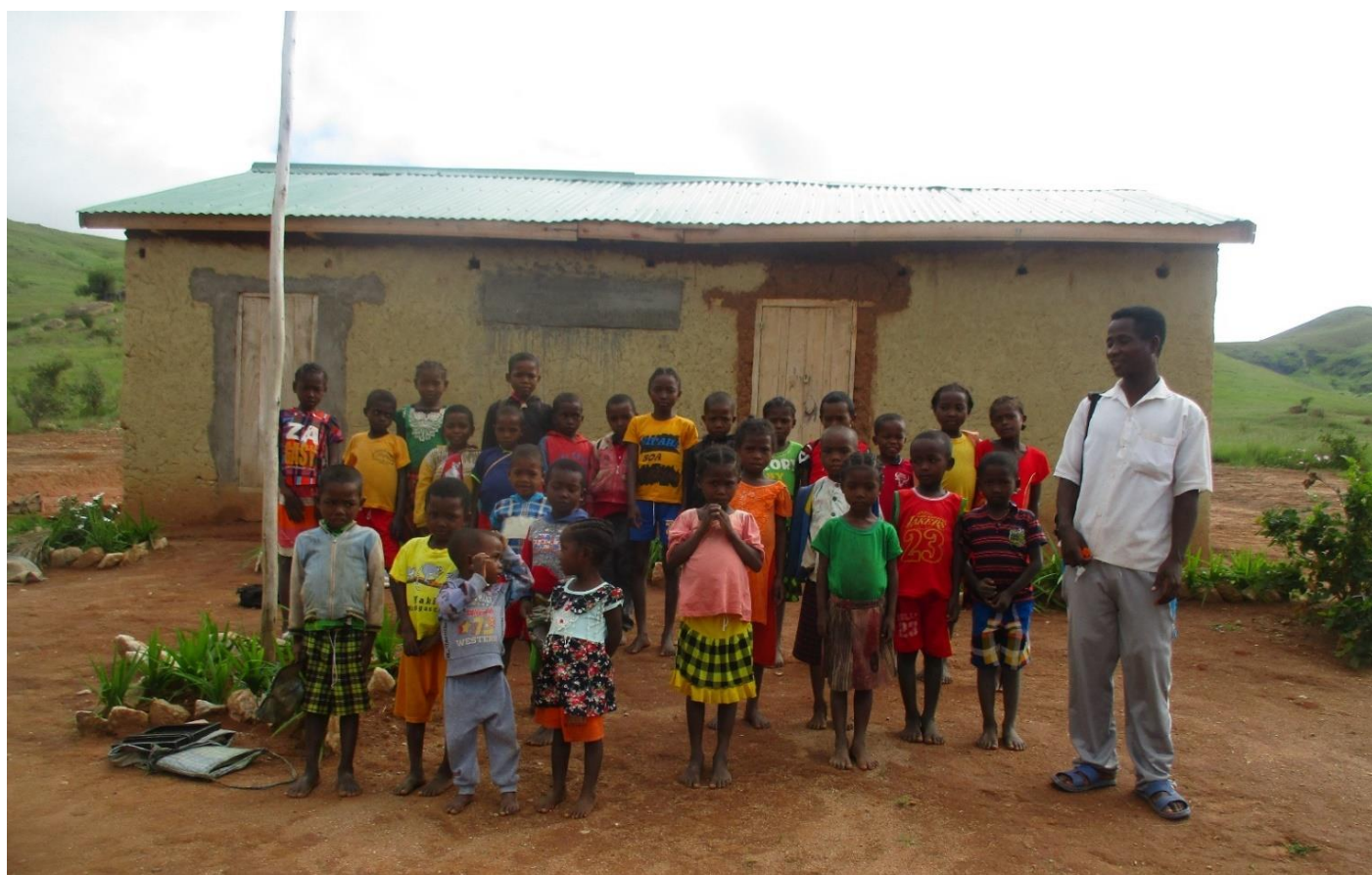
Vohitsaoka Primary School Annexe with its new roof.

Details on expenditure can be found in the attached excel spreadsheet.