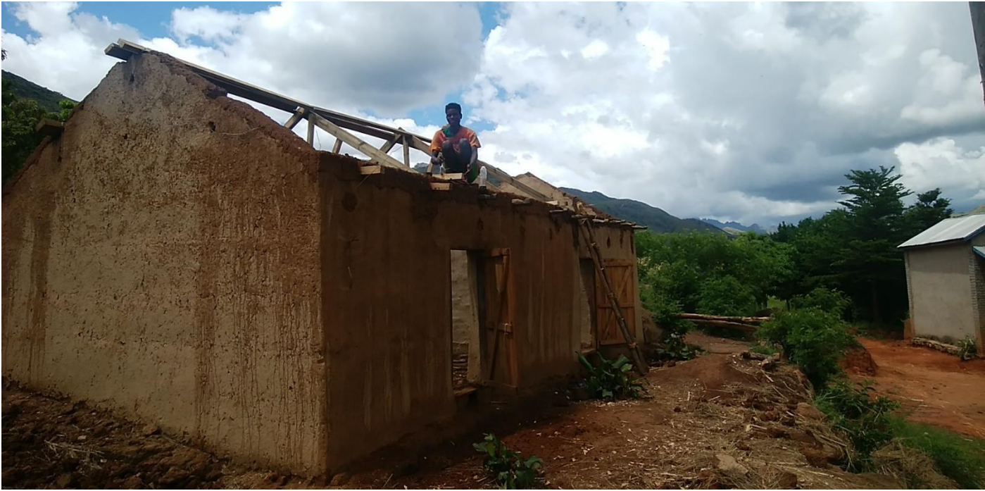
Iakanga Primary School (before and after).