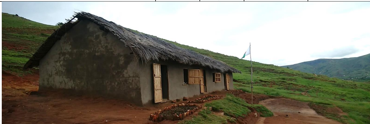
Vidia Primary School Annexe (Vohitsaoka municipality) before (above) & after (below) the project.