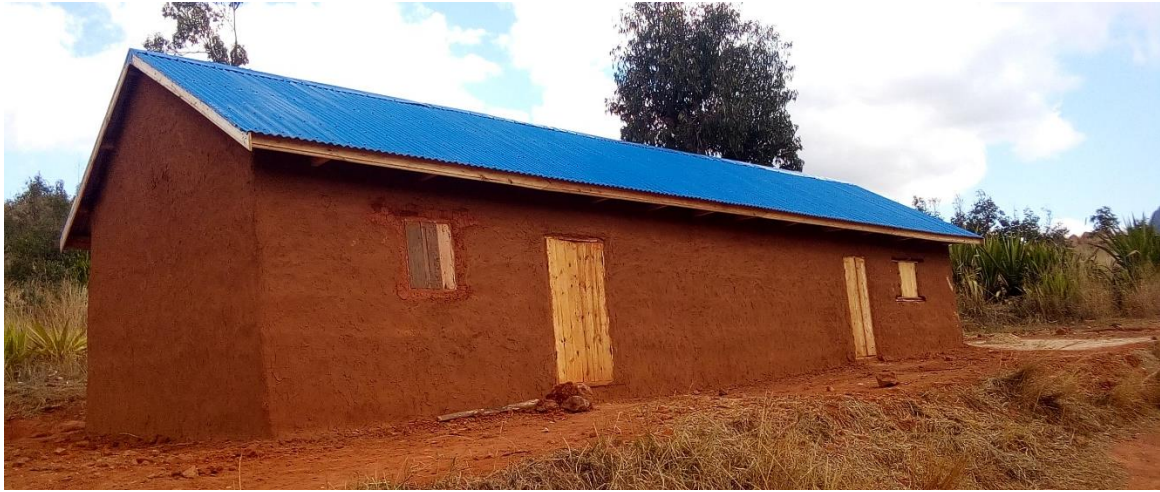
New rooves for Soaniatera Primary School (Vohitsaoka) (above) & its annexe (below).