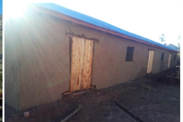
Androtsa Primary School (Vohitsaoka municipality) during (left) & after (right) the roofing operation.