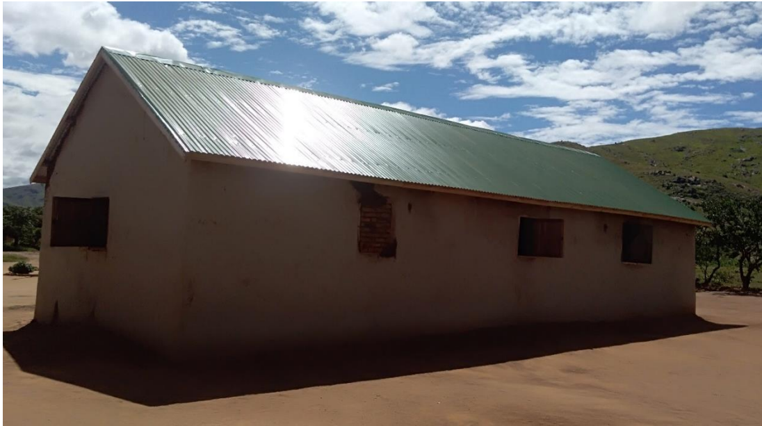
Vidia Primary School (Vohitsaoka municipality) with its new roof.