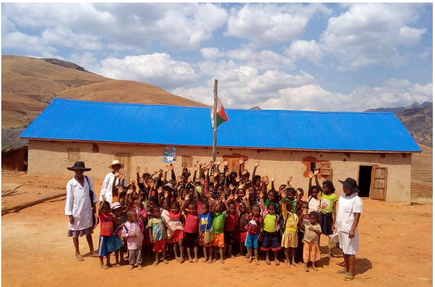
Ambalamahasoa Annexe School (Vohitaoka)