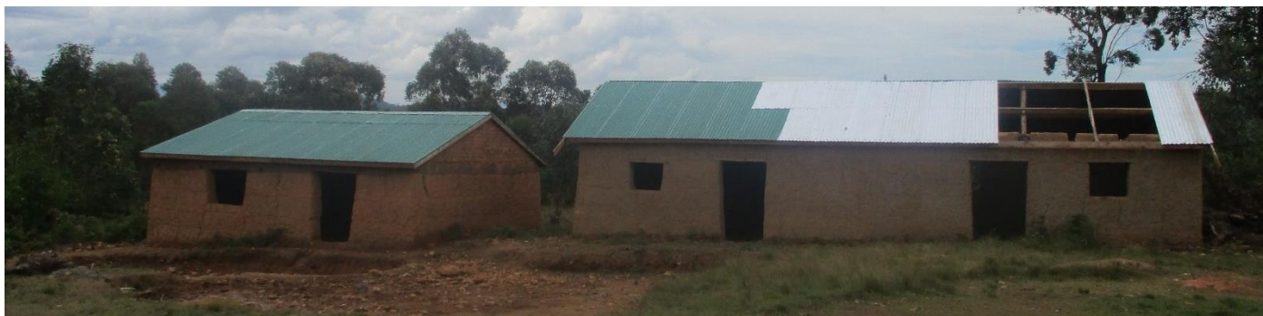
ECGD Fangaihana Primary School (patchwork-style roof as a result of insufficient metal sheeting).