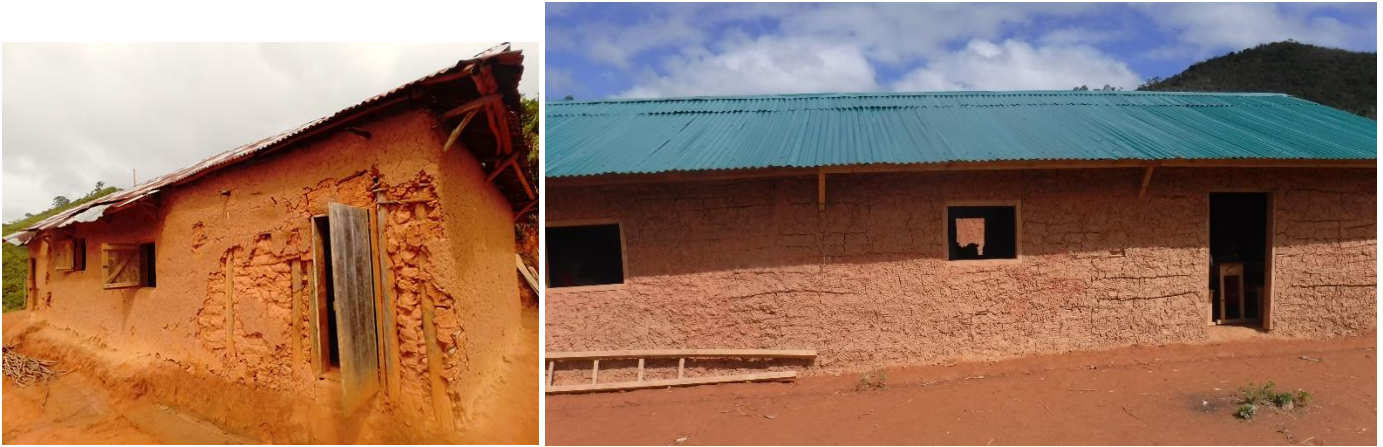
Beremby Primary School (Andefaony) – before and after.