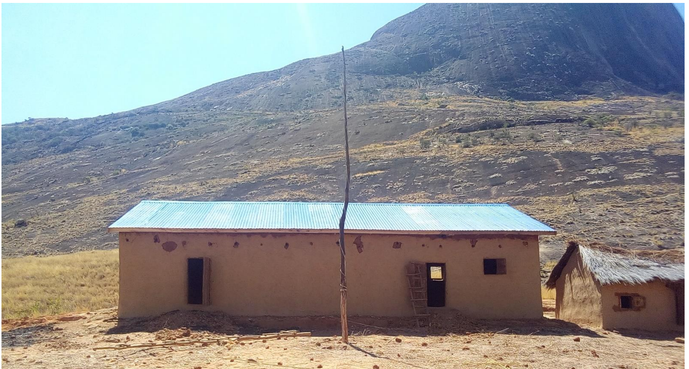
Ambatomainty School Annexe (Vohitsaoka).