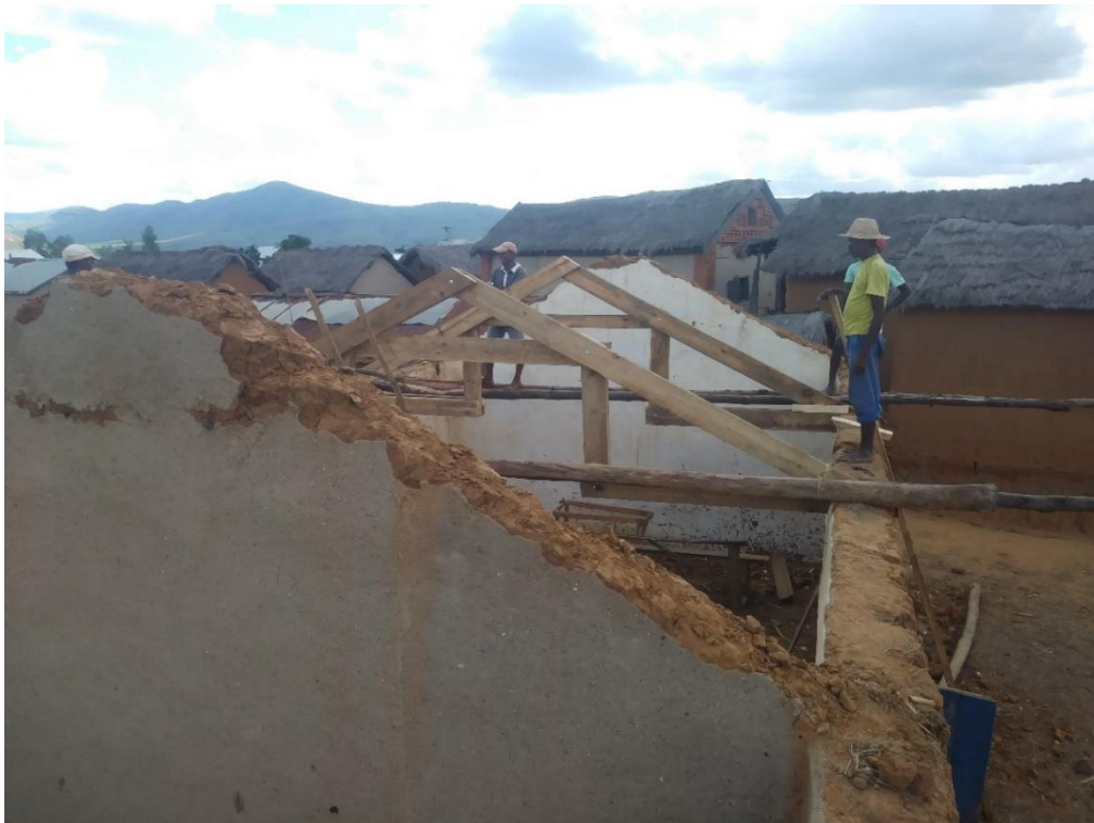
Re-roofing Tsaramandroso Primary School in Vohitsaoka municipality.