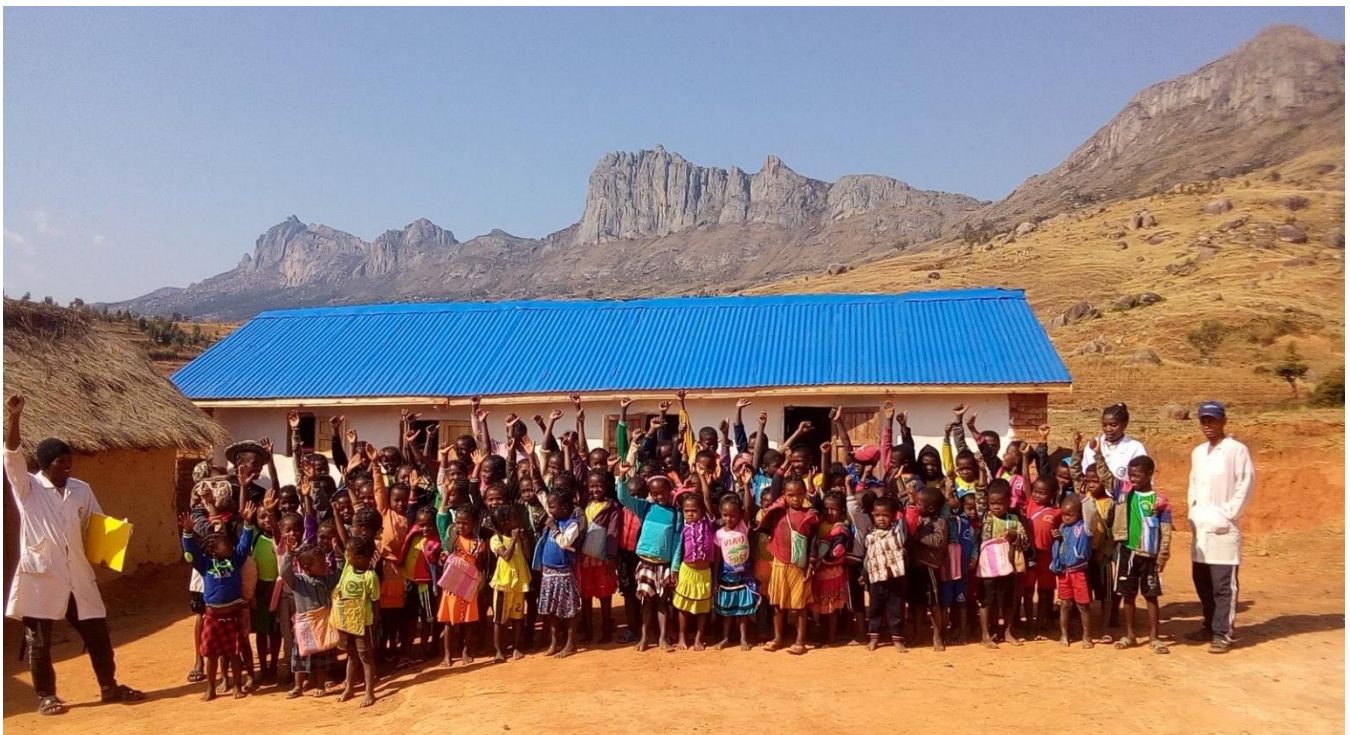
Ikiba Primary School (Vohitsaoka)

Numerous schools from both the same and other municipalities, who have not yet benefitted from this project, have since requested help in order to have additional classrooms in light of over-crowding. This shows how great the need is and how hugely appreciated this project is in order to improve the quality of education in rural Madagascar in the context of COVID-19.