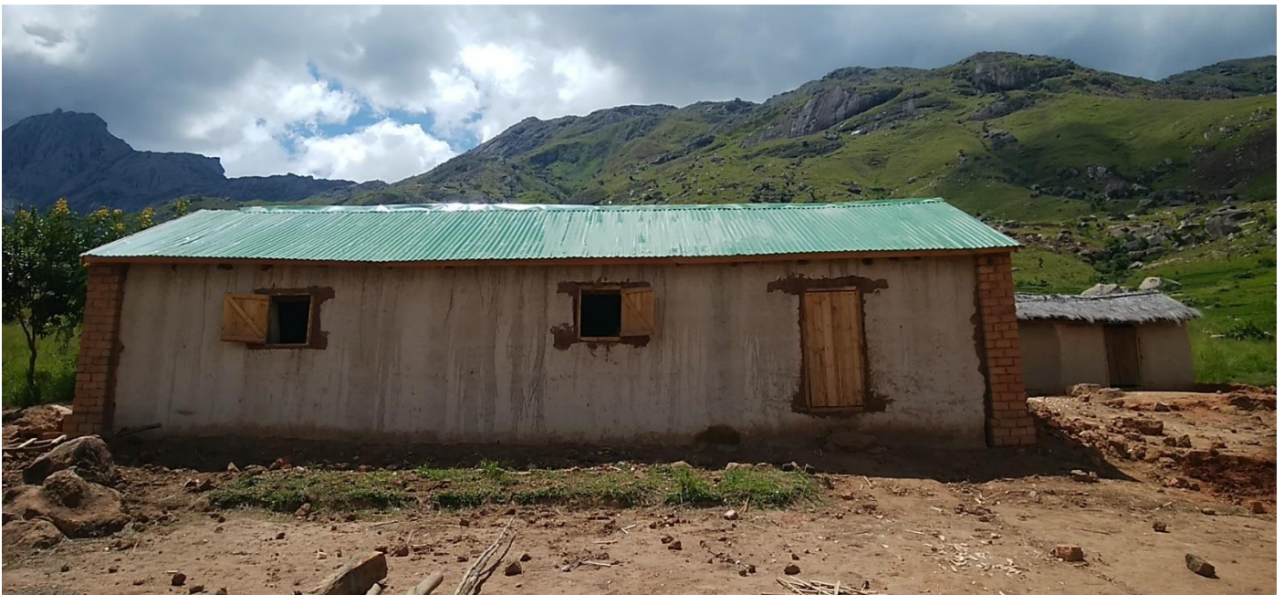
Morarano Primary School