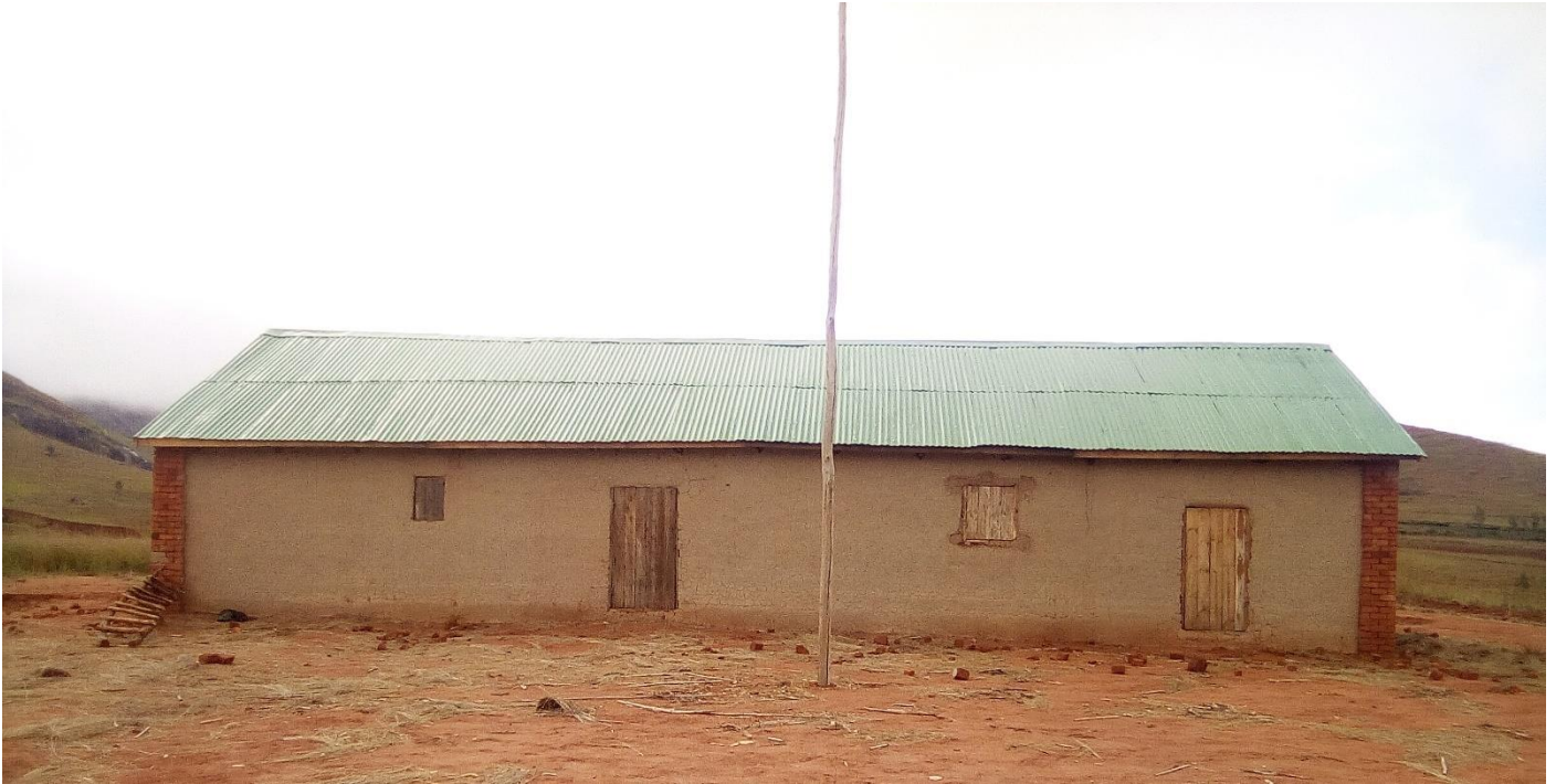
Antananarivokely School Annexe