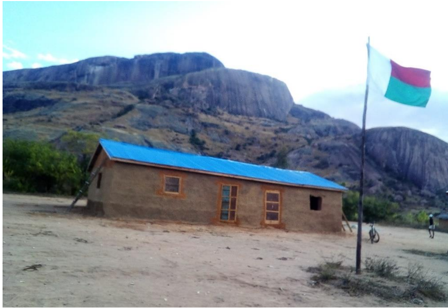
Bedita Primary School.