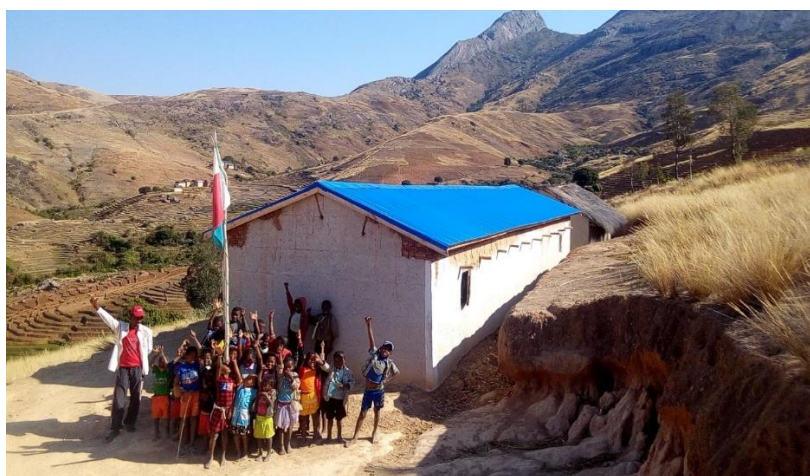
Vohimarina Primary School (Vohitsaoka).