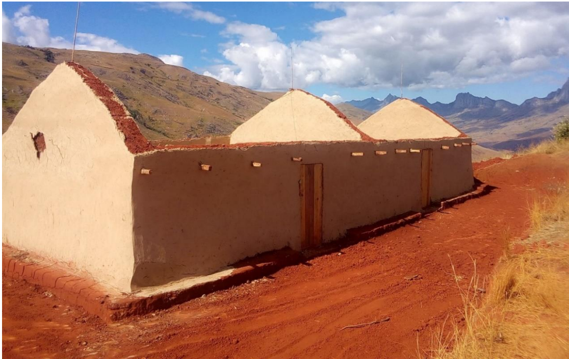
Soaniatera Annexe Primary School before (above) & after (below) receiving its new roof.