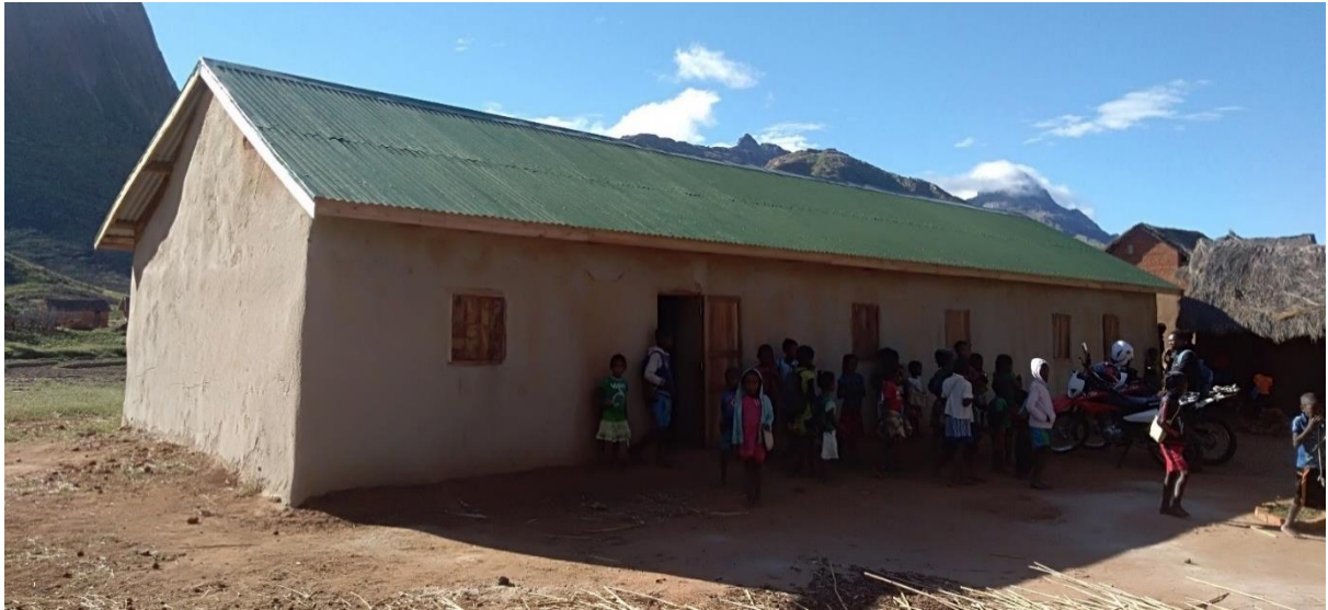
Ambatomainty Primary School, Vohitsaoka municipality (above & below).