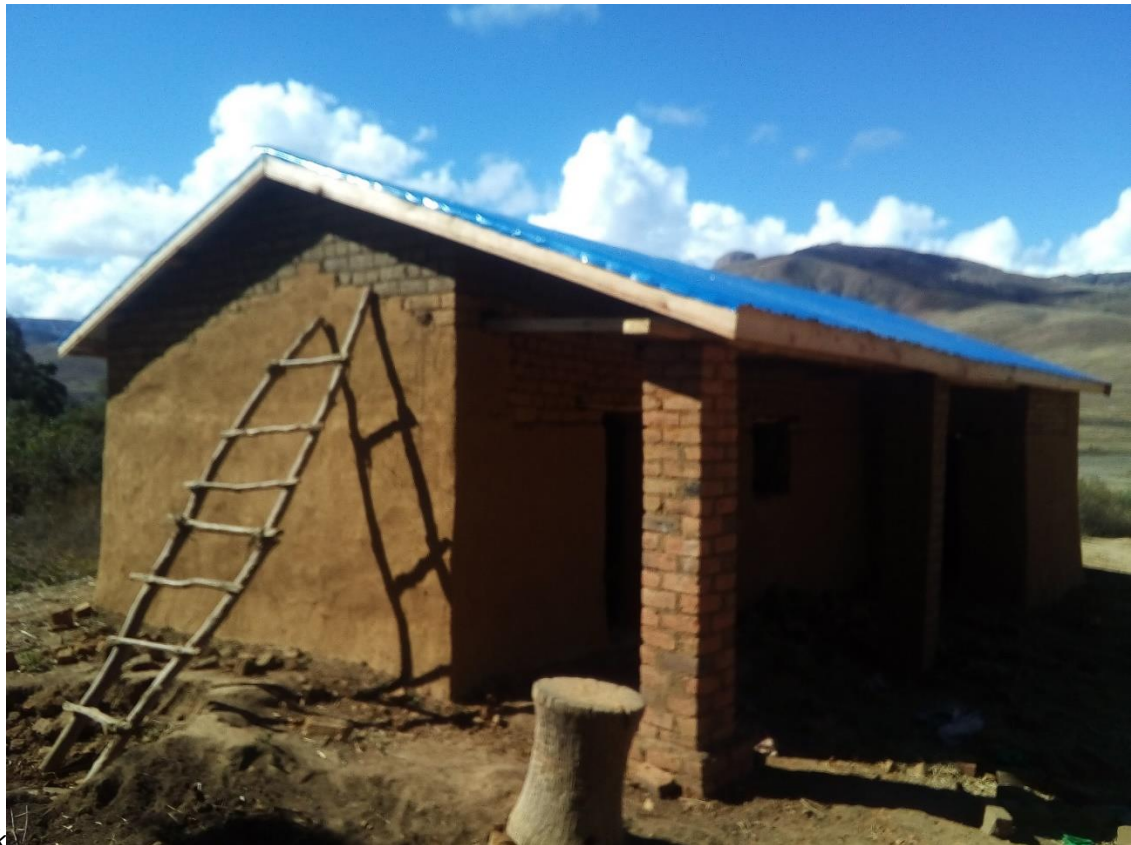
Soatsihadino Primary School