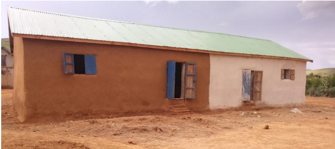
Tsaramandroso Primary School newly-roofed.