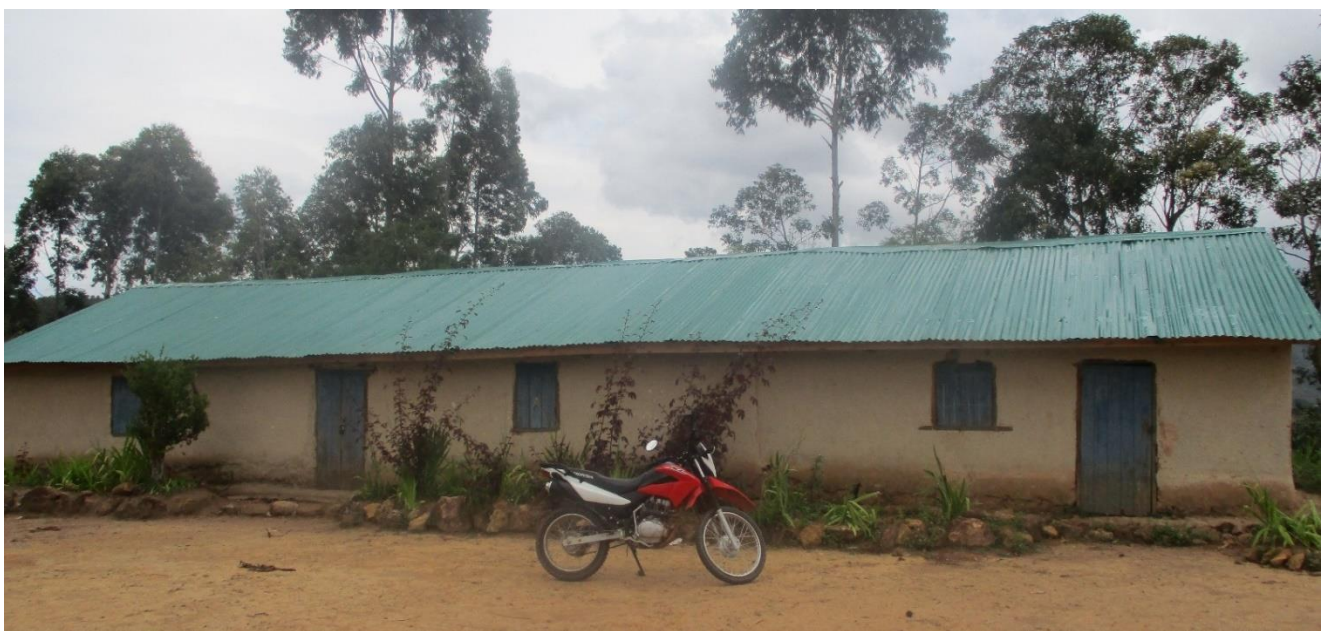
Ambalamananenjana Primary School (Miarinarivo municipality) re-roofed.