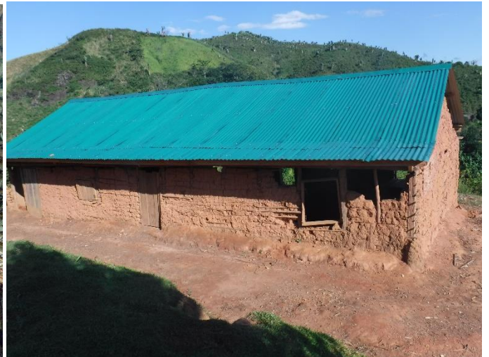
Ambatodinga Primary School (Andefapony) – before and after.