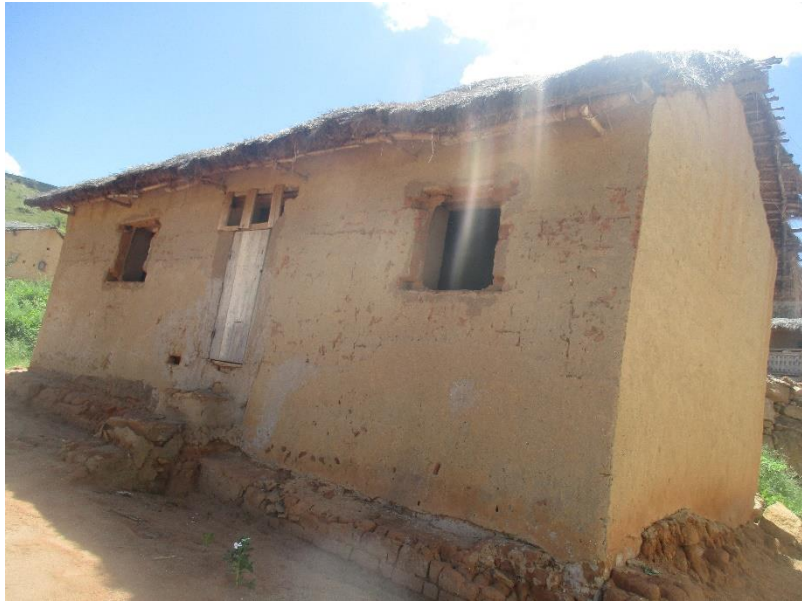
Ampandroaboro Annexe – school buildings before (above) and after (below).