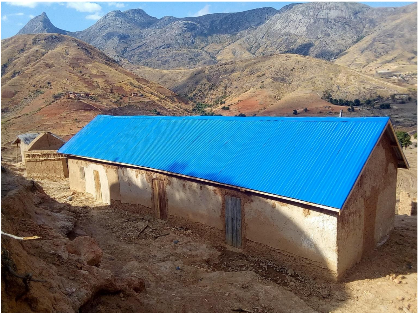
Soarano Primary School (Vohitsaoka).