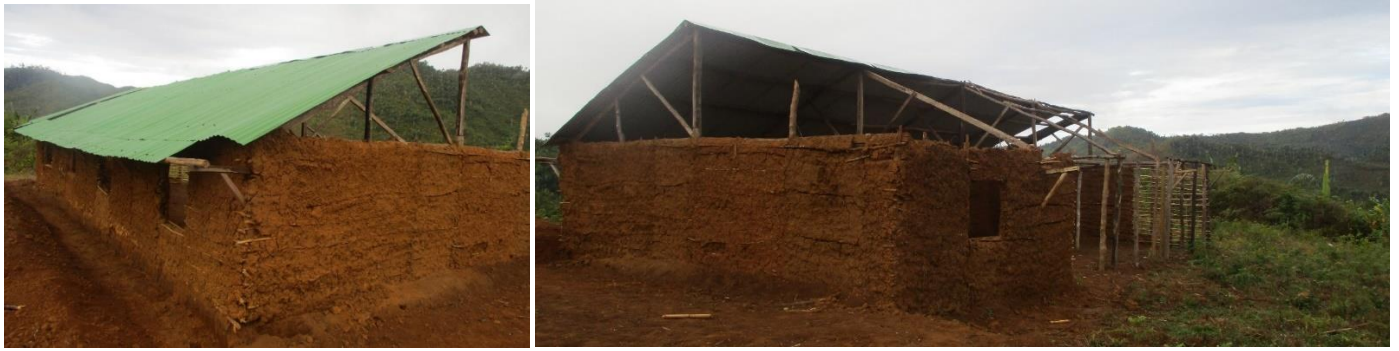
Ambodirotra Primary School.