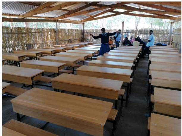
The desks ready to be moved in