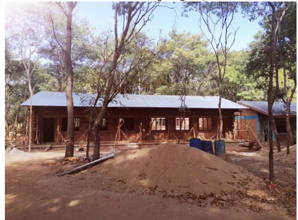
The roof is on