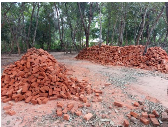
Bricks before the construction started

The classroom block has now been built, photos of the construction are shown below: