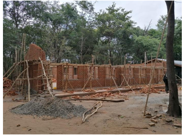
Walls starting to go up