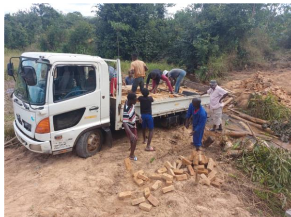
The lorry bringing the bricks got stuck at a makeshift bridge