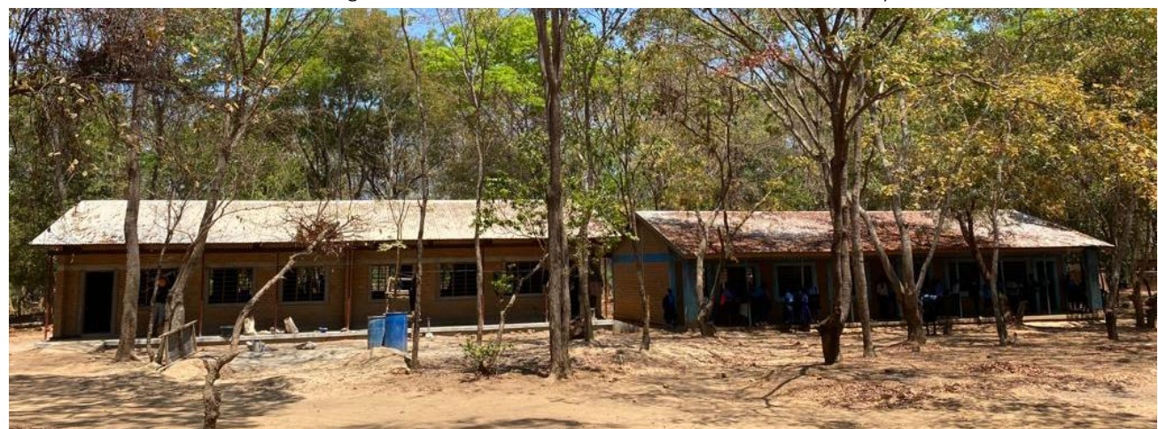
Finished double classroom block