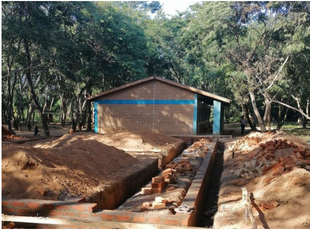
Foundations being constructed