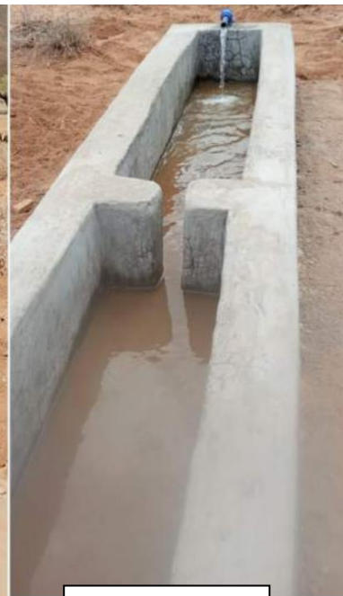
New trough filling up