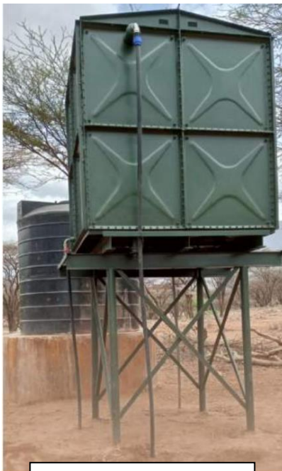
New water tank

Loltepes is also on the eastern side of the Ndoto's. As you may recall, the plastic tank here had also been damaged, this time by a thirsty elephant. We had also allocated some funds for (installation only) of a new tank and steel stand in loltepes. We installed this tank at the same time as Mikenya. Additionally, we refurbished the piping , which was also damaged. The trough here which acts as an overflow had been destroyed by elephants, so we also repaired the trough. Furthermore , the community standpipe had been damaged by warthogs that had burrowed underneath the slab – probably in search for water - so we built a new standpipe. The overflow from the tank now feeds the trough so that wildlife can drink without having to share water at the community standpipe. The pump that was replaced last year working perfectly and there is plenty of water being delivered.