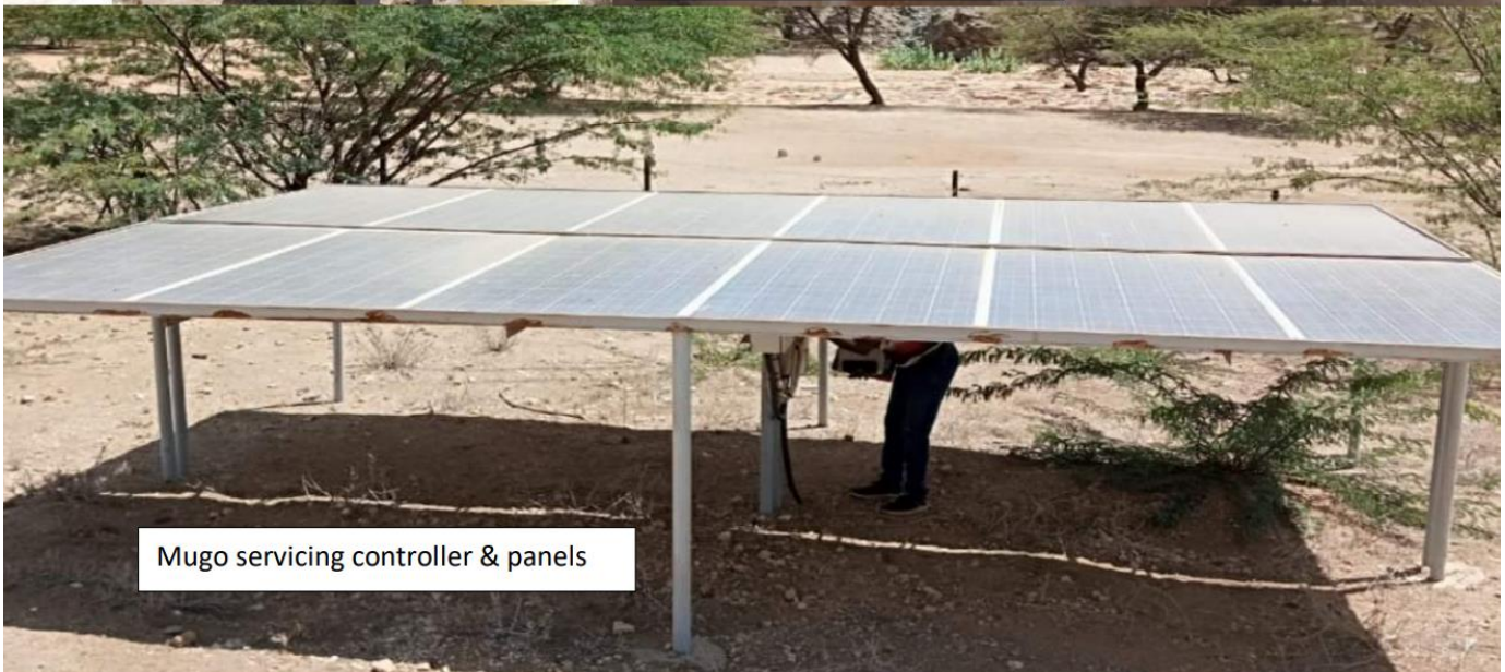
Mugo servicing controller & panels