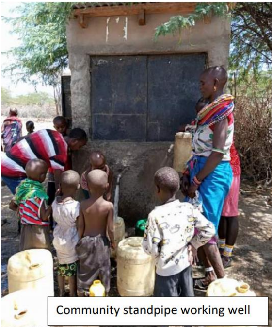
Community standpipe working well

Masikita is an area bordering the Elbarta plains – a vast grassland that is largely uninhabited due to tribal tensions. This area is the main pasture for the Samburu people, and is also an important resource for the Turkana tribe. Years of cattle rustling have made this a precarious place to live for both communities. There is also very little water in this area – only a couple of government dams that hold water for a few months of the year. We have two water projects here, Masikita - set up 10 years ago, and Masikita Simiti, 7 years ago. Our team recently carried out repairs on the community standpipe, and serviced the solar systems.