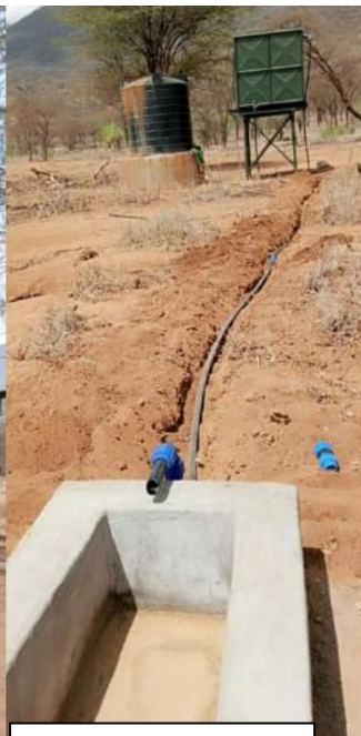
New pipeline to trough