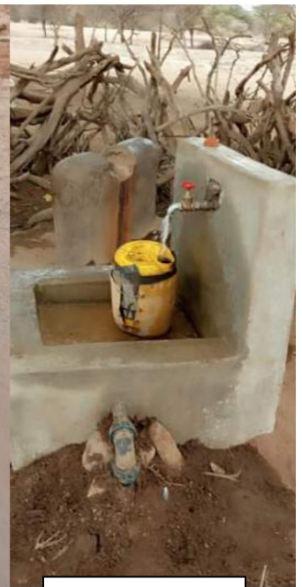
New community standpipe