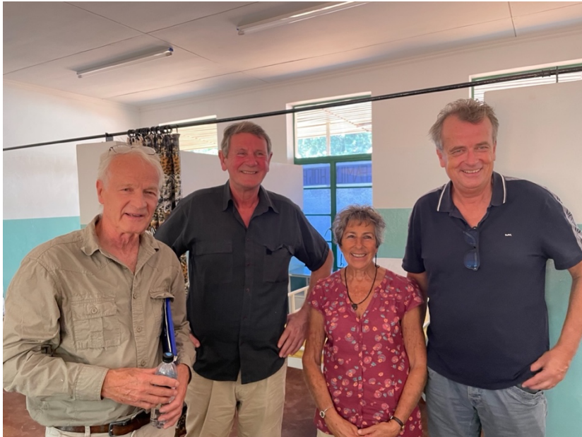
Directors of AMECA, together with doctors from Malawi.Kom.

The project was completed on time and under the stated budget, transforming a dilapidated under-used room to a functioning and well equipped 4-bed High Dependency Unit.