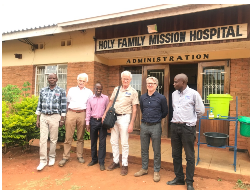
Surgical teaching visit.

The hospital is a member of CHAM, (Christian Health Association of Malawi), founded by Missionaries. CHAM is the largest non-governmental healthcare provider, making up 30% of Malawi's healthcare services and training up to 80% of Malawi's healthcare professionals. CHAM hospitals primarily serve rural and hard-to-reach areas, providing crucial, high-quality health services to some of Malawi's poorest populations.