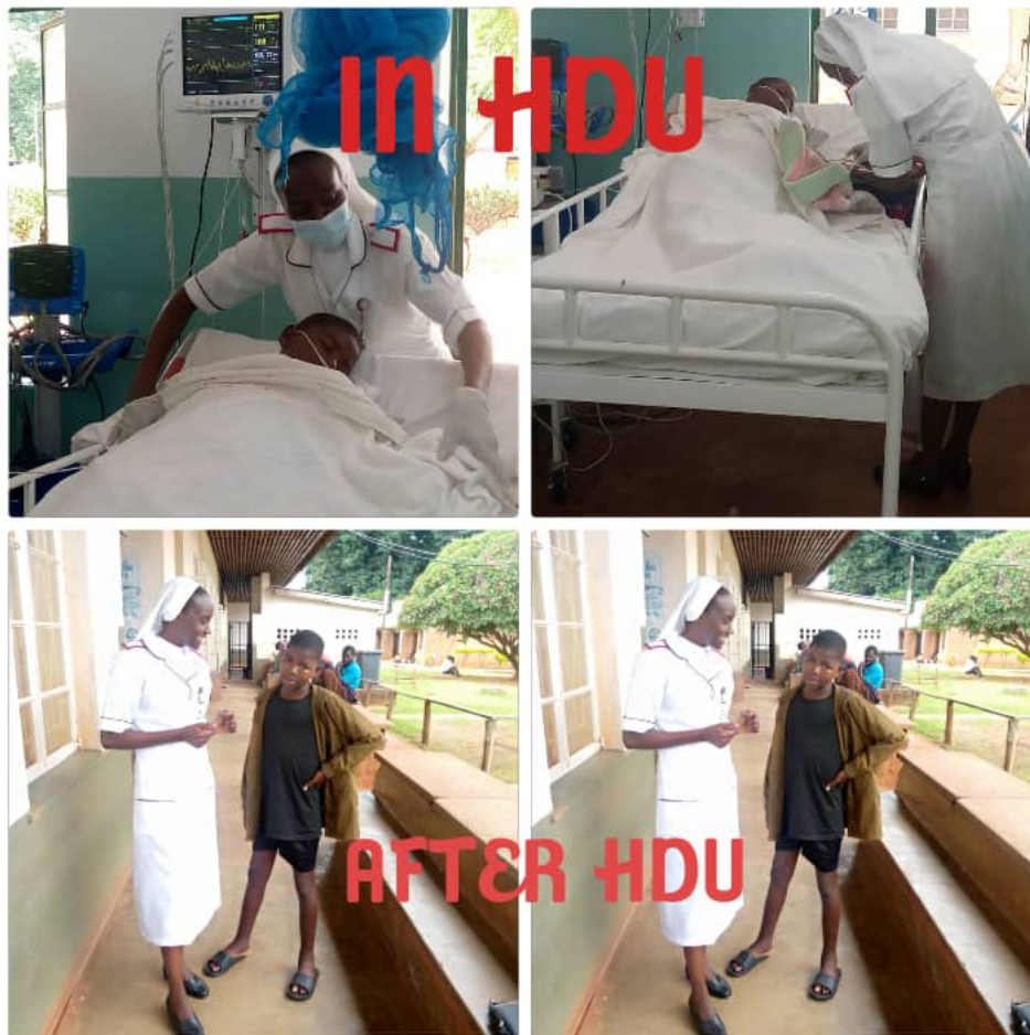
(Not for general publication please. For Foundation Eagle Report only).

Since its delayed opening to patients, a total of 13 patients have been admitted, 7 of which were admitted from the general wards and 6 from maternity. Sadly, there were 2 deaths, giving a total death rate of 15%. One of the interesting stories received concerned a boy with 3rd degree burns who was supposed to be referred to Blantyre Central Hospital for ICU care. However, the central hospital declined to take the child and he was therefore cared for in the new HDU, where he made great progress and was eventually discharged.