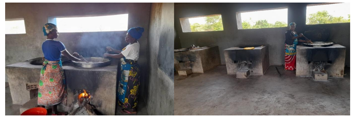
Stove being used by volunteers at Chitilila Primary School

By enhancing the infrastructure in the schools you are supporting, communities are more resilient to climatic chocks such as flooding, helping the programme remain uninterrupted during rainy seasons. Some photos of the stoves you have funded are outlined below to demonstrate how they are being used to provide over 23,000 children enrolled across 51 primary schools with a daily meal in school: