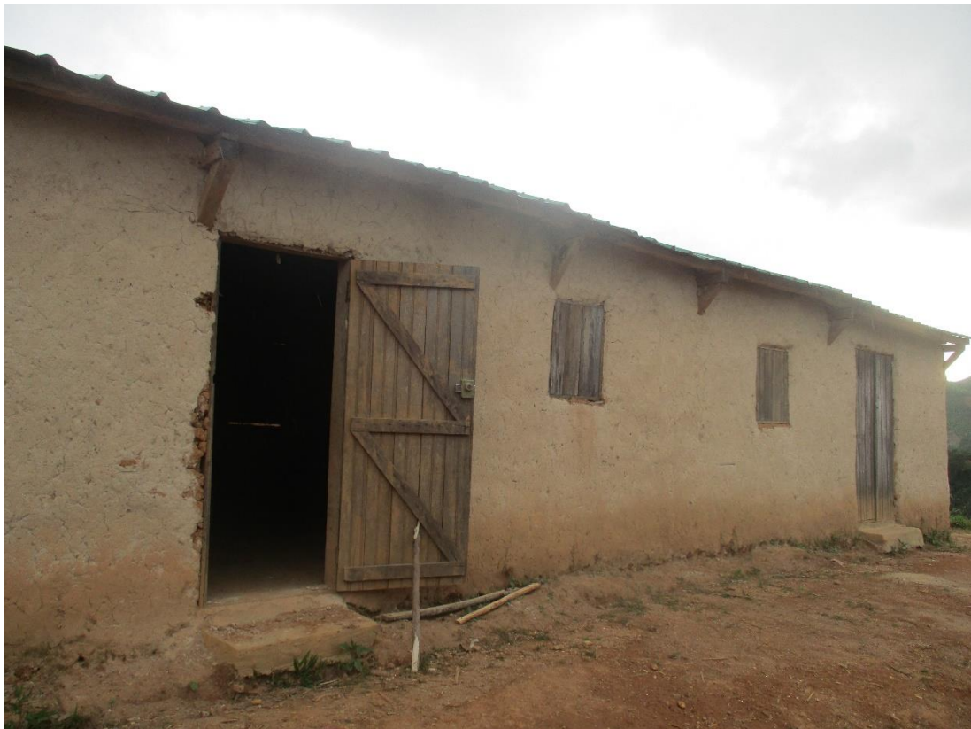
Vakoanina Primary School in its current state.

An expenditure report will be included with the final report.