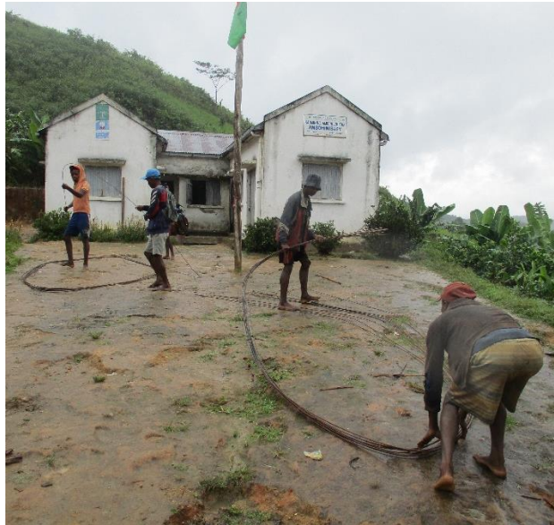
Local community members transporting rebar from the central storeroom (next to the municipality office) in Ambohimisafy, to Vakoanina.