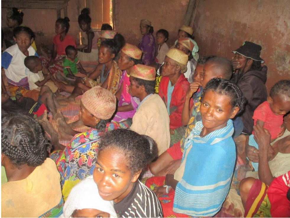
Community meeting regarding the project in Vakoanina.

No changes were made to the project design, other than the timing.