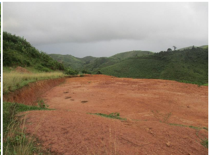
The building location after the levelling of the land was achieved.