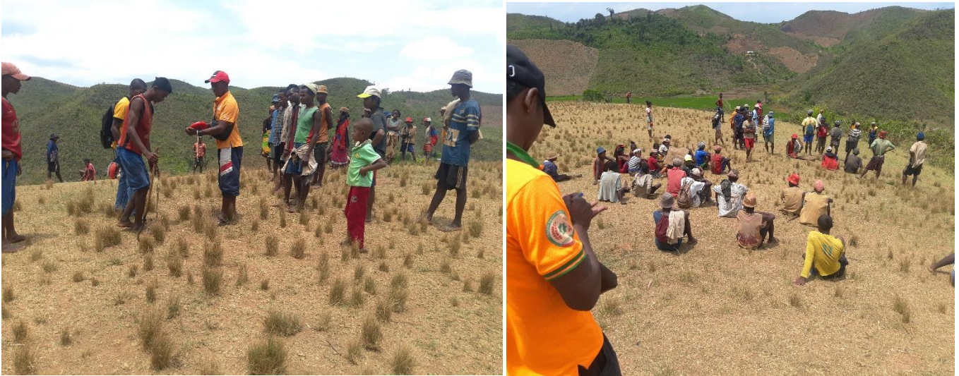
Measuring where the new school building is to be built.