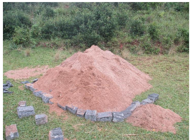
Identification of an appropriate source of quality sand (left) & sand carried on foot to Vakoanina.