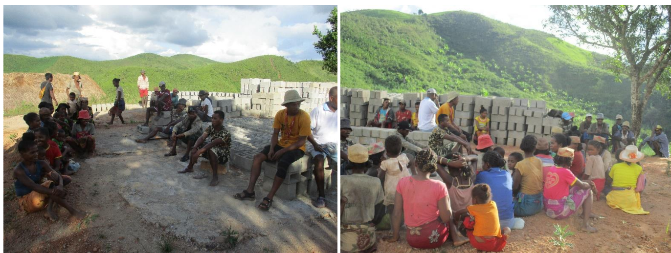
Community meeting in Vakoanina.