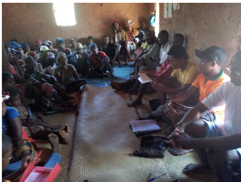
Initial meeting and training of local committee to organisation and monitor works ("COST").